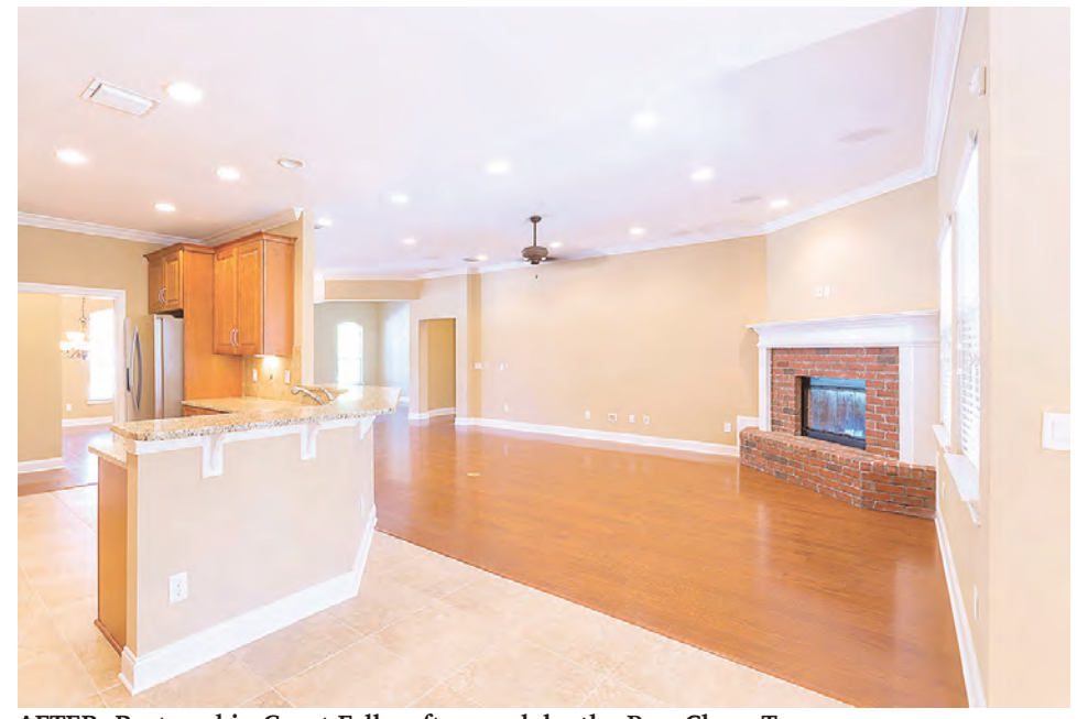
AFTER: Restored in Great Falls, after work by the PuroClean Team. Vienna/Oakton / McLean Connection & November 16-22, 2022 & 3