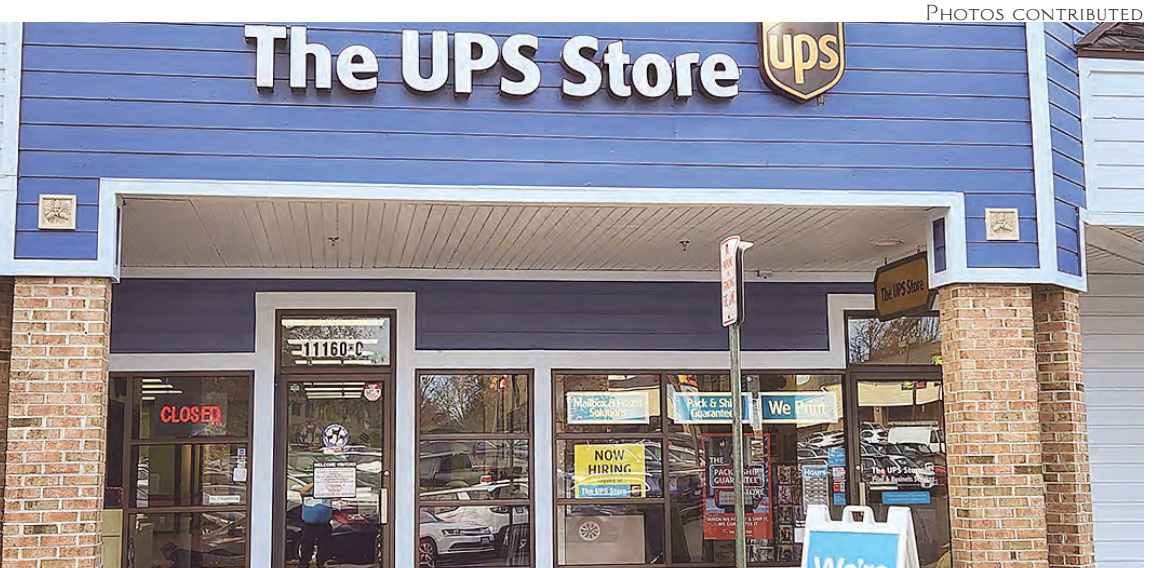
The UPS Store at 11160 South Lakes Drive in Reston, Hal Bernes owner