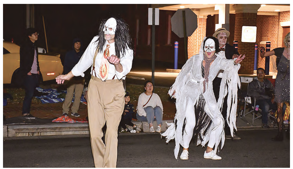
The Gotta Swing Dancers won Best in Show at the Vienna Halloween Parade for overall performance and costumes that tied in with this year's theme, "Time Machine: Vienna in the past, present and future."