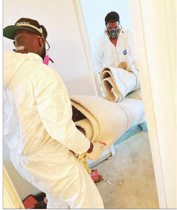
The PuroClean Team in action-Herndon fire, mold