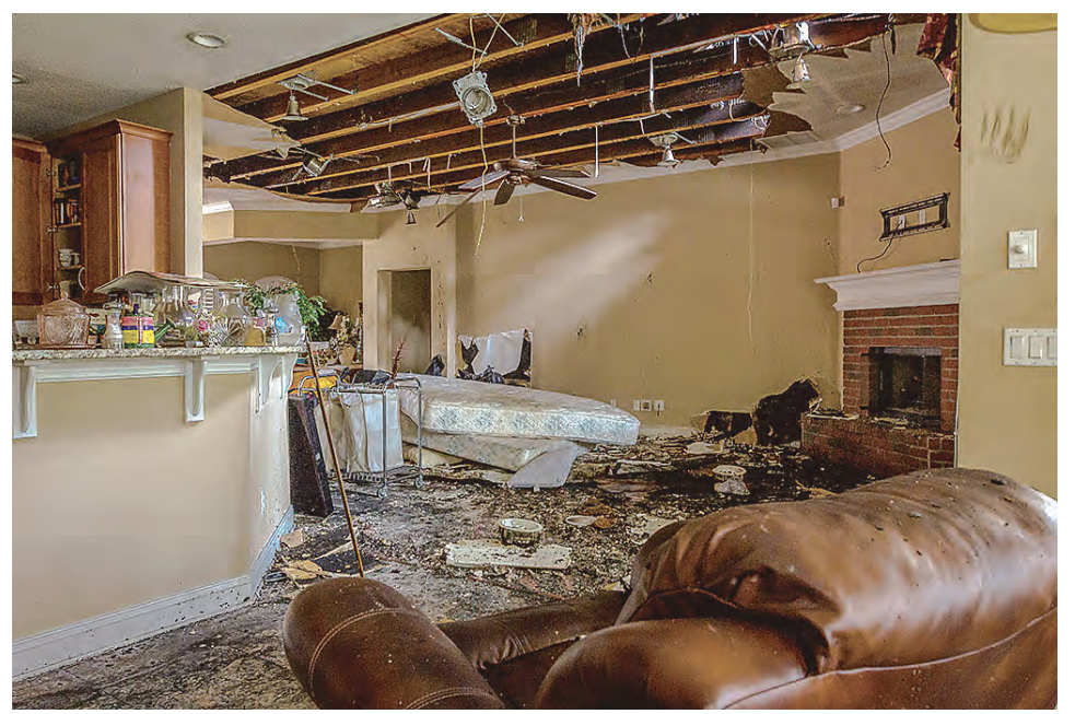
BEFORE: Water damage in Great Falls www.ConnectionNewspapers.com