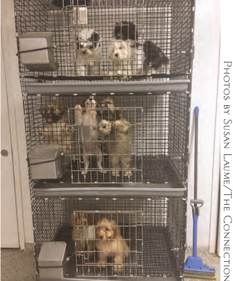
Puppy stores in Virginia have avoided regular inspection for decades.

In recent years, several states (California, Maine, Maryland, Illinois, Washington) have enacted legislation which prohibits sales of dogs, cats, and sometimes rabbits, in pet shops. Virginia has not. While Virginia's code has effectively stopped puppy mills from operating within its boundaries, puppy mill sales continue through pet shops and online sales. There are currently 20 retail puppy stores in Virginia, including three in Northern Virginia. In Fairfax County does not prohibit puppy store sales of dogs and cats; City of Fairfax requires a public hearing and obtaining a permit before starting a puppy shop business. Petland in Fairfax, Capital City Pups in Manassas, and Dreamy Puppy in Fairfax County, were closed after cruelty charges. Some area stores now are the sub-