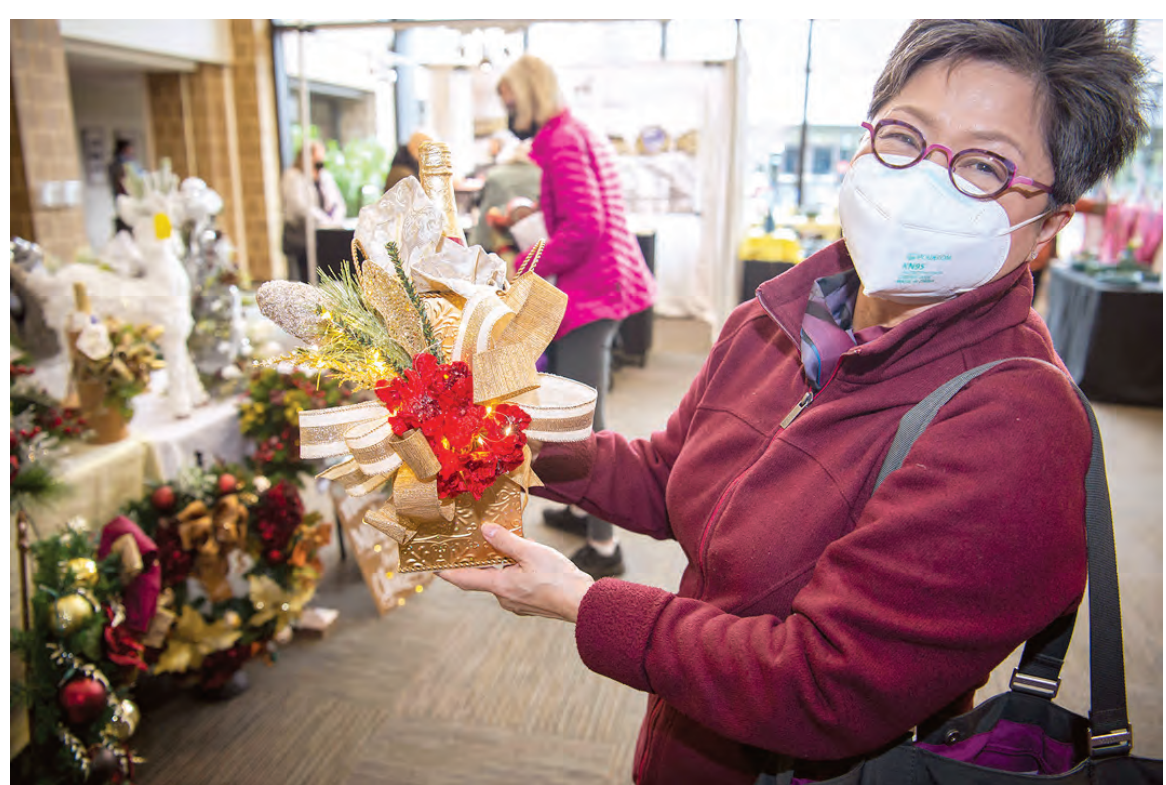
The McLean Holiday Art & Crafts Festival will take place Dec. 2-3, 2022 at the McLean Community Center.