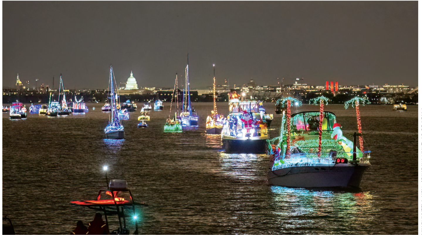
More than 50 boats line up along the Potomac River as part of the 22nd annual Holiday Boat Parade Dec. 3 along the Alexandria waterfront.