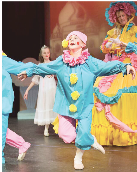
The Mia Saunders School of Ballet presents "The Nutcracker" on Dec. 10-11 at Centreville High School.

Holiday Market. At 2704 Mount Vernon Ave., Alexandria. Del Ray Artisans 27th Annual Holiday Market offers unique handmade fine arts and crafts from local artists. Choose from wall art, pottery, photography, jewelry, glass, and much more! Plus 2023 wall calendars to support Del Ray Artisans nonprofit. Free admission. Market is the first three weekends in December (Dec 2-4, Dec 9-11, Dec 16-18). Different artists each weekend! Open Fridays 6-9 p.m., Saturdays & Sundays 11 a.m.-6 p.m.