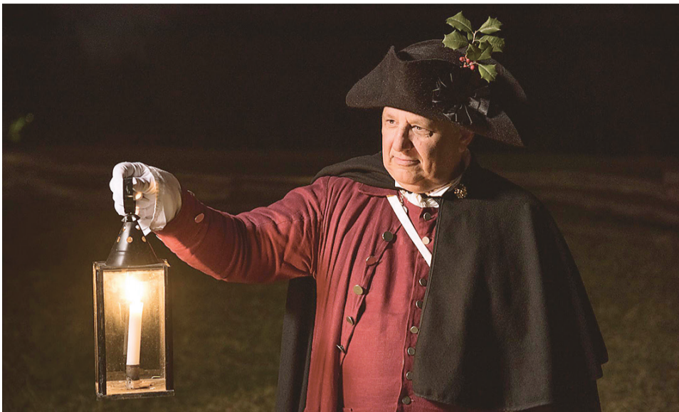
Take a Holiday Candlelight Tour of Mount Vernon Estate Dec. 9, 10 and 18.