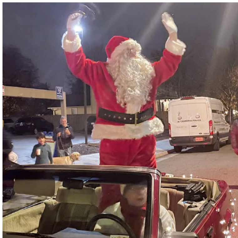
Santa arrives in Del Ray prior to the Dec. 4 tree lighting in Pat Miller Neighborhood Square.