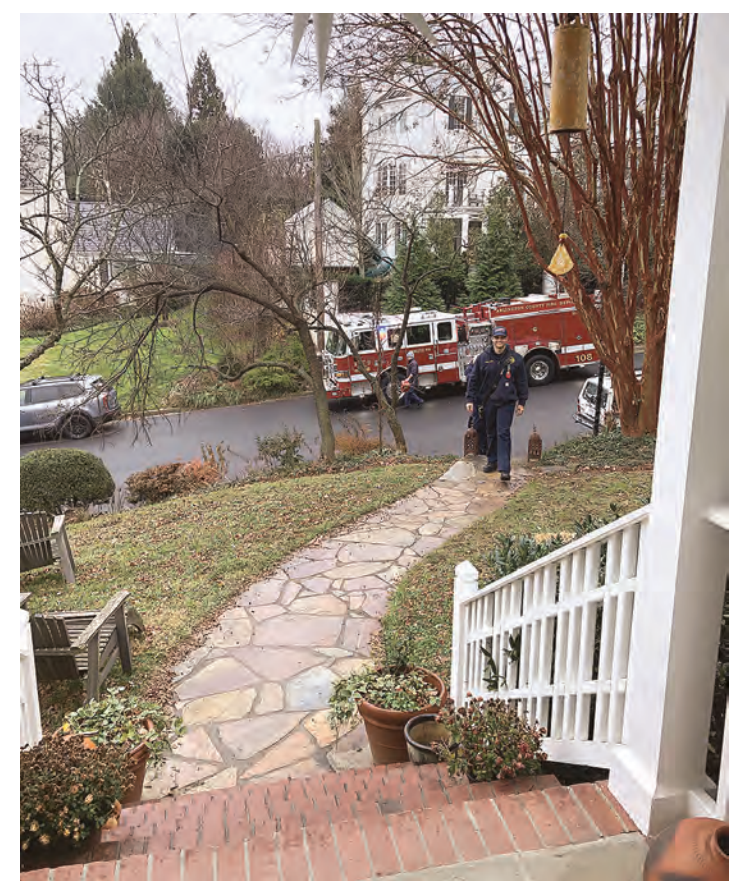
The firefighters arrive for a Home Safety Check. Having the truck there made other neighbors think about their own fire