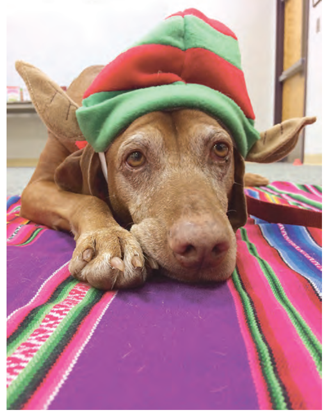
Pets, often included in holiday finery, whether they like it or not, include this reluctant elf, Tia, in Springfield