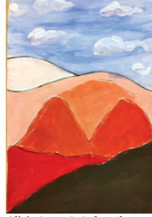
Olivia Song, 8, 3rd grade,