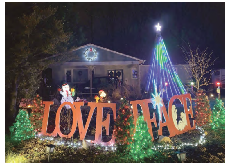
This home on Sydenstricker Road goes tall and bright with its lighted wish of love and peace for all the world