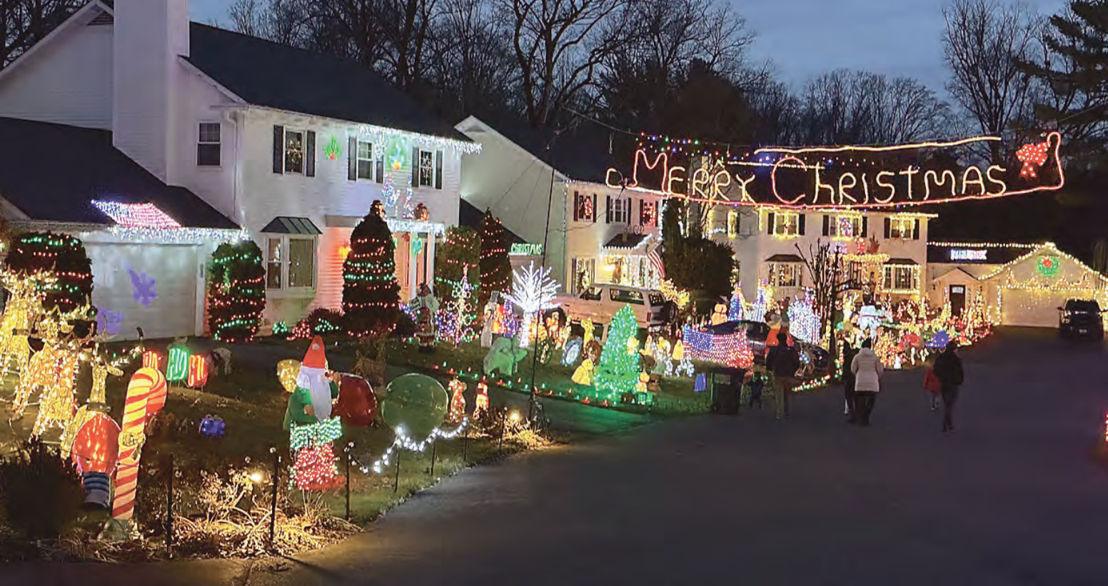
Burke 's Marshall Pond Road community display has been growing for several years, making Fairfax County's noted list of "Tacky Christmas Lights"