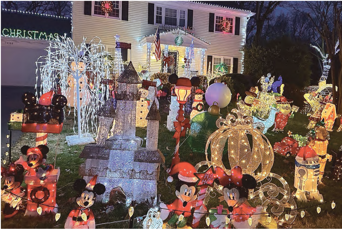
This Marshall Pond Road homeowner may soon be out of yard space or reach the extension cord limit