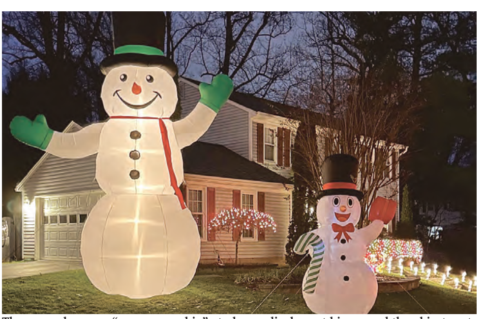
There may be some "one upmanship" at play as display get bigger and the objects get larger and larger, like this two-story house-height snowman found on Schoolhouse Woods Road, Burke

Arlington Connection ❖ December 21-27, 2022 ❖ 7