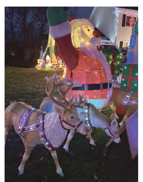
Many use traditional symbols of Christmas, such as Santa and his reindeer