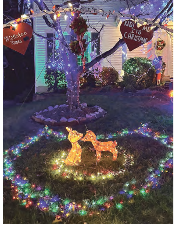
Mistletoe to capture the romance of holiday kisses is highlighted with heart symbols