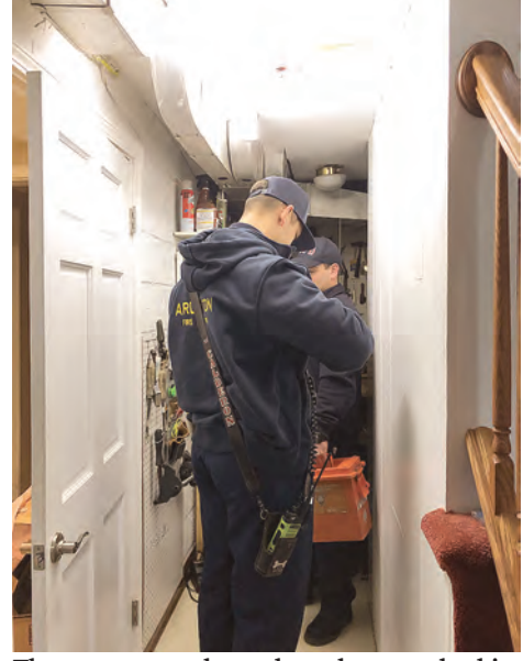
The team goes through each room, looking for smoke detectors or the absence thereof.

"We started the safety check program a while back when there were people who died in a fire because their smoke detectors weren't working," said Paramedic/Firefightwww.ConnectionNewspapers.com