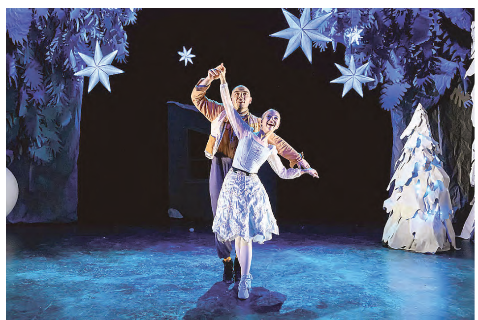
"Snow Maiden" will be presented at Synetic Theater in Arlington through Dec. 23, 2022.