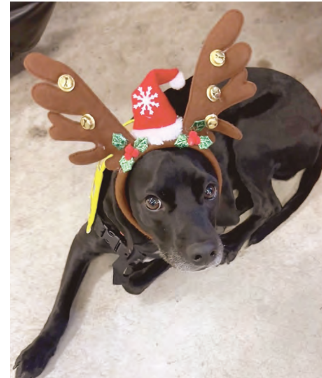
George, a finery accepting 'rein-dog' in Alexandria dresses to assist the Fairfax County Fire & Rescue Department