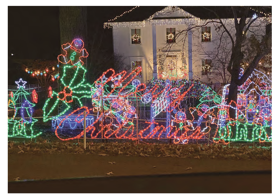
This intricate 2019 yard display with its elegant Christmas greeting and hundreds of lights, a draw for drive-bys on Lorton Rd for many years, is bucking the trend of 'bigger every year' with a simple display in 2022