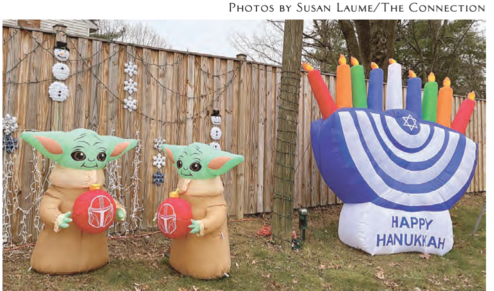
Along Hooes Rd, a display includes both traditional religious symbolism and the quirky futuristic spiritualism of Jeti Master Yoda