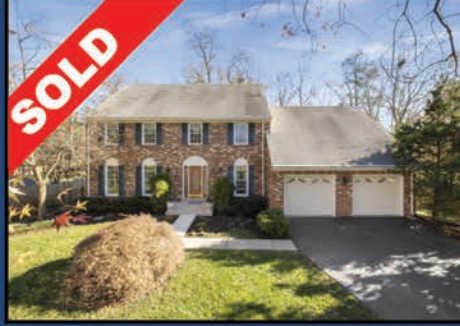
8901 Mcnair Ct $975,000