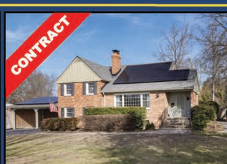
3713 Washington Woods Dr $1,399,000 5104 Mount Vernon Mem $805,000