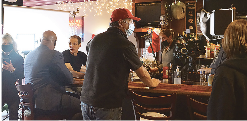
At Southside 815 restaurant in Old Town, shooting a scene at the bar.