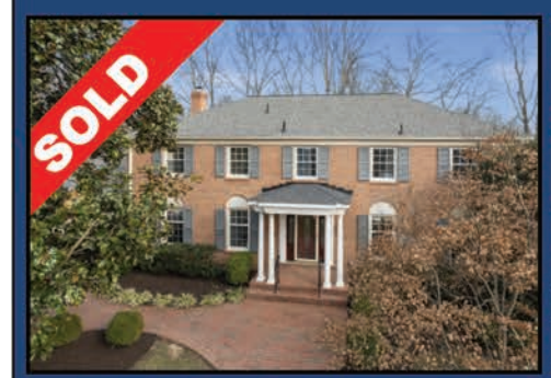
4201 Pickering PI $890,000