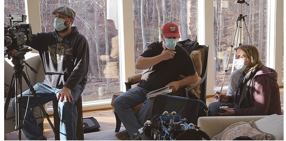
On a set in a house in Great Falls, the windows provide natural lighting.