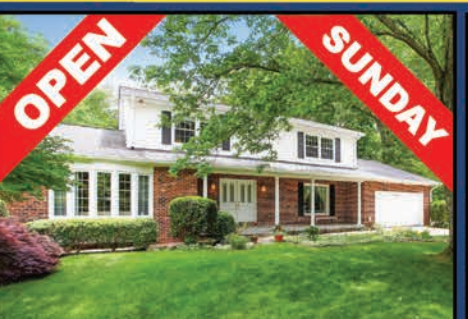
9415 Macklin Ct $1,095,000