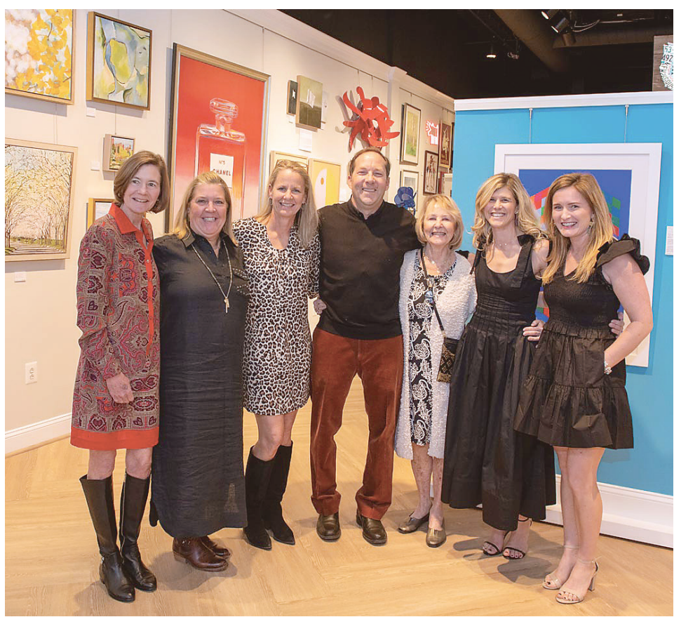
Nepenthe Gallery will celebrate its One-Year Anniversary on Thursday, March 16, 2023.