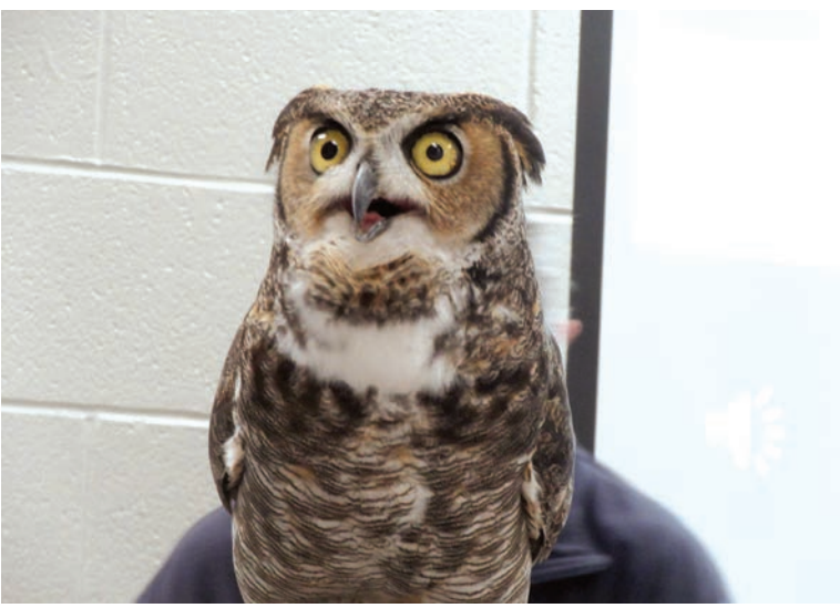
A great horned owl..

Fringes on the leading and trailing edges of their wings enable them to fly silently. With sharp talons, they can catch and squeeze prey, like mice, shrews, voles, lizards and small birds. Dennison called them "ambush predators," birds that sit motionless awaiting prey to come close before pounc-