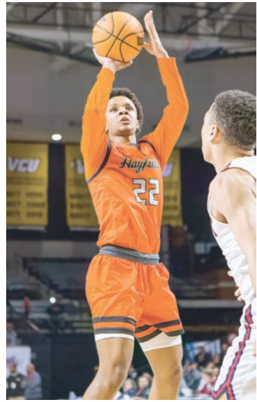
Phenix Card goes for a short jump shot.