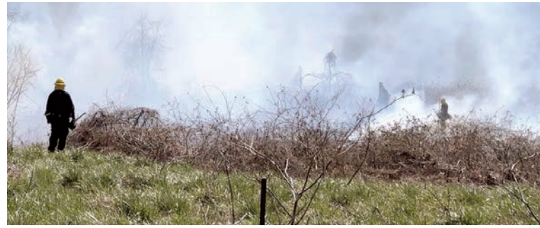
During the burn, much of the task is monitoring the fire direction and containment.