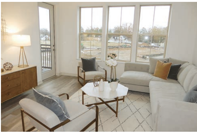
A condo living room with large windows and a door leading to the balcony.