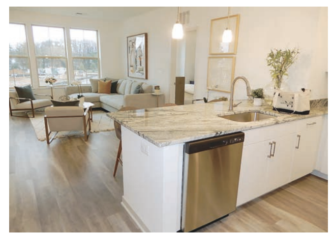
The kitchen and living room of a two-bedroom unit.