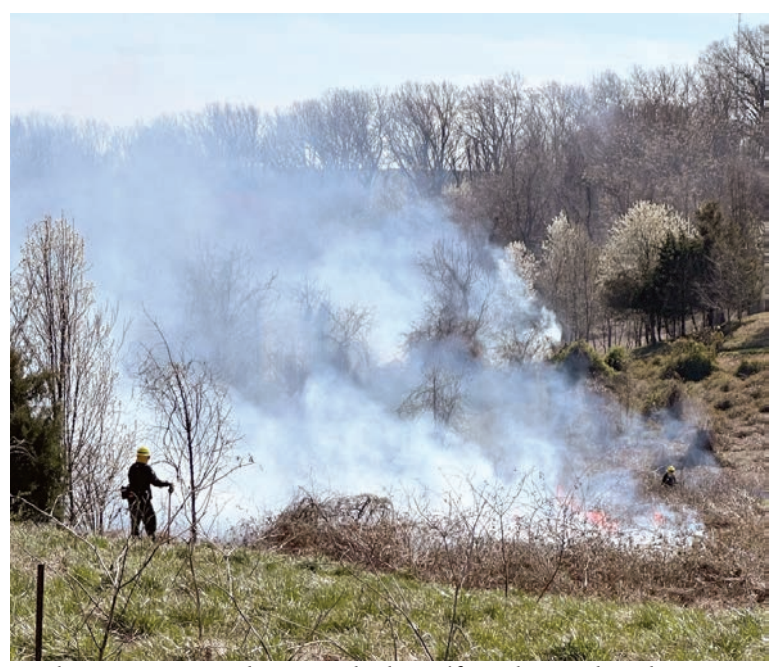
Workers are prepared to stop the burn if smoke reaches the nearest roads, but the natural shape of the bowled meadow area helps to contain both fire and smoke within the burn area.

"Prescribed fires also 'knock back' woody vines, shrubs, and invasive trees that would turn into woods, and then forest, which are more costly to remove in order to create better [natural] resource areas," Burke added. "Fire can be used to control some invasive species and promote fire adaptive native ones." This burn aims to "reduce the abundance and dominance of invasive plants, especially Porcewww.ConnectionNewspapers.com