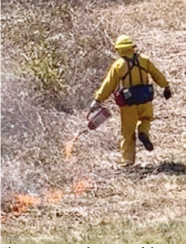
Fire team member uses drip torch to start a line of fire in prescribed burn area in Lorton's Laurel Hill Park.