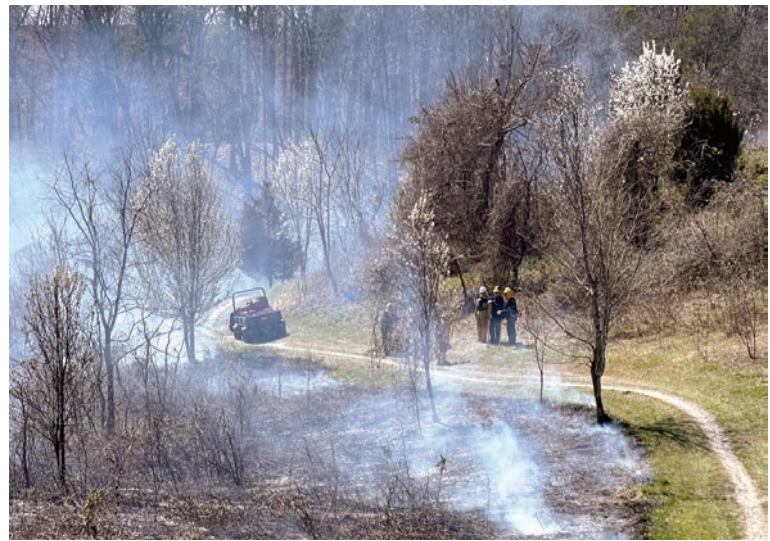
Completing the burn of one section, the fire team prepares for next burn section.