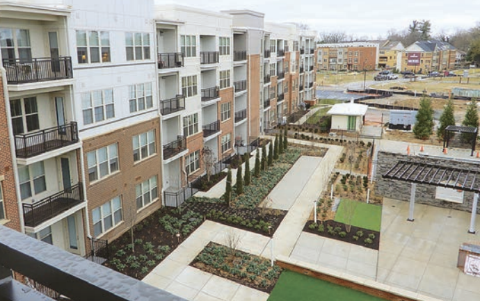
A partial view from a second-floor balcony, showing condo exteriors and gardens in the courtyard.

"That sparked my interest," he said. "I also like that it's off the Route 29/Route 50 intersection and a mile from I-66. It's near nice shops, places to eat and the Amazon Fresh;