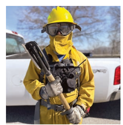
With an extraterrestrial appearance, fire team members don helmets, goggles, masks, flame-resistant gloves and clothes, and carry radios and special fire tools, like this combination shovel and rake, to manage fires safely.