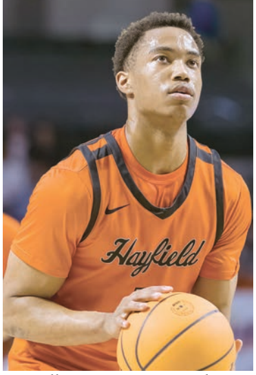
at the foul line