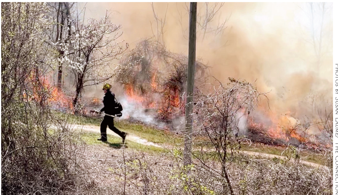
Aggressive ignition and light breezes helped to generate enough intensity to burn plant debris in the targeted area in Lorton's Laurel Hill Park as a team member walks to another vantage monitoring point.