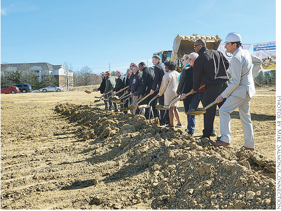
Officials of all sorts break the ground in Franconia.

This new combined facility will be approximately 90,000 square feet with better parking and access. The 28,000-squarefoot Police Station and the 4,200-square-foot Franconia District Supervisor's Office will share a space with the Franconia