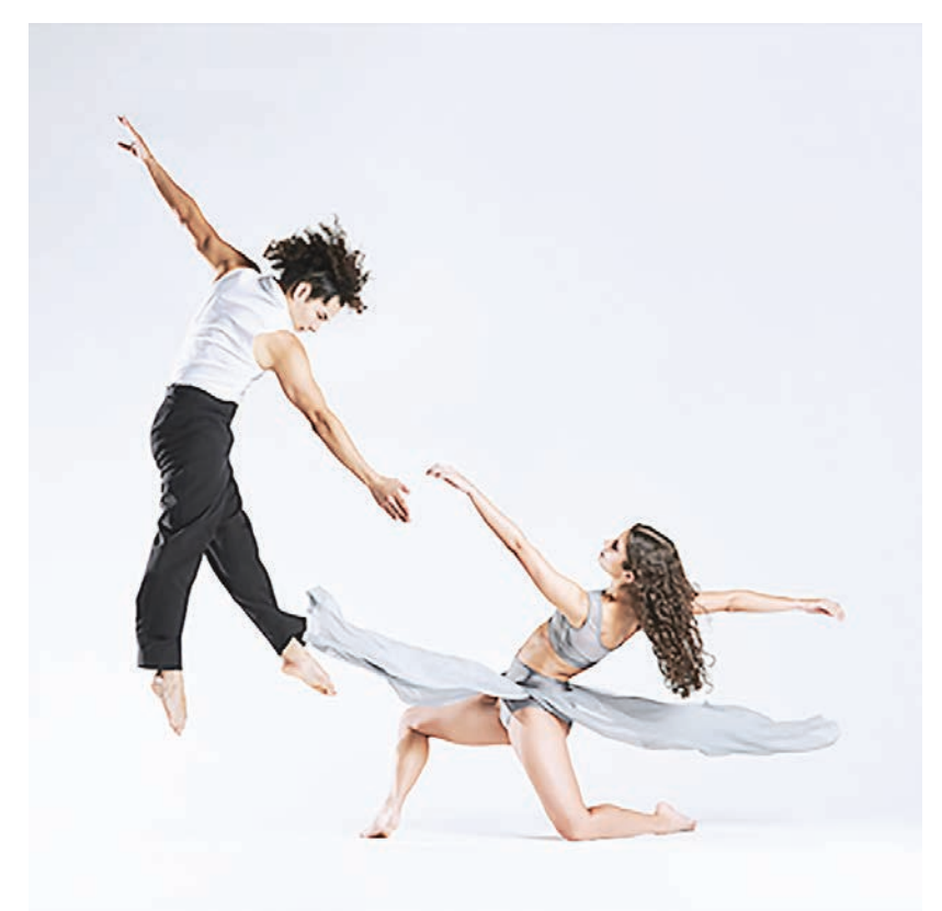
The Mason Dance Company Gala Concert will be held at GMU Center for the Arts on March 24-25, 2023.

Texture Photography Exhibit. 11 a.m. to 4 p.m. At Falls Church Arts Gallery, 700-B West Broad Street, Falls Church. Sixty photographic images from 37 photographers will be featured in "Texture, A Photography Show" on view at Falls Church Arts Gallery. The submissions vary widely and range from country