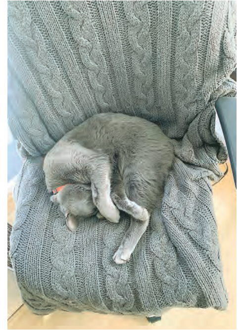
Shilo sleeps on his favorite chair.