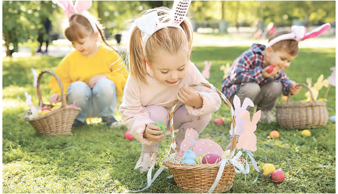
An Epic Easter Egg Hunt will take place Saturday, April 8, 2023 at Christ Church in Fairfax Station and many other places. But here is some advice on how to plan your own.

❖ There is no correct way to fill an egg. Some people like to put