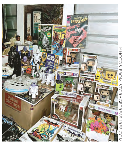
Only on rare occasions will unit contents be obvious treasure, such these abandoned collector's items, final bid $460.