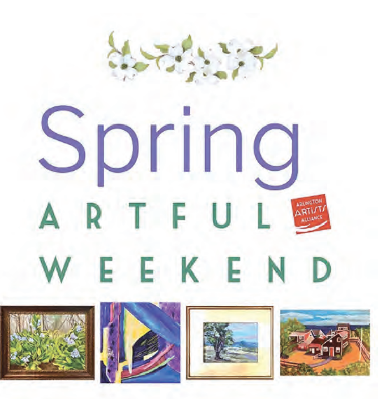
Spring Artful Weekend takes place April 14-16 at Fort C.F. Smith Park in Arlington.

Edible Landscaping. 6:45 p.m. www.ConnectionNewspapers.com