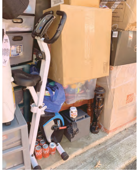
Abandoned self storage unit content - is it trash or treasure? Final bid $310.