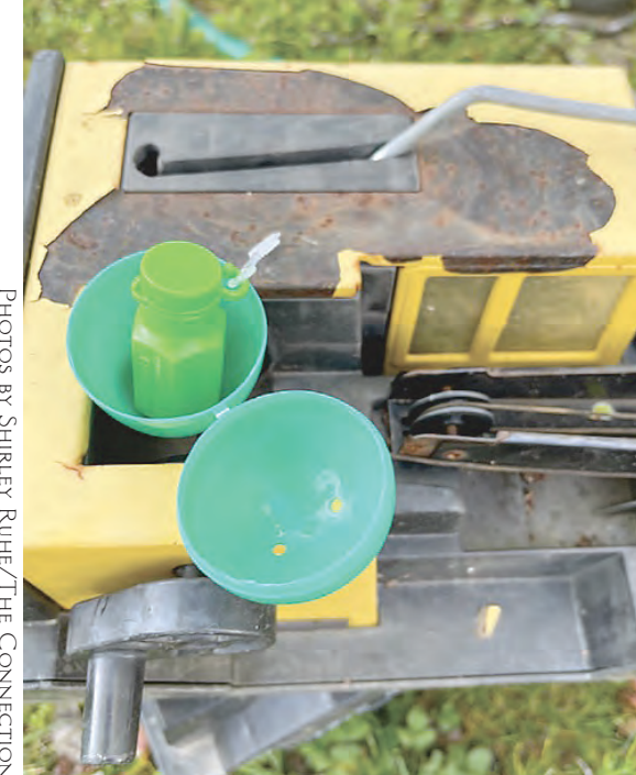
Mix it up at your Easter egg hunt with a few eggs in plain sight, the white egg filled with silly putty, the green egg filled with a miniature bottle of bubbles, a variety of colors filled with jelly beans and other candies and the golden egg which earns you a prize.

one kind of candy in an egg and others like to mix up a variety for the egg. These days pre-packaged eggs are available with miniature toys of all sorts but half the fun is getting a group together ahead of