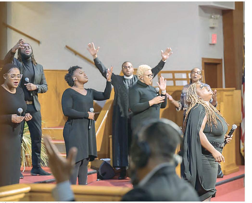
Alfred Street Baptist Church Palm Sunday, 2023.