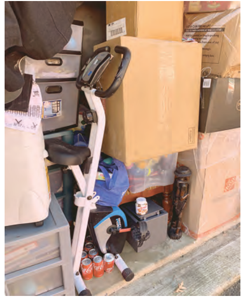
Abandoned self storage unit content - is it trash or treasure? Final bid $310.