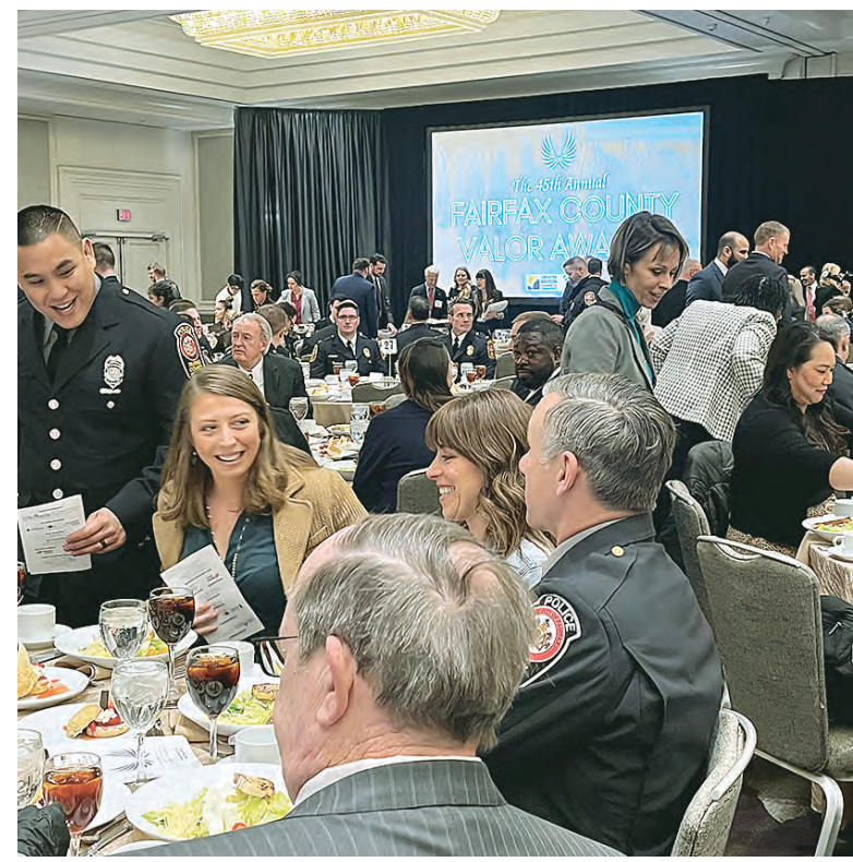
Mingling and good times at the 45th Annual Fairfax County Valor Awards.