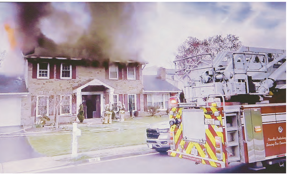
Firefighters from West Centreville Station 38 helped quell this house fire in Chantilly.

Firefighters quickly got the flames under control and extinguished them. The house had working smoke alarms which activated. Fire investigators determined the fire was