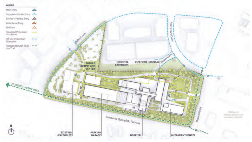
This Inova diagram was from a slide show that was presented in May 2022.