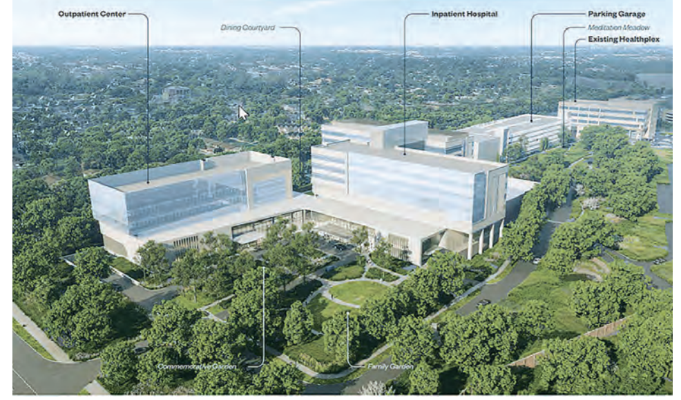
An artist rendering of the new hospital.