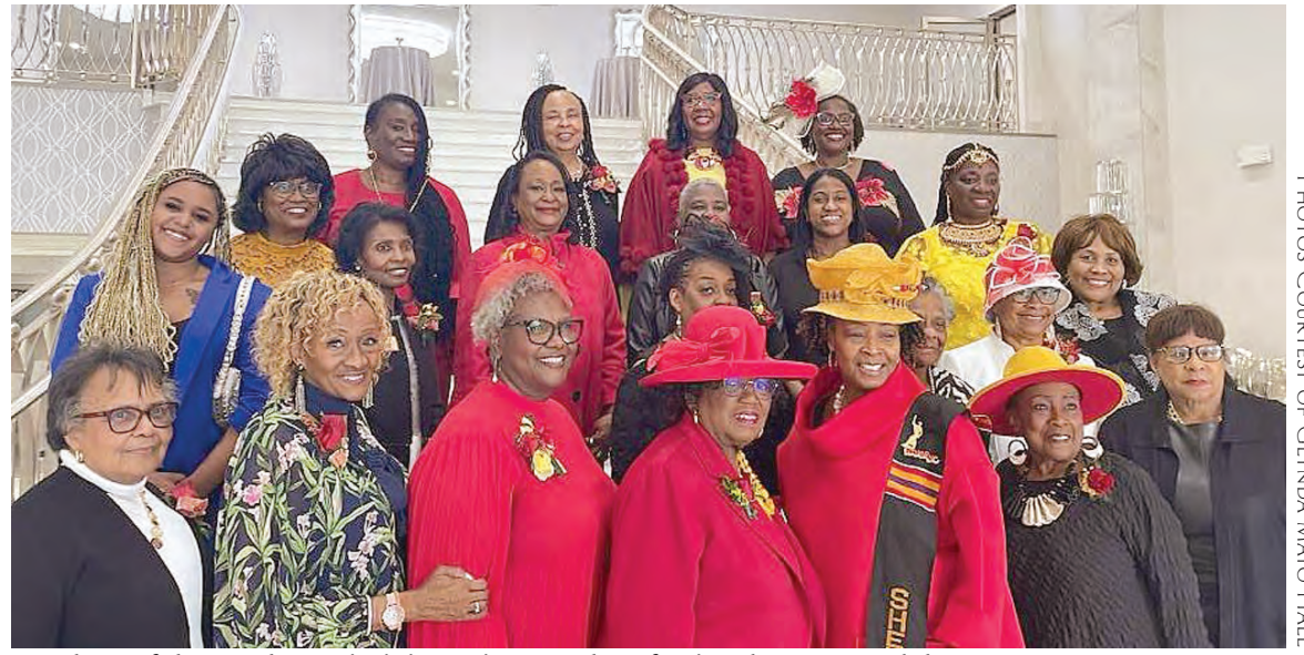
Members of the Northern Virginia Business and Professional Women's Club.