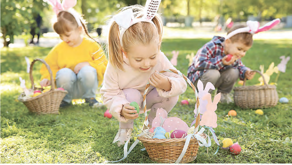
An Epic Easter Egg Hunt will take place Saturday, April 8, 2023 at Christ Church in Fairfax Station.

on view at Falls Church Arts Gallery. The submissions vary widely and range from country and city scenes to bodies of water, botanicals, and geographical formations, among others. Visit the website: www.fallschurcharts.org.