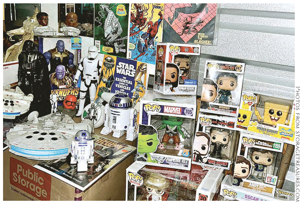
Only on rare occasions will unit contents be obvious treasure, such these abandoned collector's items, final bid $460.