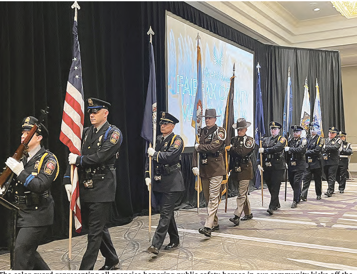
The color guard representing all agencies honoring public safety heroes in our community kicks off the 45th Annual Fairfax County Valor Awards hosted by the Greater Reston Chamber of Commerce.