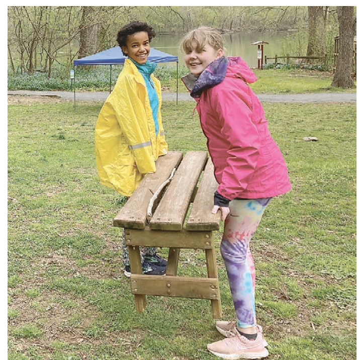
Members of the Climate Conservation Club at Great Falls Elementary School help set up for the Bluebell Walk at Riverbend Park.