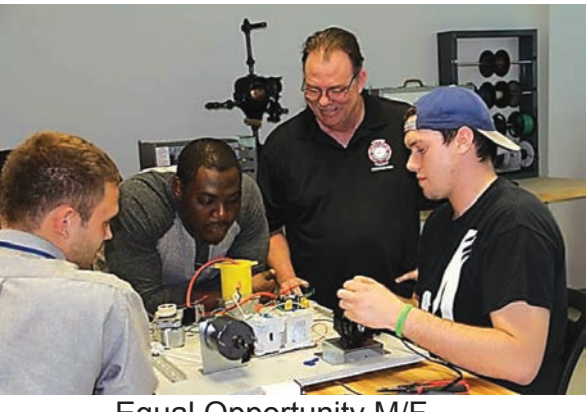
Equal Opportunity M/F

For additional information scan the QR Code.