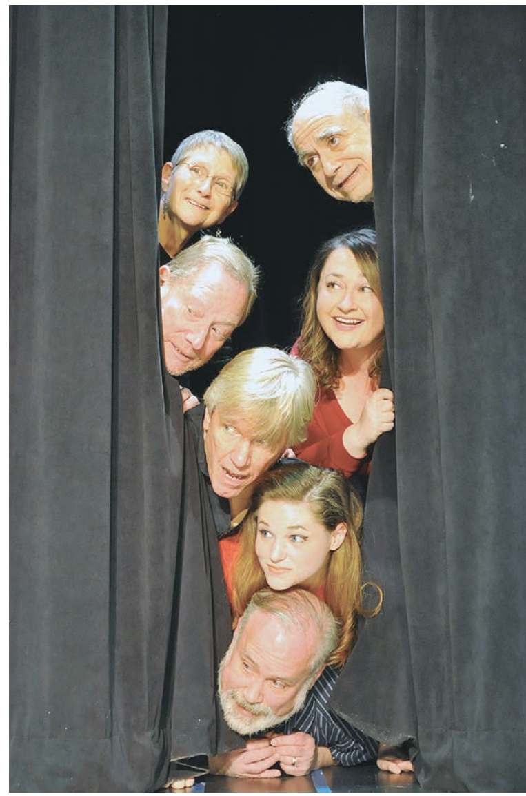
"Unnecessary Farce" can be seen April 21 to May 7, 2023 at the Vienna Community Center.