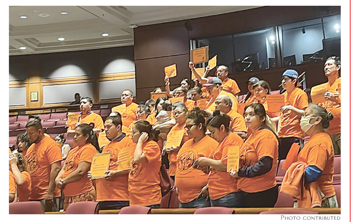
About 80 residents of mobile home parks along Route 1 turned out to the budget hearings.