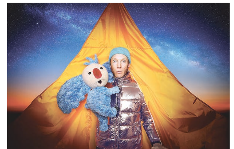
Windmill Theatre Company of Australia presents "Hiccup!" on Sunday, April 23, 2023 at the McLean Community Center.

703-663-7881. Visit the website: www. nvss.org