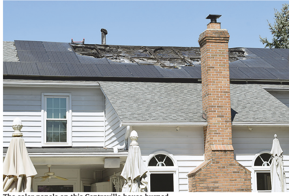
The solar panels on this Centreville house burned.