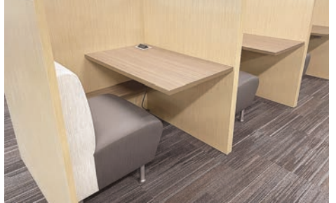
Potomac Library was lucky library number 13 to be refurbished. Here, computer workstations, built for one.