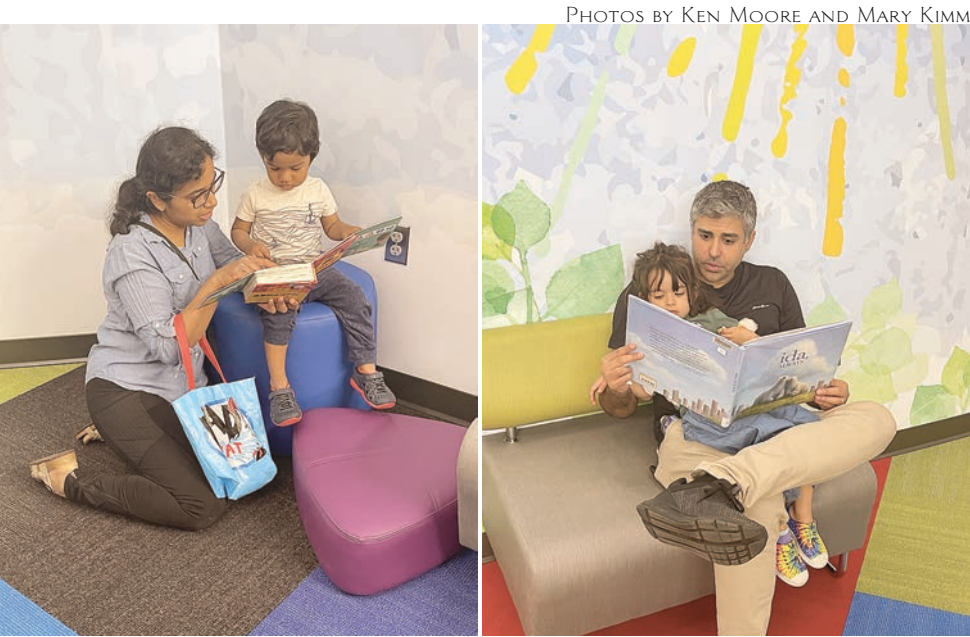
The new children's section was a hit with parents and children of all ages.