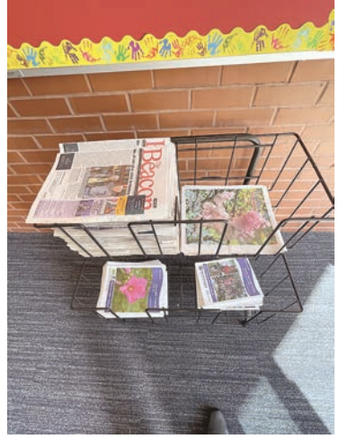
Pick up the Potomac Almanac and the Senior Beacon on your way in or out.