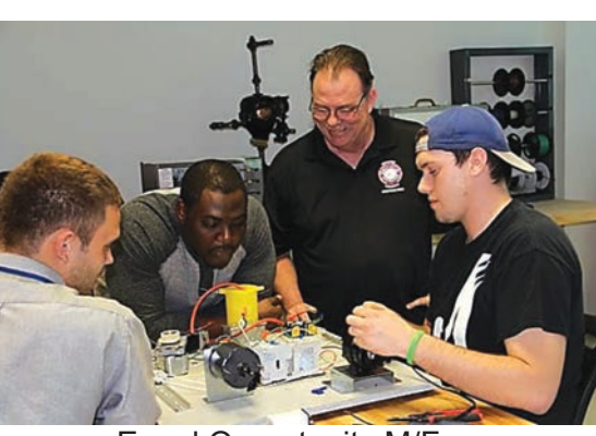
Equal Opportunity M/F

For additional information scan the QR Code.