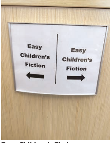
Easy Children's Fiction