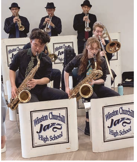
Winston Churchill's award winning jazz ensemble performed at the Potomac Library's Grand Opening reception attended by more than a hundred people Saturday morning.