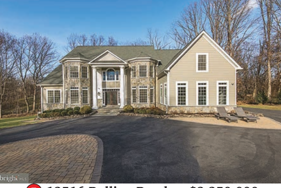
(5) 12516 Rolling Road — $2,250,000