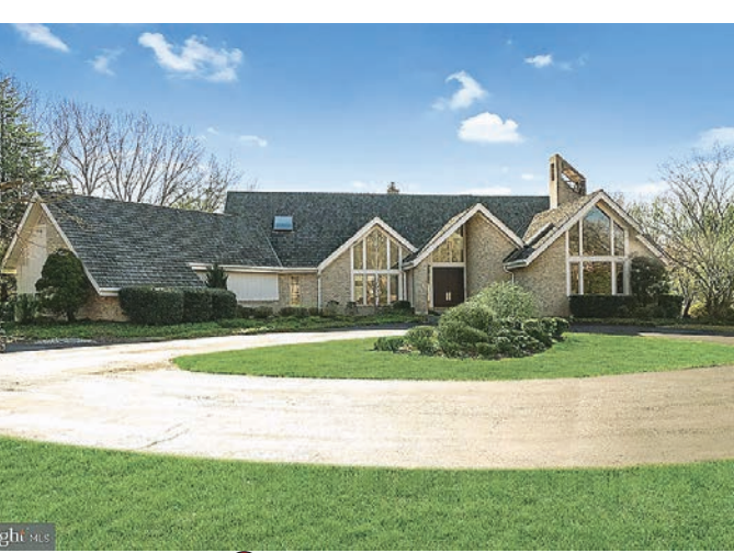
3 9740 Sorrel Avenue — $2,599,000

In March, 2023, 27 Potomac homes sold BETWEEN $5,825,000-$660,000.