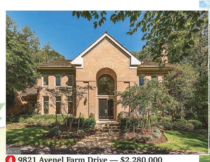
4 9821 Avenel Farm Drive — $2,280,000