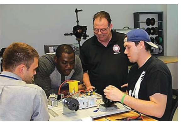
Equal Opportunity M/F

For additional information scan the QR Code.