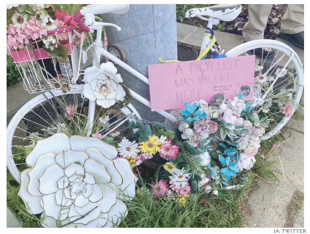
The white ghost bike for Sarah Langenkamp on River Road in Bethesda.