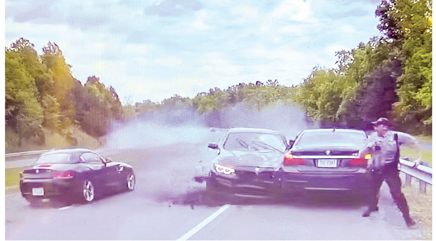
In the video, from which this photo was made, the car in the center came sideways across the median, crashed into two vehicles and nearly struck the police officer.

Prior to impact, the officer - who police didn't identify - had stopped a speeder driving 73 mph in a 50-mph zone. While he and 4 The Connection May 10-16, 2023