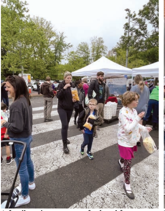
A family enjoys popcorn for breakfast on opening day at the Reston Farmers Market.

https://www.fairfaxcounty.gov/ parks/farmersmarkets