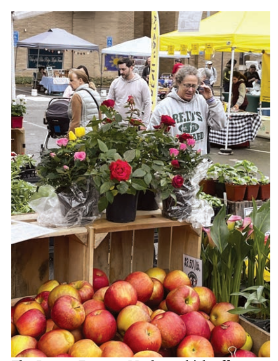
The Reston Farmers Market, which offers SNAP matching and 34 vendors, is held Saturdays, now through Dec. 2, 2023, at 1609 Washington Plaza N., Reston.

If you missed your neighborhood's county farmers market day, consider visiting one of the other locations. There are ten-Annandale, Burke, Kingstowne, Lorton, McCutcheon/Mount Vernon,