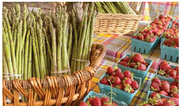
The Oak Marr Farmers Market, which features 11 vendors, is held Wednesdays from May 30- Nov. 8, 2023, at 3200 Jermantown Road in Oakton WWW.CONNECTIONNEWSPAPERS.COM

SNAP is accepted at four locations, Reston. Mount Vernon, Annandale and Lorton.