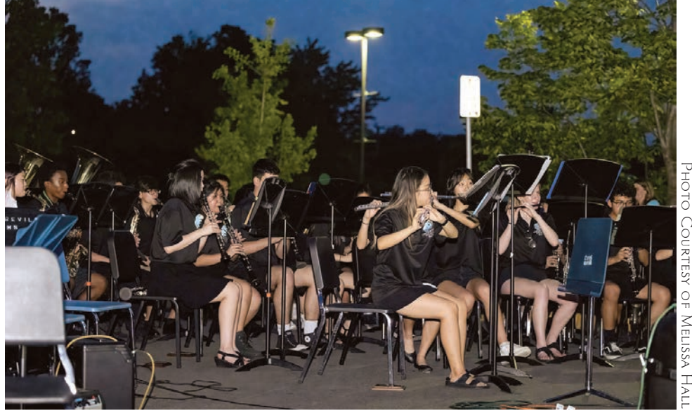
Student musicians playing piccolos, clarinets and tubas.

formed. Two vocal selections, "You Make Me Feel So Young" and "Don't Know Why" will showcase student singers from the Centreville Choral Department.