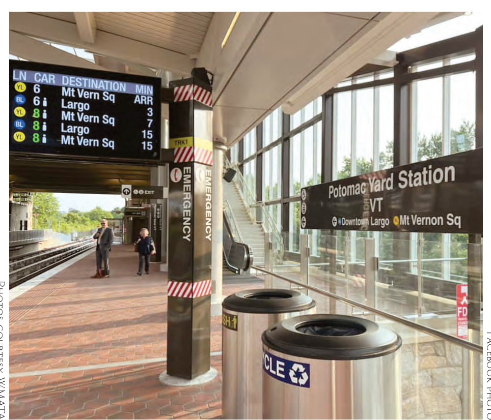
The Potomac Yard station between Braddock Road and Washington Reagan National Airport services the Blue and Yellow Metro lines.