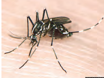
Ary Farajollahi, Bugwood.org Asian Tiger Mosquito, Aedes albopictus