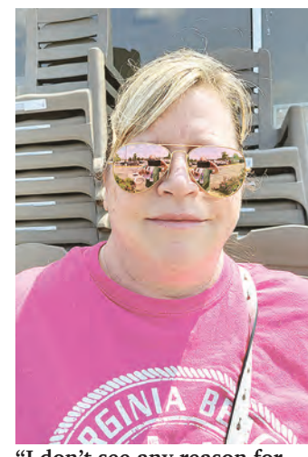
"I don't see any reason for