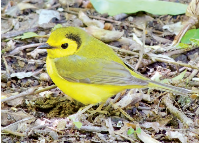
Hooded warbler, one of 35 possible warbler species at Monticello

stool and retreated to the knoll at the top of the park. "I heard a lot of woodpecker chatter and looked up to see an adult Hairy Woodpecker feeding a chick in a tree hole." She says she retreated because "obviously the parents were upset with me being there.