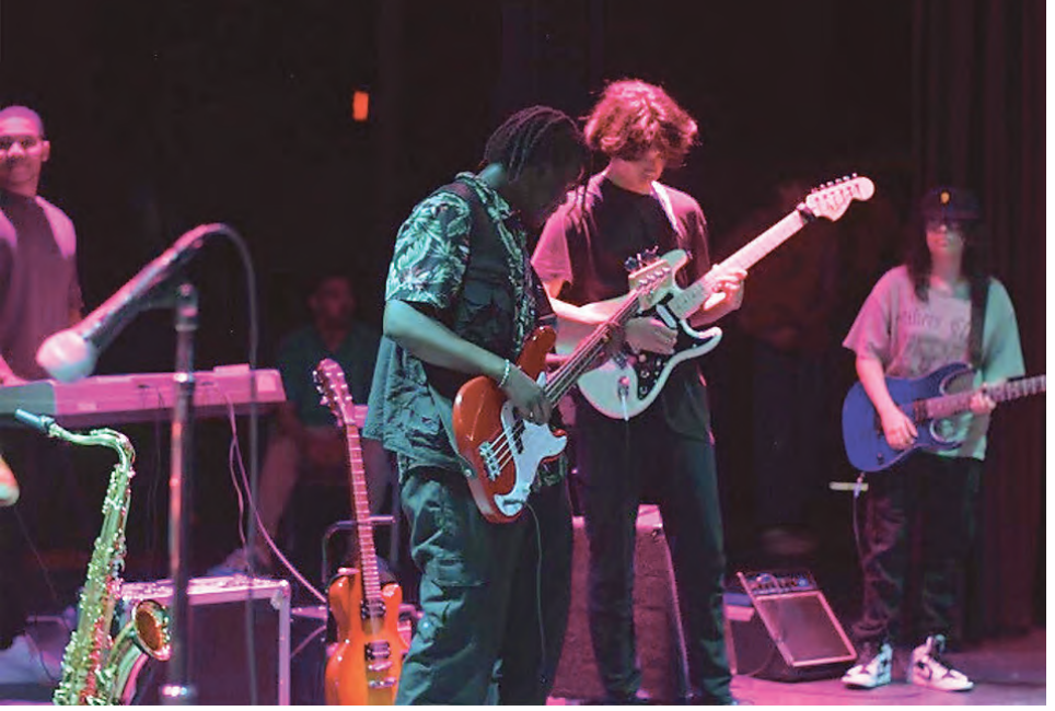
The music production is high tech, but it still takes a band with guitars, drums