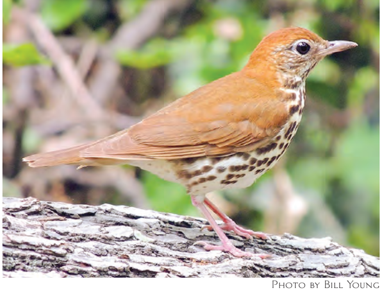
Wood thrust at Monticello Park, one of the first birds heard and then spotted at Birdathon.

By the time the day is over she and the team have tallied 52 different species of birds including 7 different warblers. She decides to make one last trip to the top of the park to see if she could see anvthing flying in from neighboring houses and was rewarded with a flicker as the final bird of the day warblers there were scarlet tanaand bringing the team's grand total