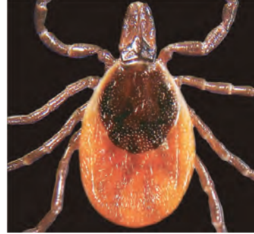
Research Service, Bugwood.org