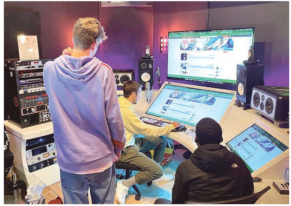
Students at the West Potomac Academy studio.

Mount Vernon's Hometown Newspaper • A Connection Newspaper