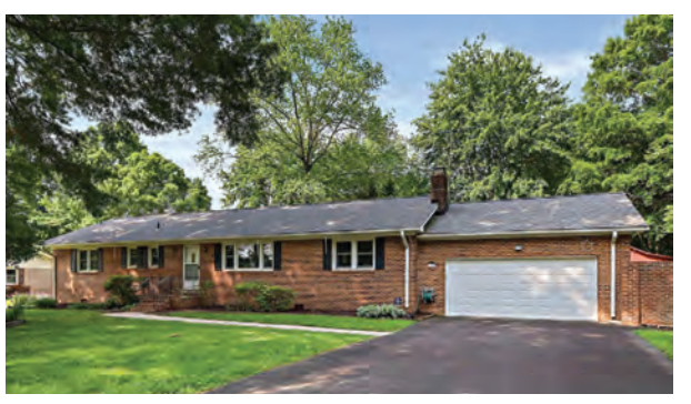
Hybla Valley Farms | $600,000

Nestled in a charming neighborhood, 7824 features 3 spacious bedrooms and 2 full baths (one in the primary suite). Offered as-is, this one-level rambler has a newer roof, brick bones, and the square footage you're looking for with a fenced yard. 7824 Frances Drive Sandy McMaster 571.259.2673 www.sandymcmaster.realestate