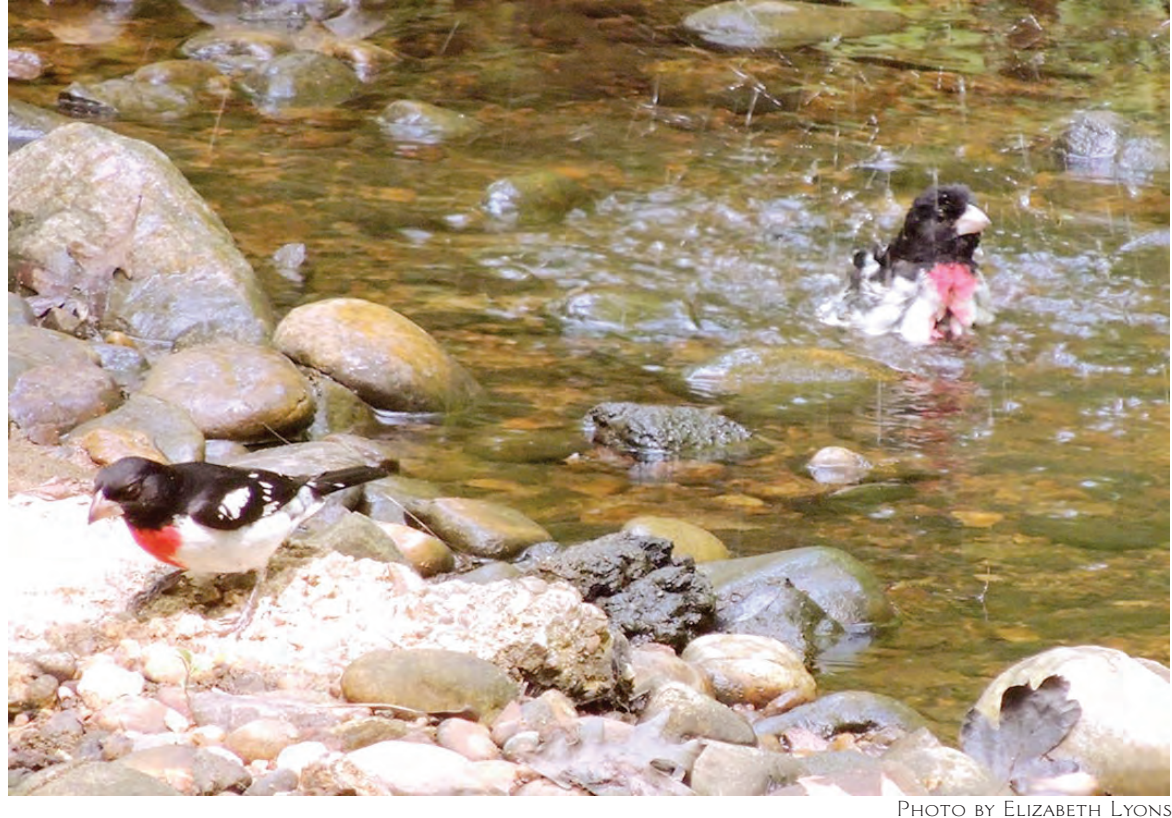
Rose-breasted grosbeaks bathing in stream at Monticello Park.