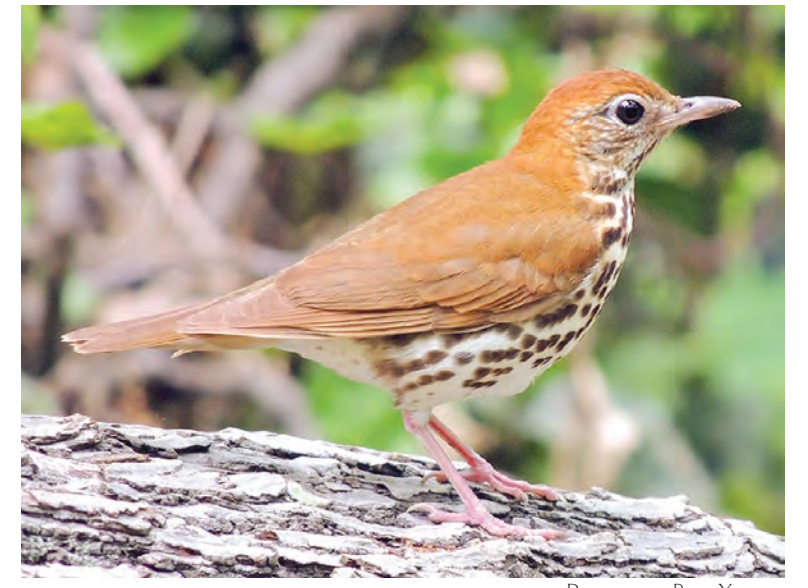
Wood thrust at Monticello Park, one of the first birds heard and then spotted at Birdathon.

8 & Alexandria Gazette Packet & May 25-31, 2023