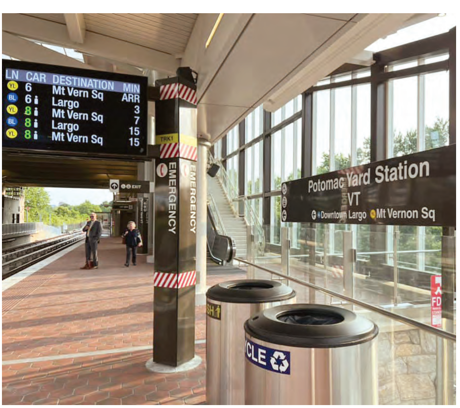
The Potomac Yard station between Braddock Road and Washington Reagan National Airport services the Blue and Yellow Metro lines. Alexandria Gazette Packet 🔅 May 25-31, 2023 🗞 3

systems, Bike & Ride facilities, and walking paths to the station from the surrounding area.