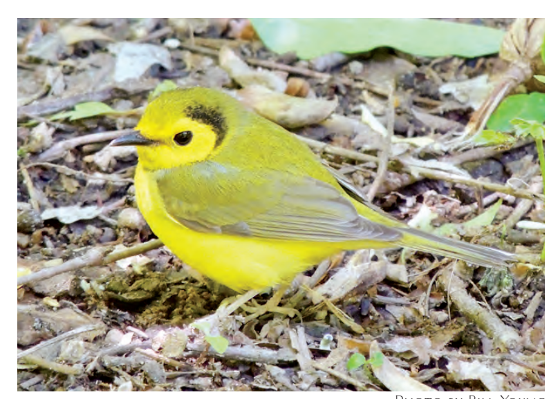
Hooded warbler, one of 35 possible warbler species at Monticello Park

stool and retreated to the knoll at the top of the park. "I heard a lot of woodpecker chatter and looked up to see an adult Hairy Woodpecker feeding a chick in a tree hole." She says she retreated because "obviously the parents were upset with me being there.