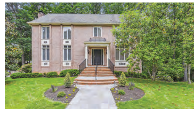
McLean | $1,675,000

Show stopping home in beautiful & sought-after Chain Bridge Forest. This home boasts 5 bedrooms, 4.5 baths, with 4,000+ SF across 3 levels. Experience a harmonious blend of comfort, convenience, and natural beauty - the perfect place to call home. 4046 41st St N Jillian Keck Hogan Group 703.951.7655 www.JillianKeckHogan.com