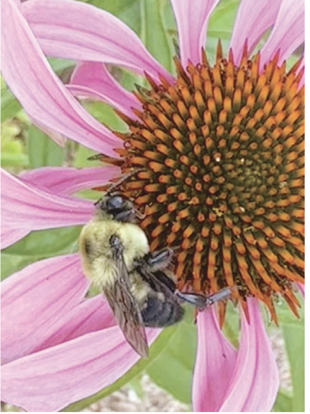
Purple Coneflowers (Echinacea purpurea), a popular Eastern wildflower, attracts a variety of insects, including bees and butterflies