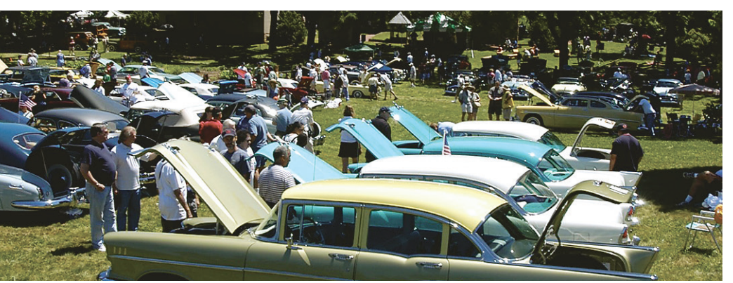
The Sully Car Show will take place on Sunday, June 18, 2023 at Sully Historic Site in Chantilly.

p.m., Fridays at 8 p.m., Saturdays at 2 and 8 p.m., Sundays at 2 p.m. Tickets: $50 general admission, $47 seniors (65+), $15 students, educators, and military. The first 20 tickets sold for every performance will cost only $20. Thursday evening tickets are $35.Purchase online at www.1ststage.org or 703-854-1856.