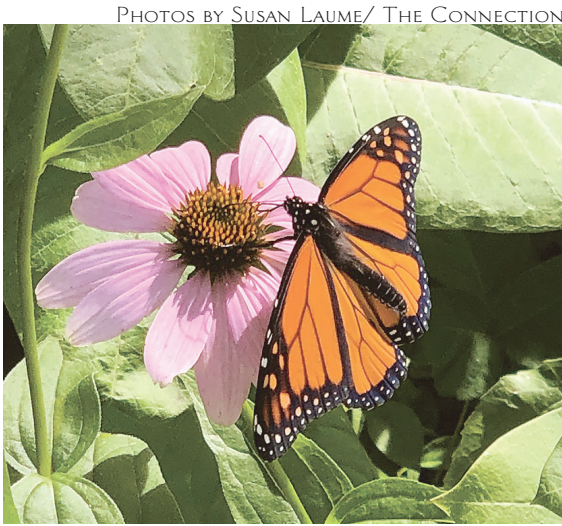
Newly emerged female Monarch butterfly (Danus plexippus) rests, stretching and drying her wings

Native Sundrops (Oenothera fruiticosa) attract bumble bees, other insects, hummingbirds, and birds such as American Goldfinch (Spinus tristis) during their May to September bloom times