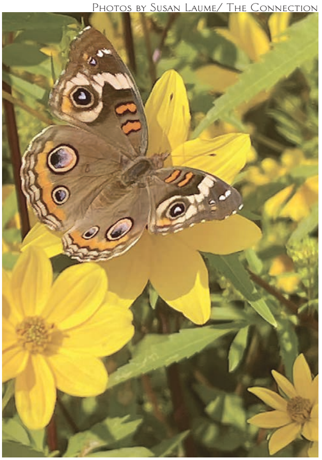
Common Buckeye (Junonia coenia) butterflies visit Coreopsis and other wildflowers between