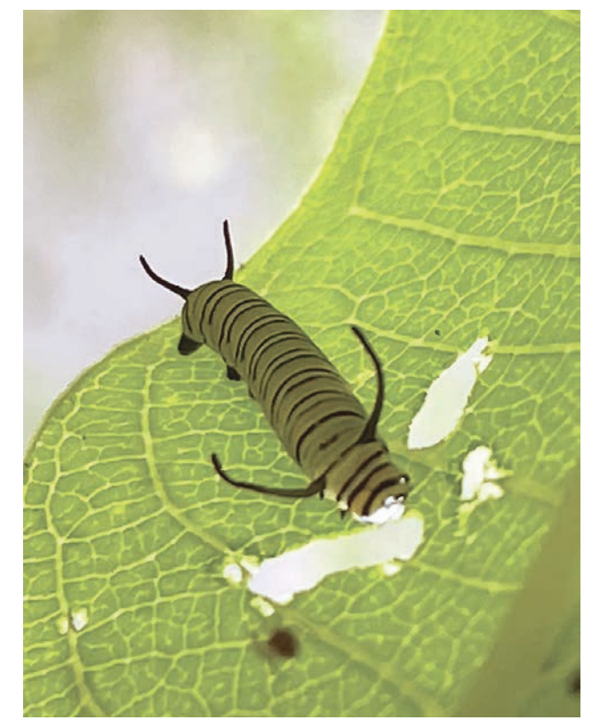
Monarch butterflies are well know to prefer laying their eggs on the underside of Milkweed leaves to provide their hungry caterpillars nutrition for their growth through several stages into the orange and black beauties of their adult stage