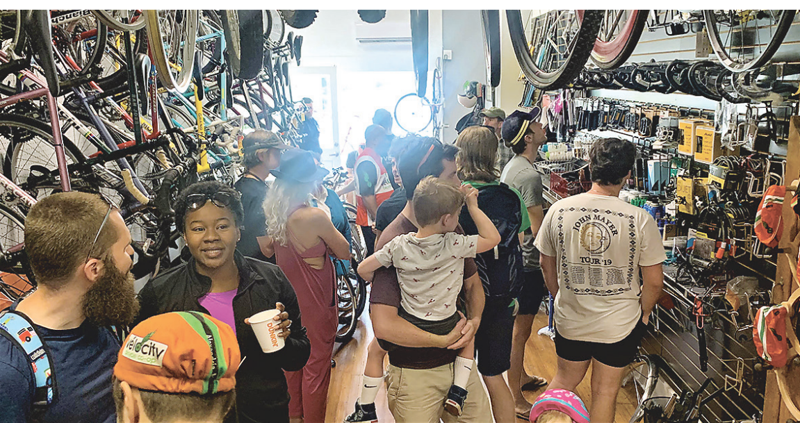
Neighbors and bike enthusiasts drank coffee and heard about the coop on Saturday.