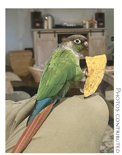
green-cheeked conure, was missing for 49 days and found 57 miles from home.