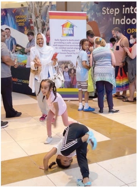
Pride Night Out at Springfield Town Center drew family groups as well members of the LGBTQ+ community