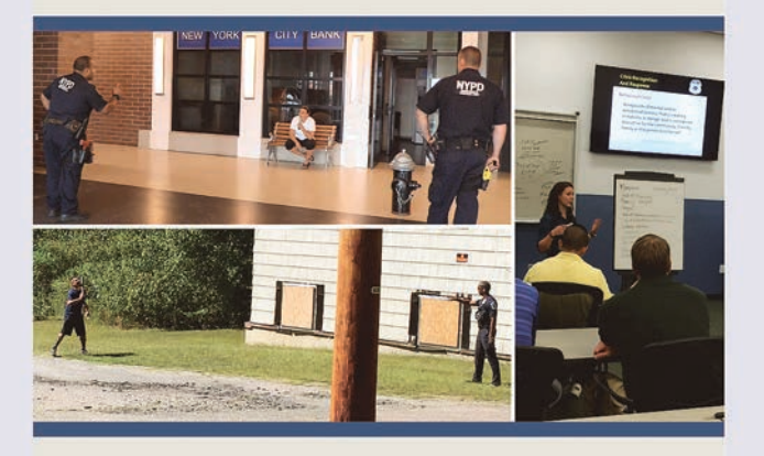
TRAINING GUIDE For Defusing Critical Incidents

ICAT Integrating Communications, Assessment, and Tactics