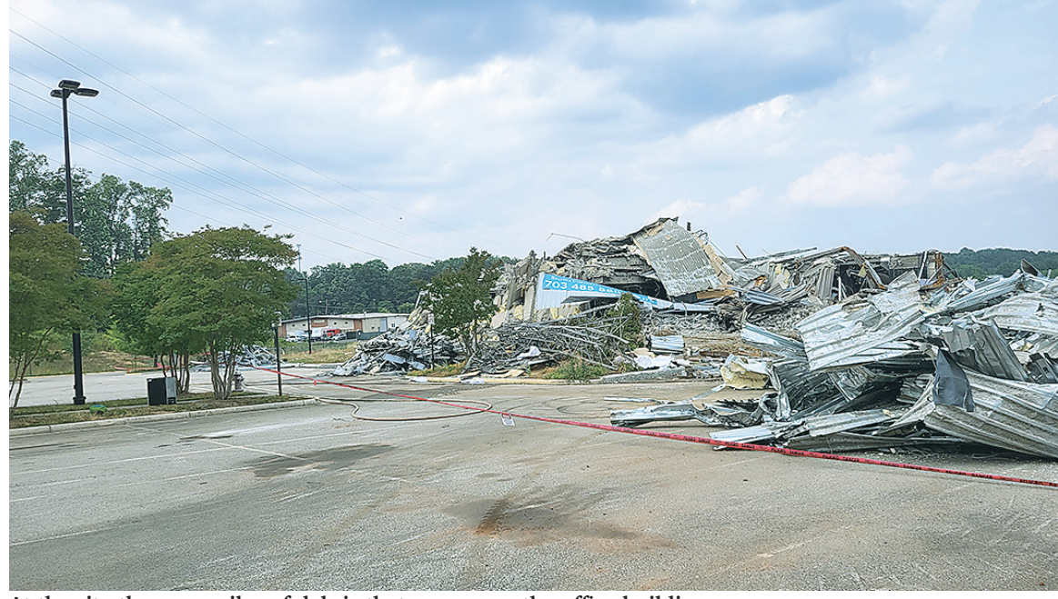
At the site there are piles of debris that were once the office buildings. www.ConnectionNewspapers.com