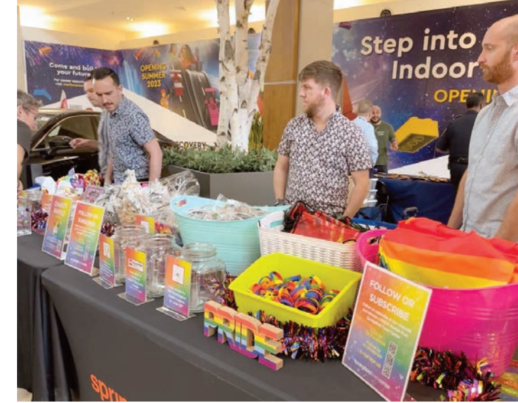
Bright colored give-away items attracted interest

increased risk for suicidal thoughts, suicide attempts and suicide. In addition, LGBTQ+ youth are more likely than heterosexual youth to report high levels of bullying and substance abuse.