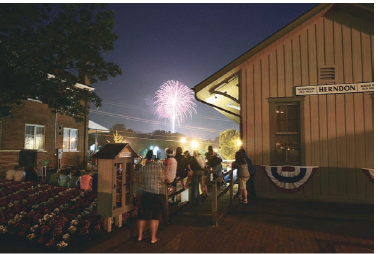
The Town of Herndon will celebrate the Fourth of July in Bready Park with fireworks.

The City of Alexandria celebrates its 4th birthday on Saturday, July 8, starting at 6 p.m., with a performance by the Alexandria Symphony Orchestra and a grand finale fireworks display at 9:30 p.m. Enjoy the big birthday experience including cupcakes, local vendors and live music. Oronoco Bay Park, 100 Madison St.