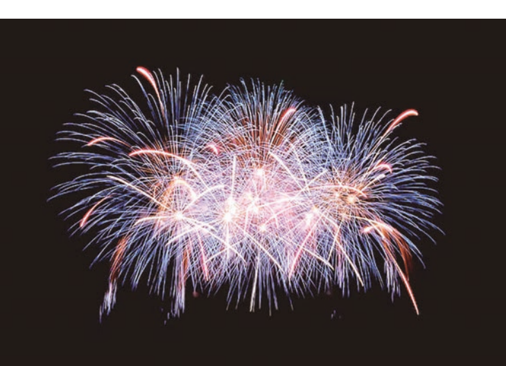
Independence Day Fireworks will begin on June 30 and July 1 around the region.

You'll find a wide range of family friendly activities. Visitors can enjoy the Water Mine Family Swimmin' Hole water park, skate park, pump track, several hiking and biking trails, and athletic fields. All picnic areas will be offered on a first-come-first serve basis. Food trucks will open for business from noon until 9 p.m. Live music will begin at 4 p.m., featuring Ted Garber, Frying Pan Farm Bluegrass Jam and Sonic Boom. Cap off an eventful holiday with a patriotic fireworks display beginning at approximately 9:15 p.m.