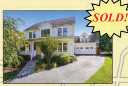
2204 Beacon Lane Falls Church, 22043 $1,795,000

Curious what your home is worth? Call to chat with JD and Ed today