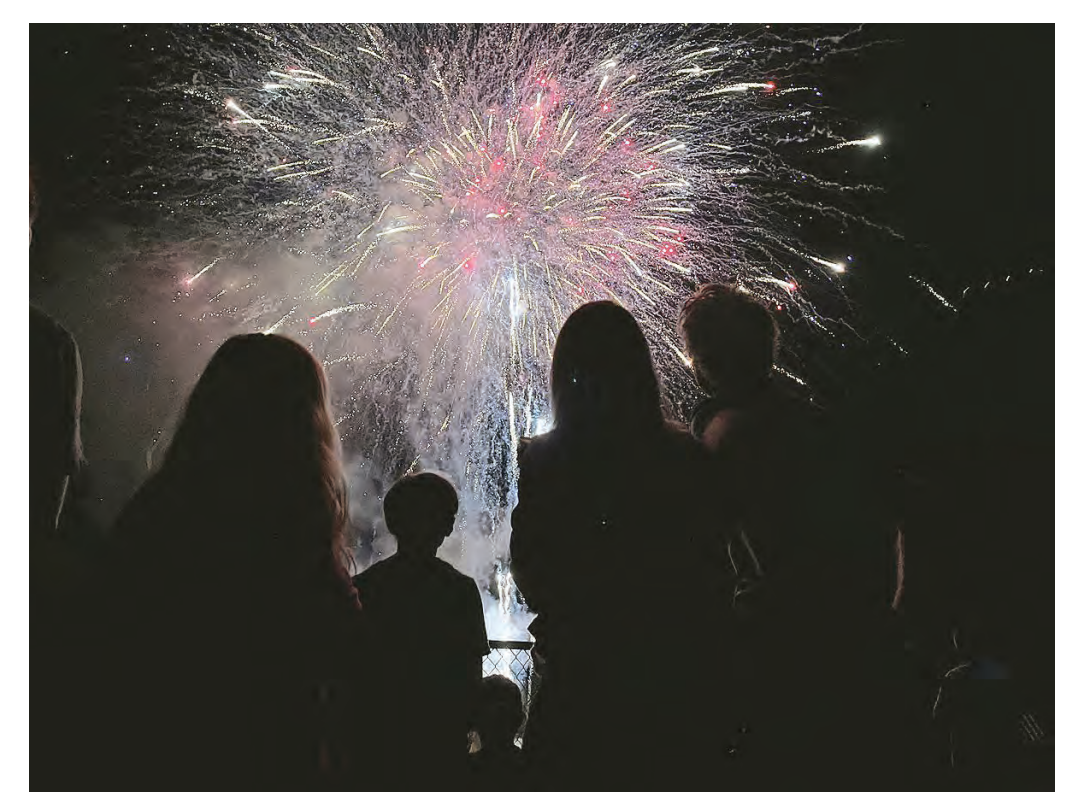
McLean Photo via McLean Community Centr@mcleanvacenter The McLean Community Center held its Community Independence Day Fireworks Celebration Saturday, July 1.

Local communities celebrate-Town of Herndon home goes up in flames.