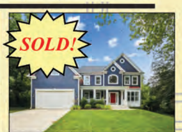
1639 Macon Street McLean, 22101 $2,215,000