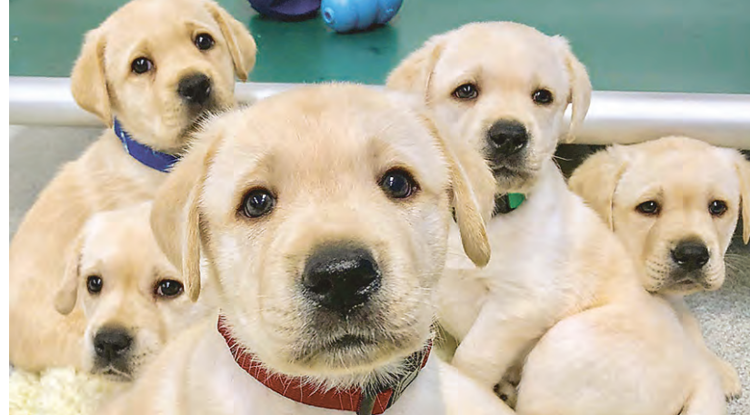
Pups in the Pavilion takes place in July and August at Reston Town Center on Wednesdays.