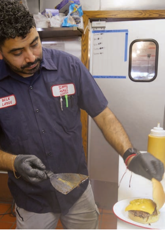
Grand finale Sloppy Mama's number 3 burger.