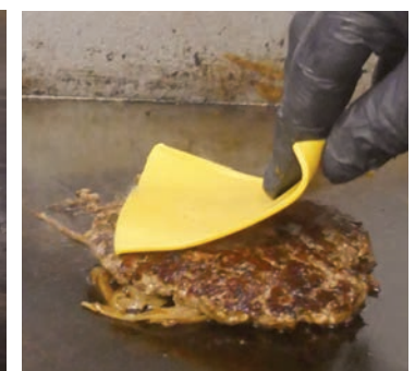
minute or two, a slice of Ameri- degree grill. can cheese melts on the burger.