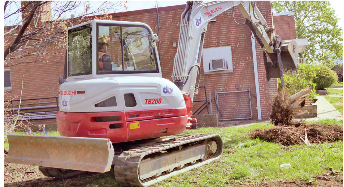
Demolition of fire station number 8 began in April 2022.