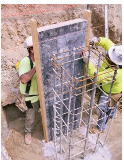
Construction began in June 2022 and in August the workers were digging the building's footings, setting reinforcing bar and pouring the footings.