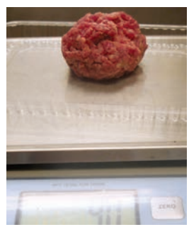
Hernandez makes each burger to order beginning with 4 ounces of twice ground brisket.