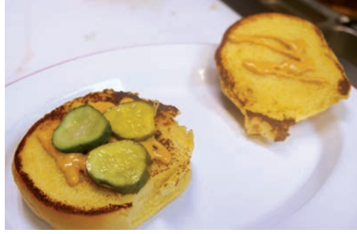
Onions top burger and cook for about After flipping over and another Burger smashed flat on 420 Burger topped with special sauce, hot sweet pickles and placed on a potato roll.