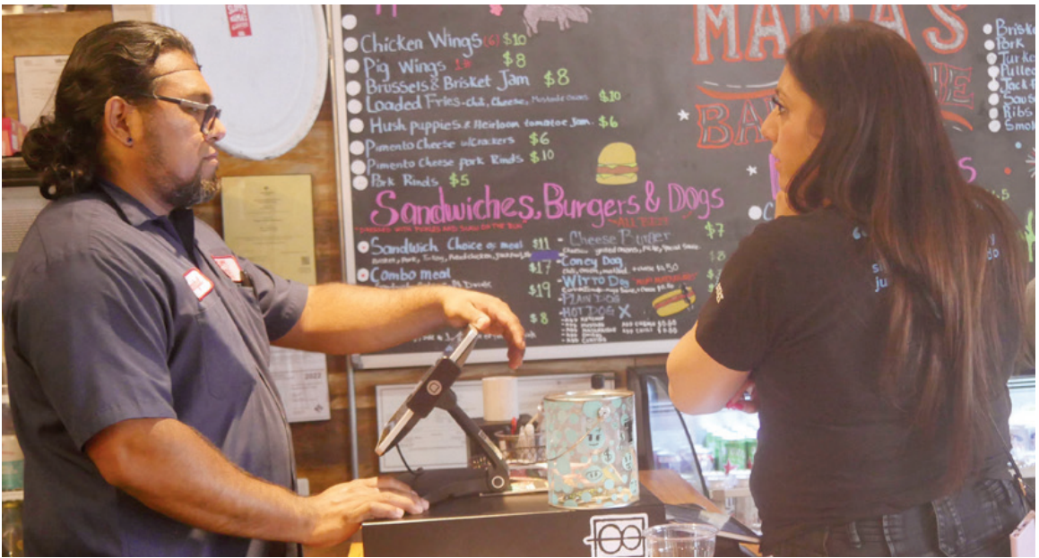
Customers lined up for burgers at Sloppy Mama's Saturday.

Currently Sloppy Mama's BBQ is in the middle of the voting for NoVA Burger Wars 2023, competing with 32 other restaurants. They just won phase two voting. Phase three voting ends Wednesday, July 26 at 11:59 p.m.