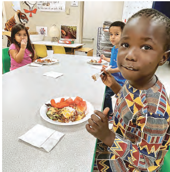
Cheeks full of yummy and nutritious meals and snacks are part of every school day for the children at Laurel Learning Center, operated by nonprofit Cornerstones in Reston.