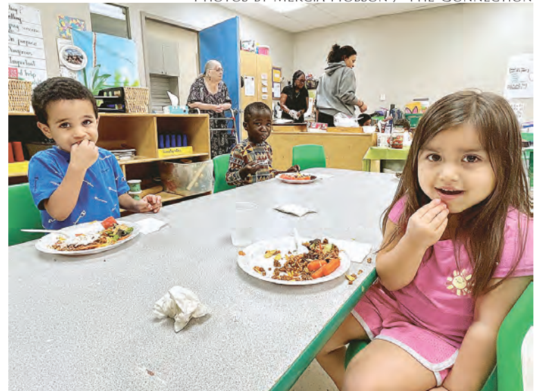
A little more is not an uncommon ask.