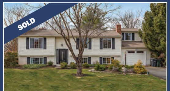
Great Falls $1,080,000