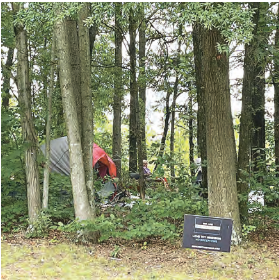
Some people experiencing homelessness in Reston camp out. The heat, the rain, and flooded tents add to the poor living conditions. Cornerstones' shelters are maxed out, and nearly all funding for contracted hotel rooms is exhausted.