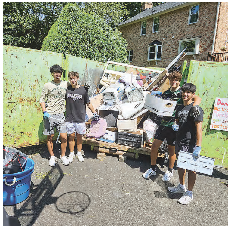
The Dump for Donations Fundraiser will be held now thru Aug. 19 at 8423 Weller Ave., McLean.

T-TRAK Model Train Show. 1-4 p.m. At Fairfax Station Railroad Museum, 11200 Fairfax Station Road, Fairfax Station. The Northern Virginia T-TRAK members will hold a N gauge Model Train Display at the Fairfax Station Railroad Museum. Admission: museum members,