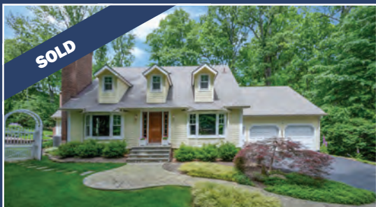
Great Falls $1,400,000