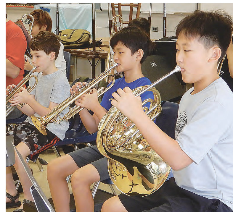
Students playing their instruments during a brass sectional.