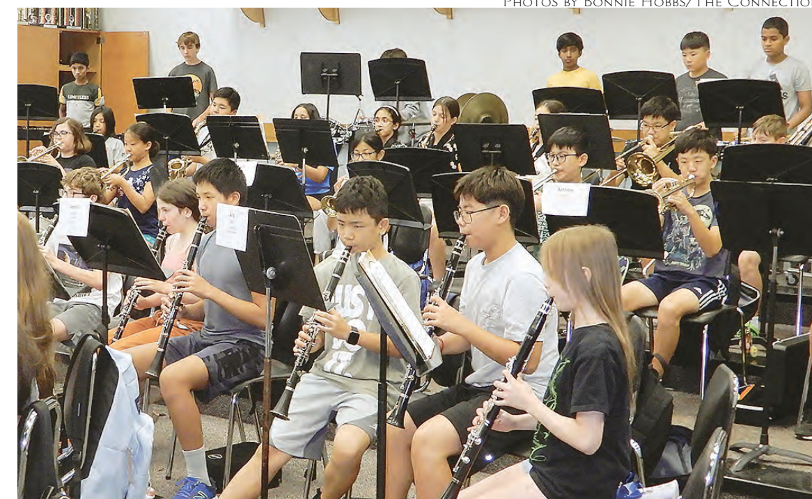
Young musicians practicing in the camp's Concert Band.