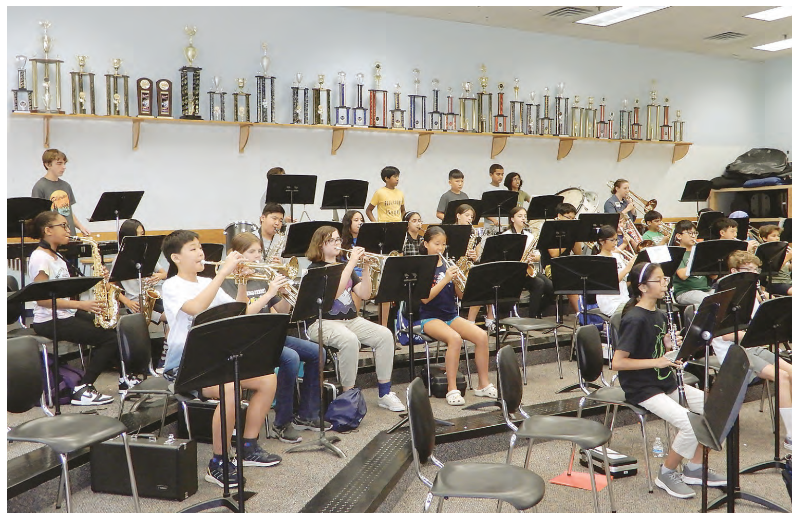
Beneath Franklin Middle School's many music trophies, the Concert Band plays.