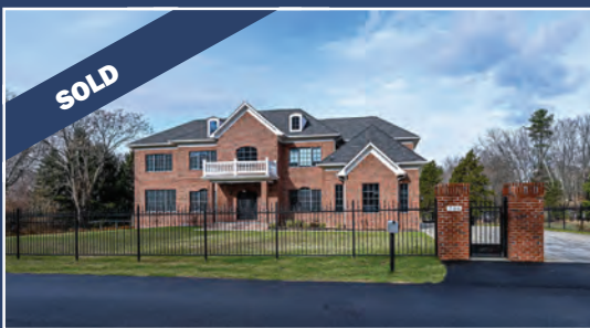
Great Falls $2,050,000