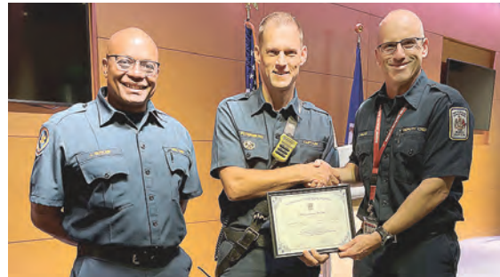
FAIRFAX COUNTY FIRE AND RESCUE DEPT.