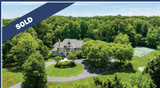
Great Falls $3,550,000