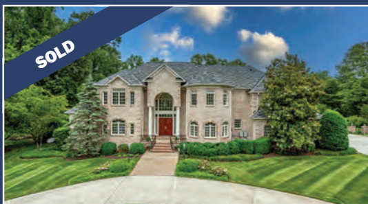
Great Falls $2,915,000