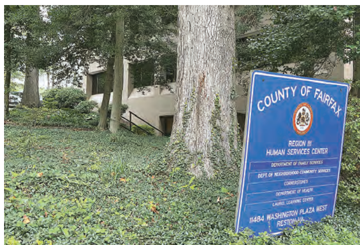
Region 3: Northern Fairfax County serves the communities of Great Falls, McLean, Oakton, Reston, the Town of Herndon, the Town of Vienna, and Tysons High School Pyramids (whole or partial): Herndon, Langley, Madison, Marshall, McLean, Oakton, and South Lakes.