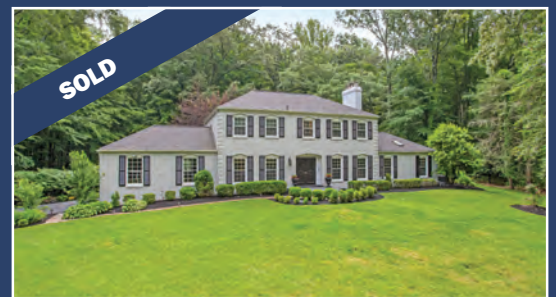
Great Falls $1,650,000