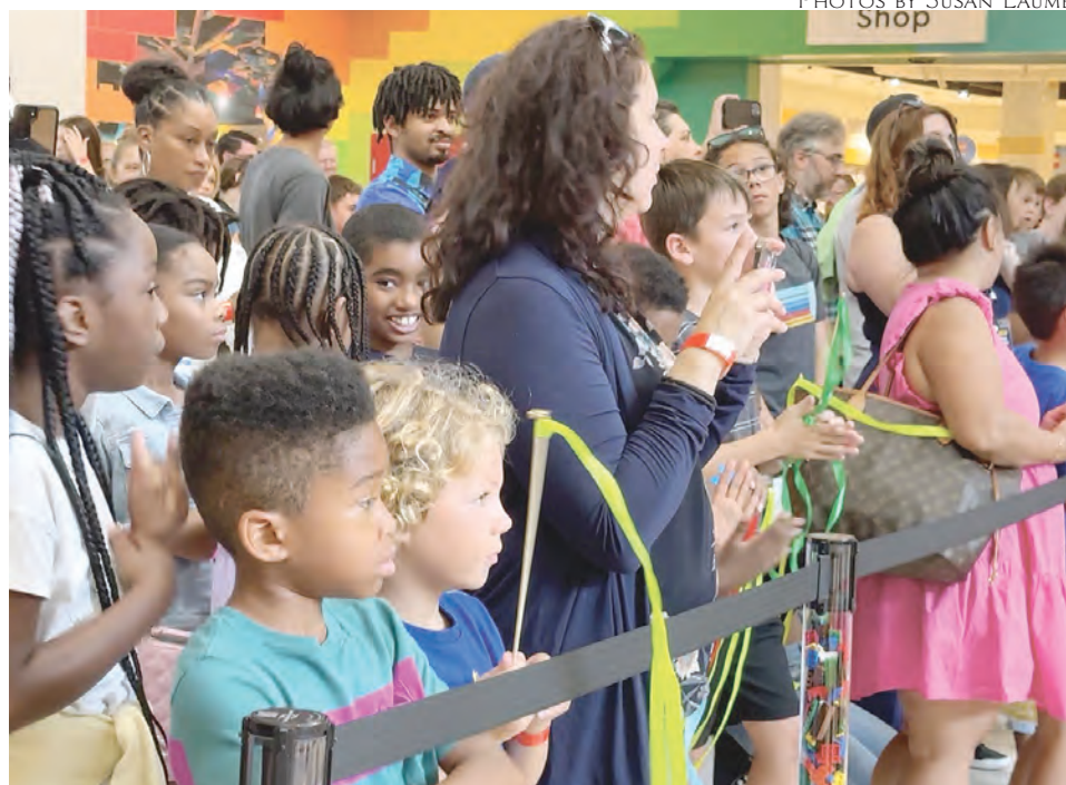
An eager crowd of invitees of all ages awaits a first view of the Center