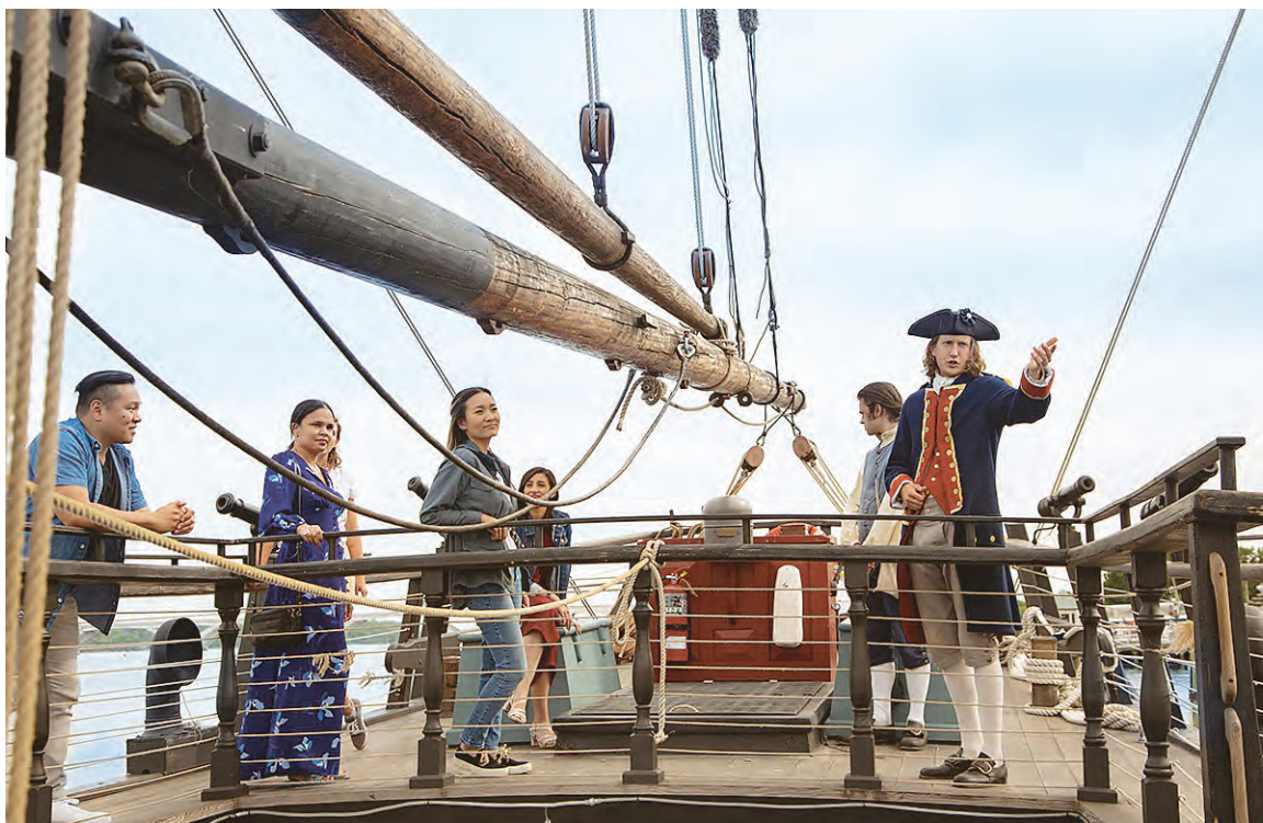
Take a tour aboard the Tall Ship Providence and Sen. John Warner Maritime Heritage Center in Alexandria's Waterfront Park.