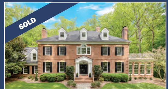
Great Falls $2,025,000