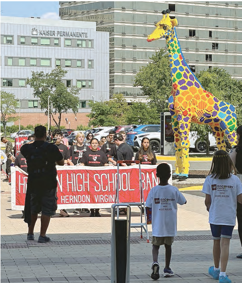
Herndon High School drum band and dancers led a parade of participants to opening ceremonies