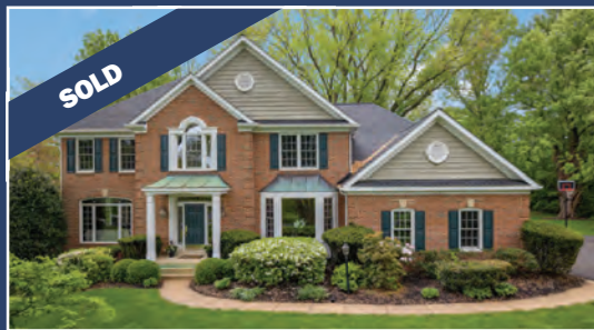
Great Falls $1,860,800