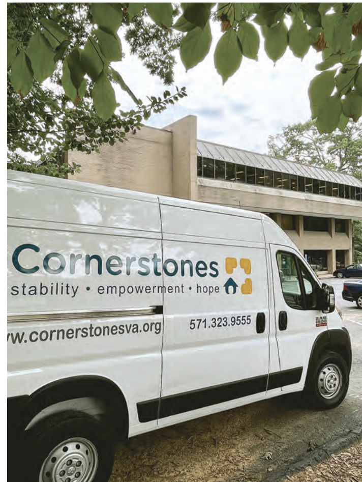
Cornerstones operates the Laurel Learning Center, which offers comprehensive family services as well as developmental childcare programs for infants through sixth grade.