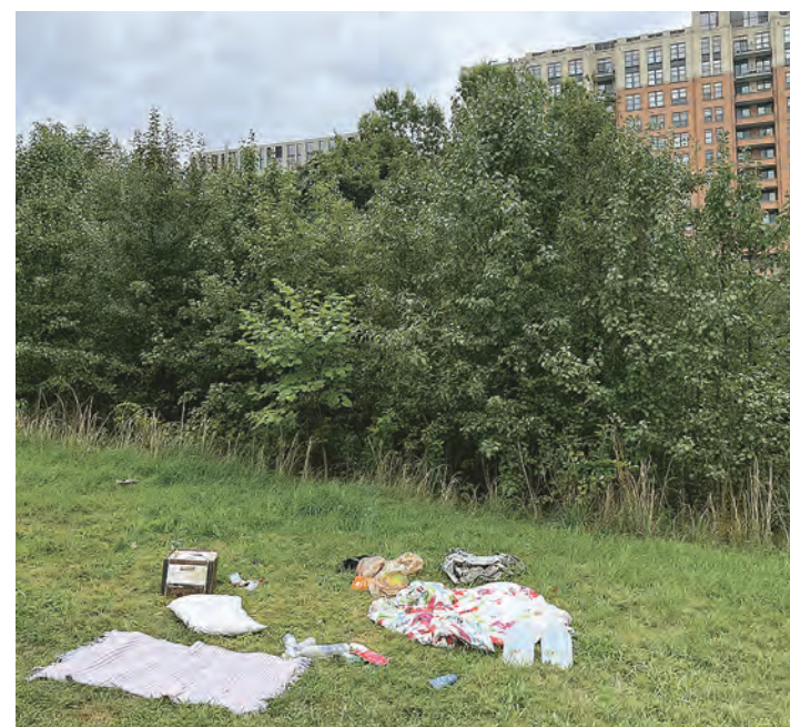
A quilt, a small rug, water bottles, food, and black plastic bags are set up at what appears to be someone's outdoor living space located a half block from the Embry Rucker Community Shelter, which is at full capacity. Reston's luxurious condos rise beyond the brush line.

Support Cornerstones in their mission to "provide services and opportunities to help