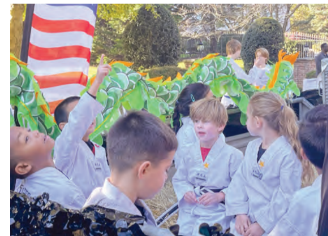
Colorful floats are part of the fun, and this year there will be a float contest.