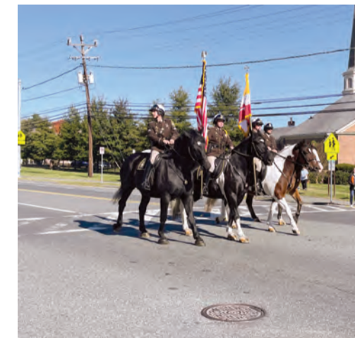
Horses lead the way.