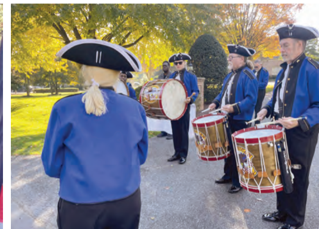
American Originals Fife and Drum.