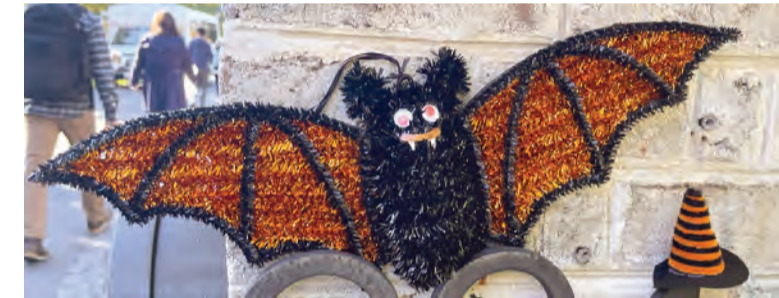
It's the spooky season.