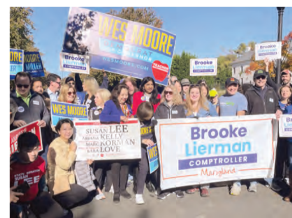
In 2022, many candidates were part of the Potomac Day Parade.