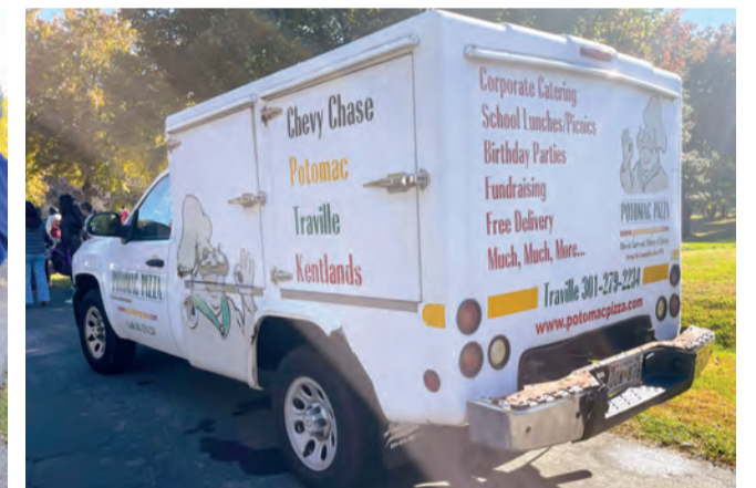
Potomac Pizza, major sponsor.