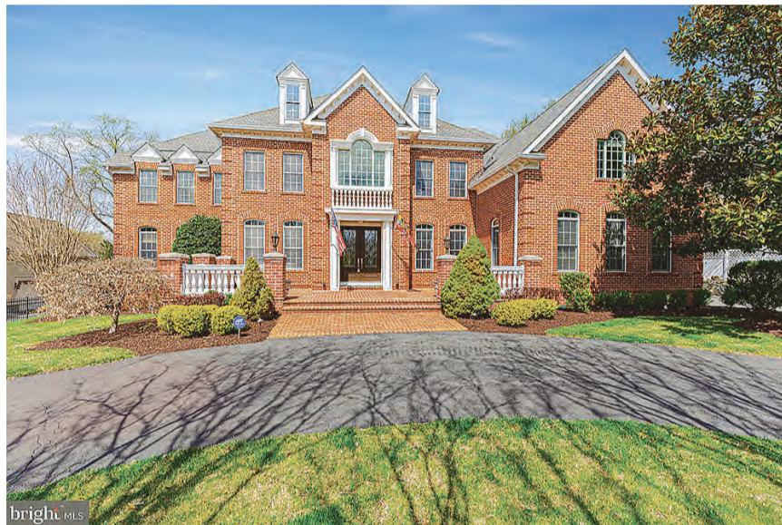
2 10100 Gary Road — $2,725,000