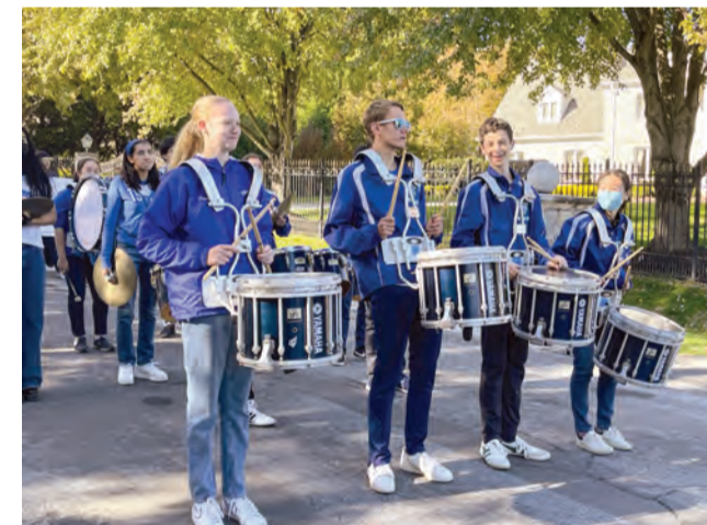
Churchill High School Marching Band.