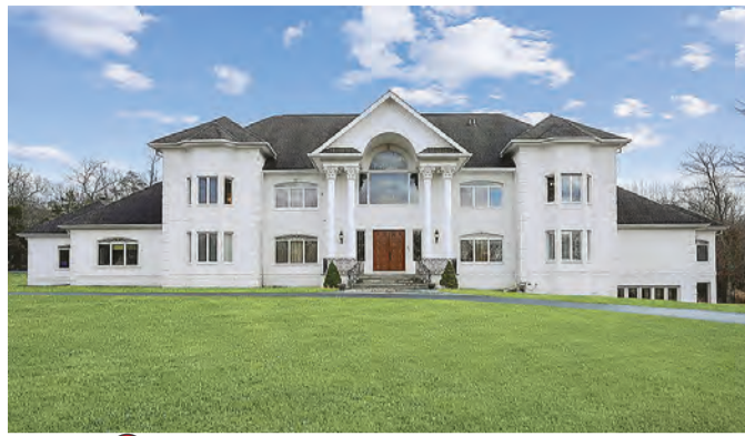
3 11704 Centurion Way — $2,650,000