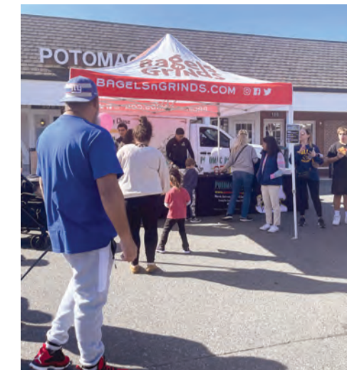
Bagels and Grinds, part of Adam Greenburg's restaurant empire that includes Potomac Pizza and now, Hunters Inn, as well as Potomac Pizza of course.