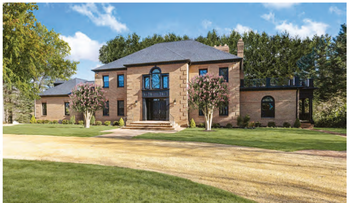
1 10525 Alloway Drive — $3,595,600