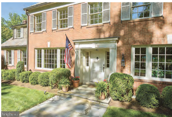
6 1 Stanmore Court — $2,250,000