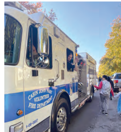
Fire trucks on display, old and new. Cabin John Park Volunteer Fire Department is a big part of the day.

The parade will kick off at 10:30 a.m., ending around 11:45 a.m. behind the shopping centers. Then the Children's Festival and Business Fair will be in full swing.