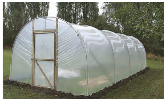
Similar to a greenhouse, a high tunnel is a less permanent structure, built with a metal frame and plastic cover instead of glass and metal. High tunnels extend the growing season

Department of Permitting Services, based on recommendations from the Office of Agriculture (OAG) and