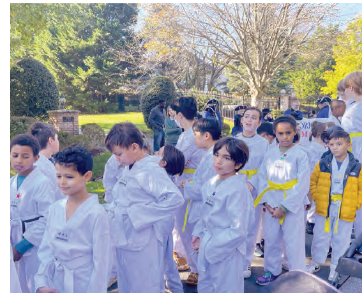
East-West Tae Kwon Do students line up waiting for the Parade to begin.