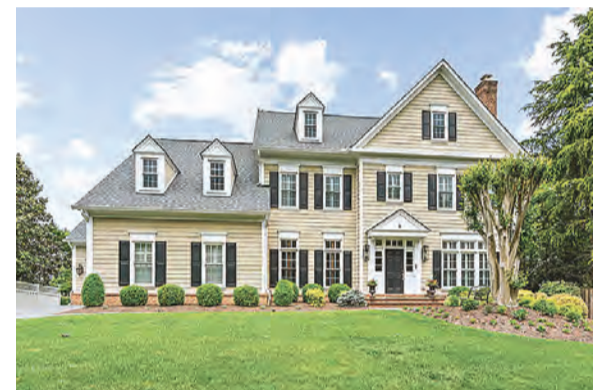
4 6 Purcell Court — $2,640,000