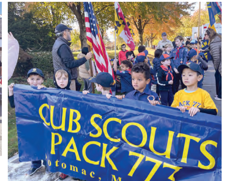
Cub Scouts. Look at those faces. Are they cute enough?