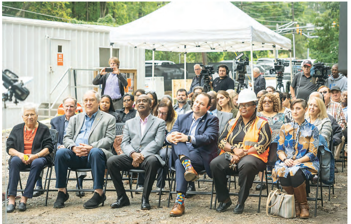
County officials, church members and community leaders attend a raising ceremony, a critical step to restore the historic Scotland A.M.E. Zion Church