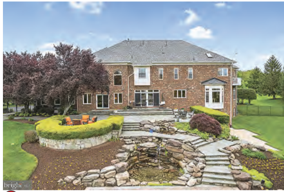
5 12616 Tribunal Lane — $2,625,000

IN JUNE, 2023, 69 POTOMAC HOMES SOLD BETWEEN $3,595,000-$560,000.