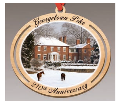
The 2023 Great Falls Ornament, #2 in a series.

The Great Falls Citizens Association and The Arts of Great Falls are selling the ornaments at Hidden Springs Farm, 438 River Bend Road, on weekends through Dec. 3, and at the Great Falls Atelier, 765