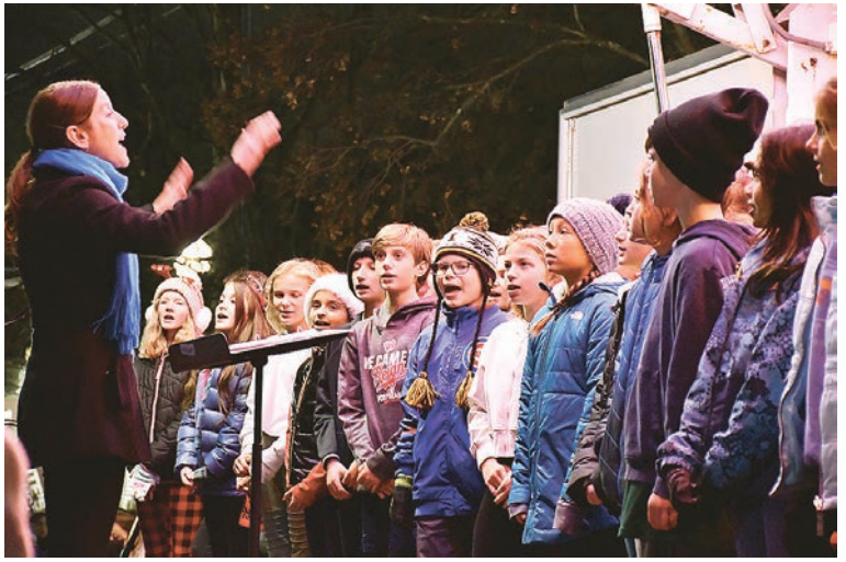
The Church Street Stroll takes place on Monday, Nov. 27, 2023 in the Town of Vienna.