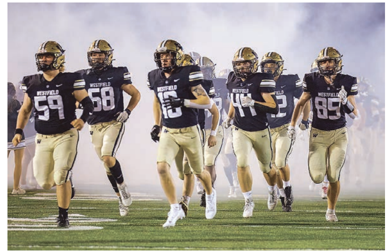
The host Westfield Bulldogs enter the field to host the visiting Yorktown Patriots in the Region D semi finals.