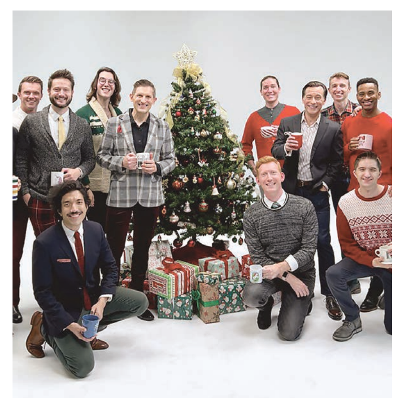
A Chanticleer Christmas takes place on Saturday, Nov. 25, 2023 at GMU Center for the Arts in Fairfax.

melded for unparalleled beauty and clarity, Chanticleer has impeccable style and has amassed a huge following.