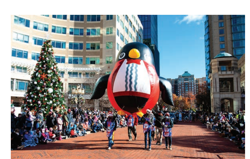
The Reston Holiday Parade will be held on Friday, Nov. 24, 2023 at Reston Town Center.

Dec. 4 -- Music Together Sing and Groove