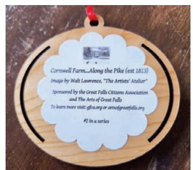
Reverse side of the 2023