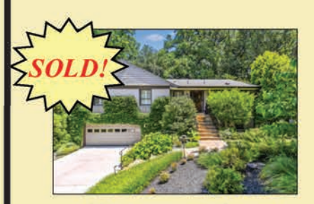
1405 Layman Street McLean, 22101 $1,420,000

2049 Rockingham Street McLean, 22101 $4,695,000 NEW CONSTRUCTION!