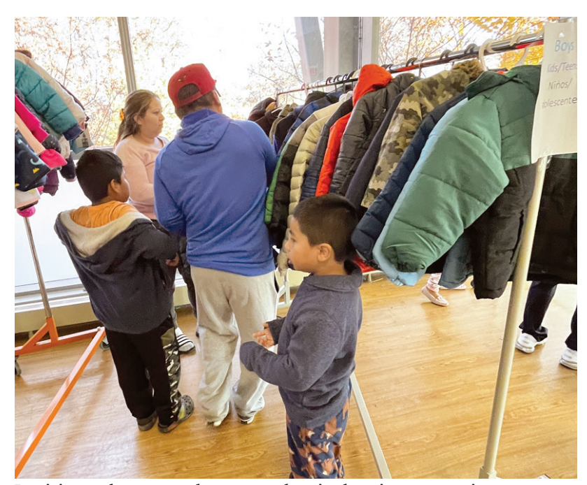
Participants have enough space to shop in the winter wear giveaway room because staff welcomes them in timed groups to avoid overcrowding.