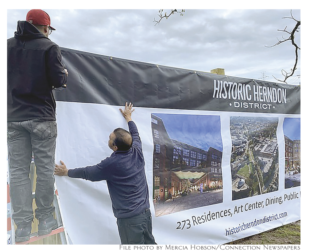
Comstock building site; sign installed in 2020