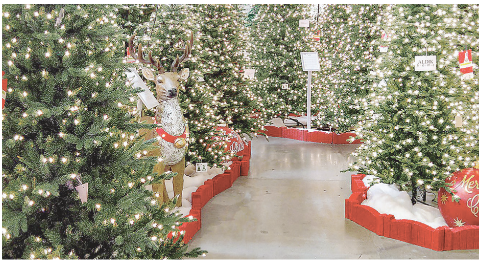
Winterfest will take place Nov. 30 to Dec. 2, 2023 at Brown's Chapel Park in Reston.