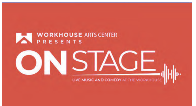
The Christmas Carol is just one of the productions on stage at the Lorton Workhouse Art Center.

of fifteen plays produced across the country and overseas.