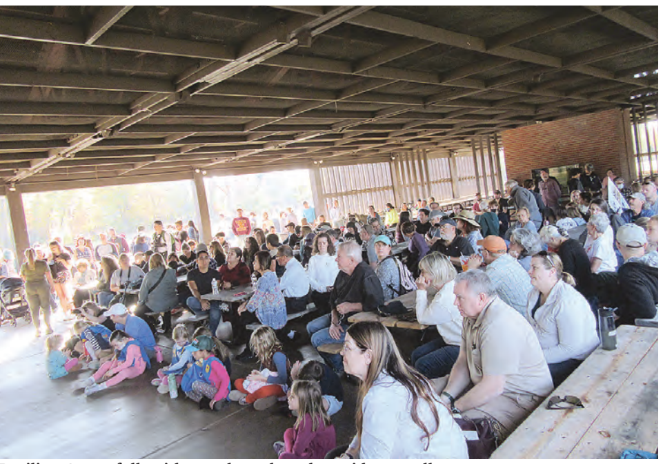
Pavilion A was full, with people gathered outside as well.

The audience members, from one-yearolds to octogenarians, were totally enraptured by raptors.