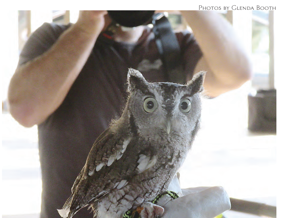
An Eastern screech owl named Little Voss.