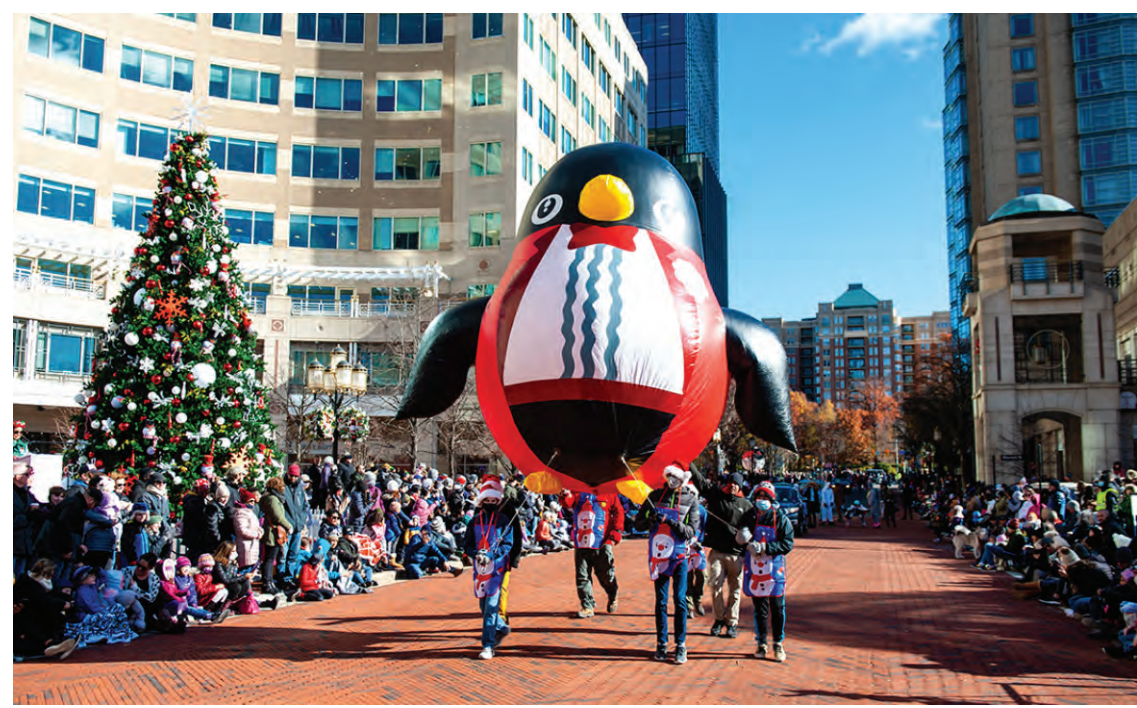
The Reston Holiday Parade will be held on Friday, Nov. 24, 2023 at Reston Town Center.