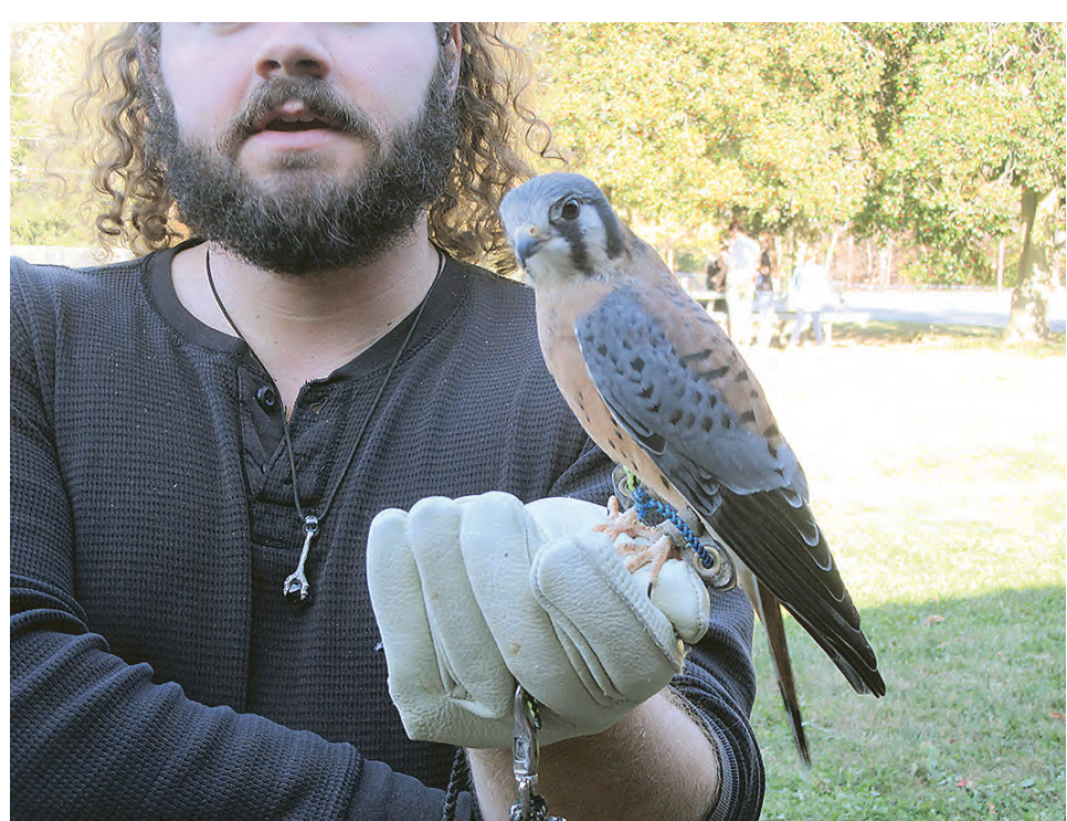
A male American kestrel named Pippin.