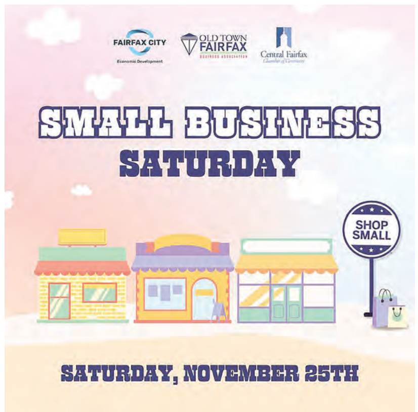
Support local merchants on Small Business Saturday.