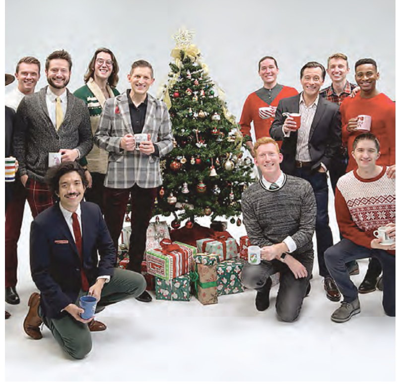
A Chanticleer Christmas takes place on Saturday, Nov. 25, 2023 at GMU Center for the Arts in Fairfax.

Black Friday at Tysons Corner Center. Many mall retailers have