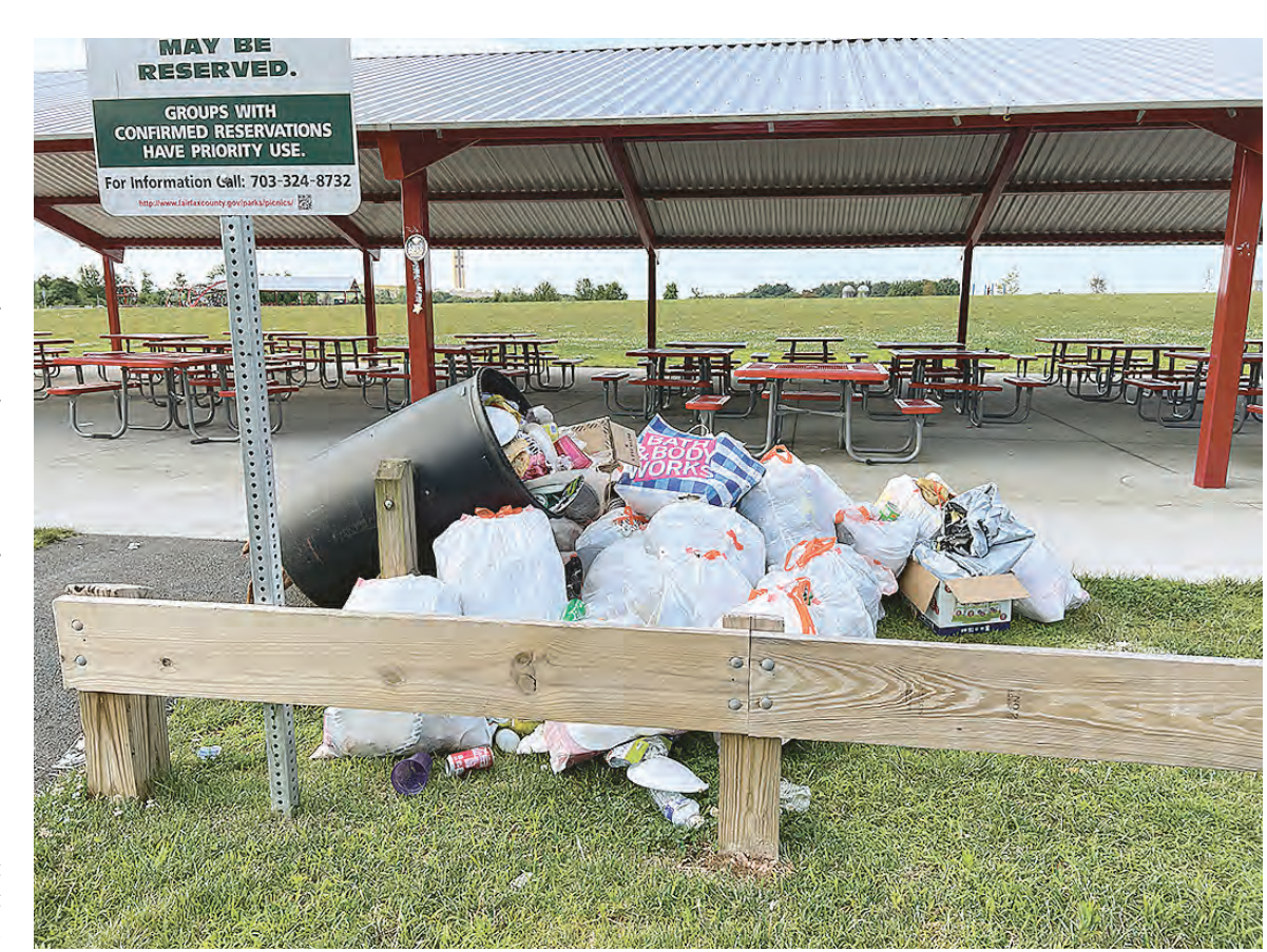
Litter plagues our parks like this piled outside trash cans at Laurel Hill Park in Lorton, attracting vultures, small mammals, and insects; creating a health hazard, burdening tax payers, and detracting from the enjoyment of the park.

Clean Fairfax shares, "Virginia annually; and nationally, the cost is 2.5 billion tax dollars a year for lit- of litter on each mile of primary ultimately, the Chesapeake Bay." ter cleanup. Debris in the roadway highway. Too much of that trash