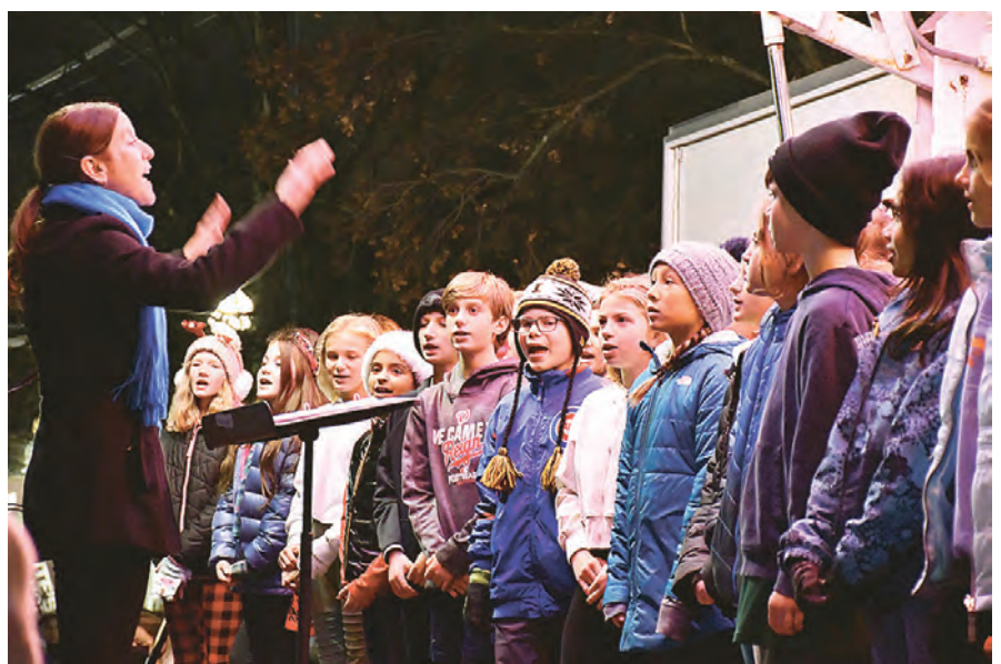
The Church Street Stroll takes place on Monday, Nov. 27, 2023 in the Town of Vienna.

Lake Accotink Park." Registration is $25 for each participant through Eventbrite.