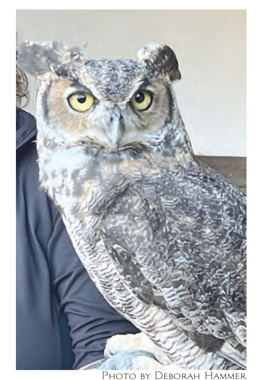
Homer, the great horned owl