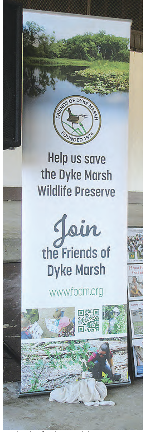
A Friends of Dyke Marsh banner. www.ConnectionNewspapers.com

16 & Burke / Fairfax / Fairfax Station/Clifton/Lorton / Springfield & November 23-29, 2023