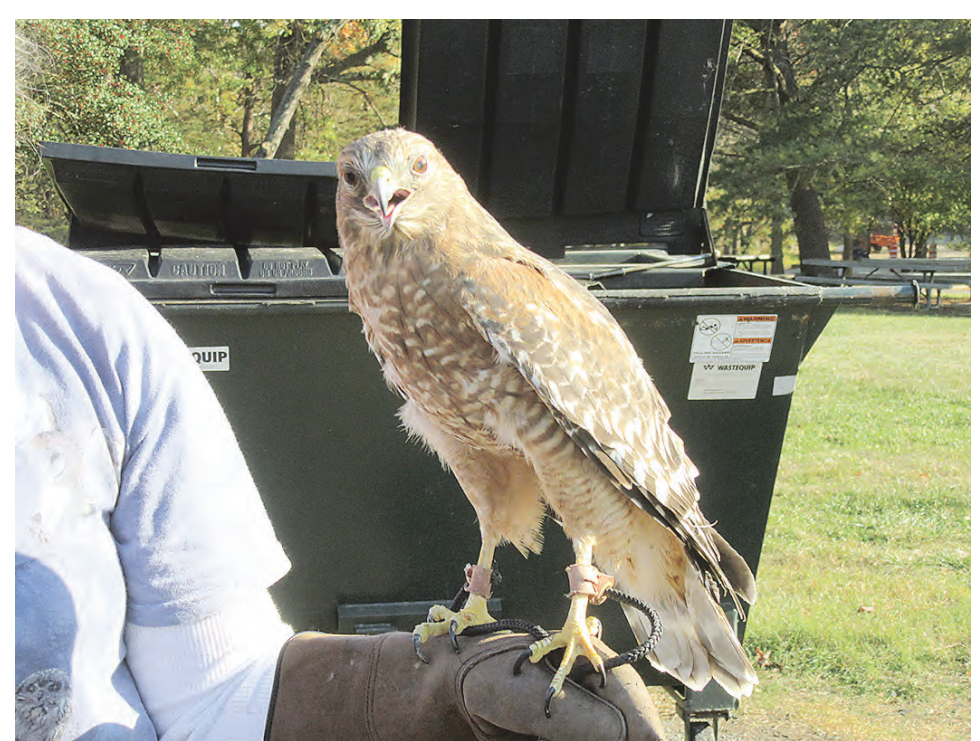
A red shouldered hawk named Little Red