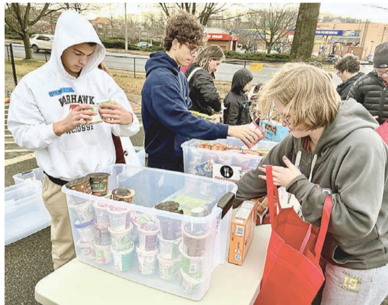
At Luther Jackson Middle School, volunteers brave the cold to sort food and toiletries for students attending five nearby schools, including Cedar Lane School, one of three new Food For Neighbors partners.