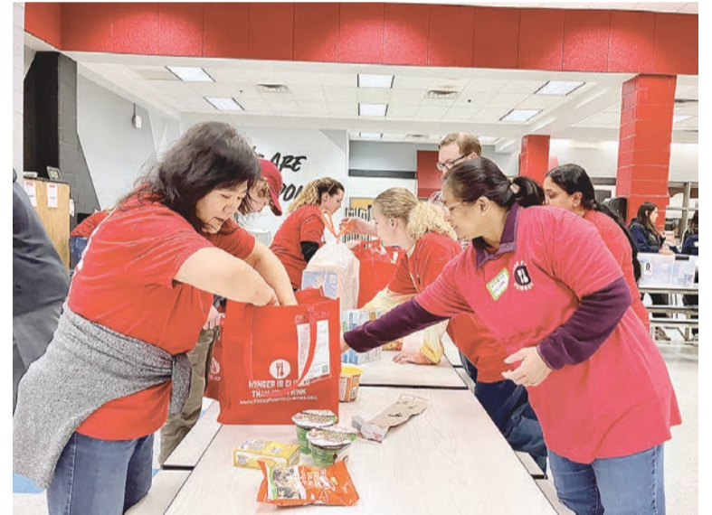
Neighbors' popular Red Bag Program. In just one morning, community members throughout the Food For Neighbors operating area collected and sorted over 25,000 pounds of donations generously provided by 1,956 households.

Also rallying to address teen food insecurity are Food For Neighbors' 45 partnering schools. There, school staff identify students in need of help and connect them with supplemental food, toi-