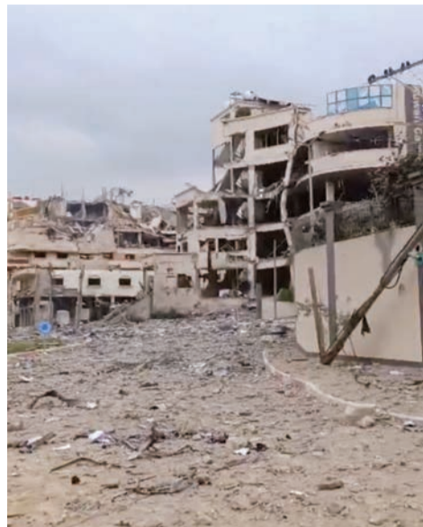
SCREENSHOT FROM VIDEO RESIDENT OF GAZA

The author of this "Letter from Gaza" walked around his bombed neighborhood and took video on Nov. 10, 2023.