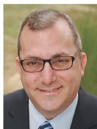
Sen. Adam Ebbin

In my opinion, gray machines don't serve the consumer interests of Virginia's gambling public. Unfortunately, as of this writing, the bill to legalize gray machines does not contain a system that the Commonwealth could verify or audit to ensure that the Department of