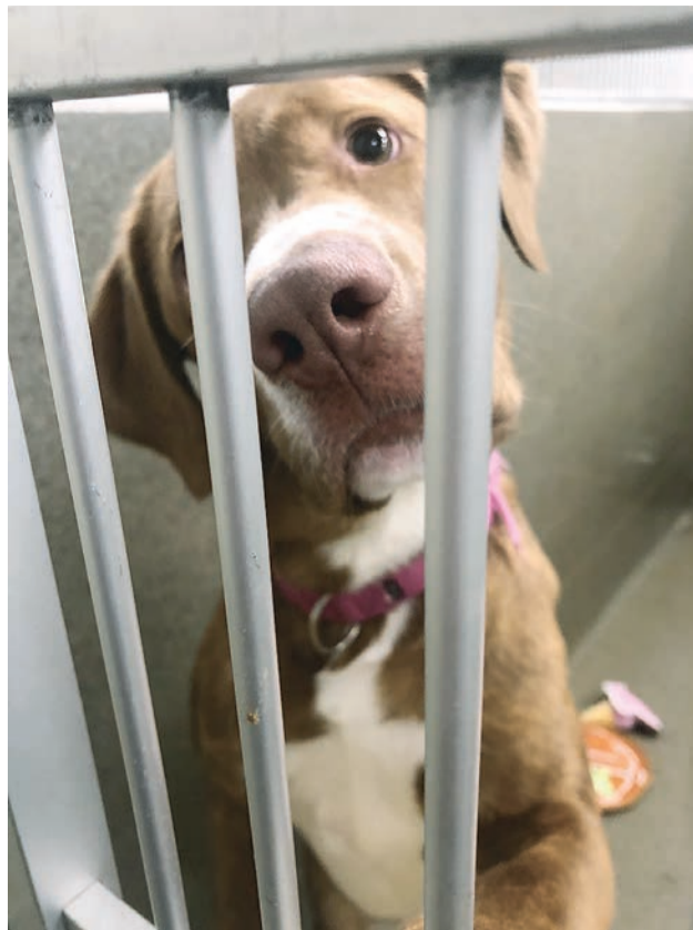
Chloe, who was recently adopted. For adopters, there is nothing like the gratitude of a dog or cat who needs a family.