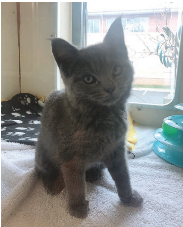
A beautiful gray kitten who came to see who was visiting.