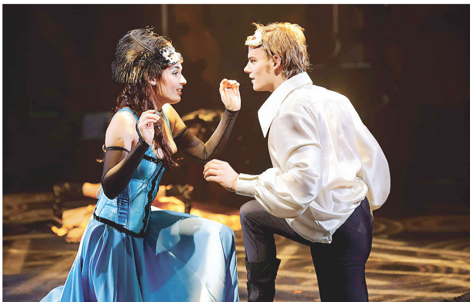
Synetic Theater in Arlington presents "Romeo & Juliet" on Feb. 16 to March 24, 2024.