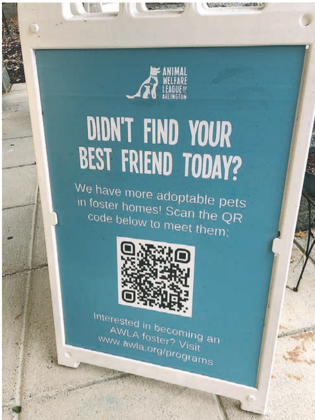
Animal Welfare League of Arlington's easy QR Code to see what dogs are currently being fostered.