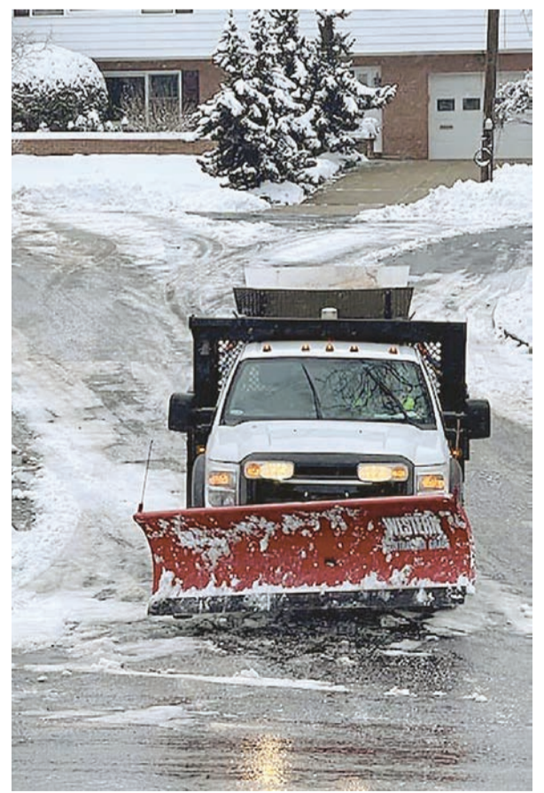
A small snow plow circles the cul de sac where the regular county plows haven’t made an initial swipe yet on Saturday morning.