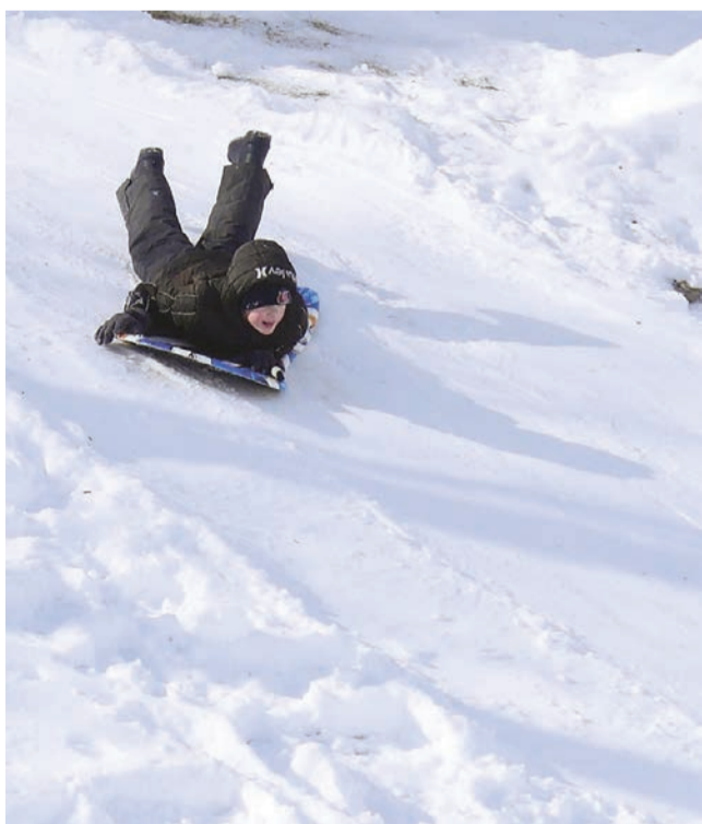
Neighborhood children take advantage of a small hill in front of their house to sled over and over down the hill to the sidewalk.