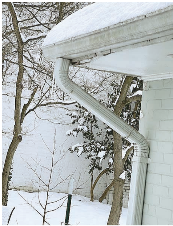
Icicles drip from the gutter in the backyard of this Arlington house.