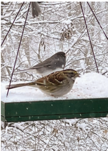
A white throated sparrow and a dark eyed junco. Both are birds that winter here and will migrate up north to breeding grounds in the spring.