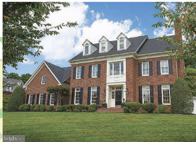
2 2 Purcell Court — $1,350,000