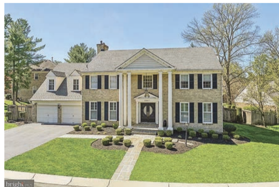
5 9427 Fox Hollow Drive — $1,700,000