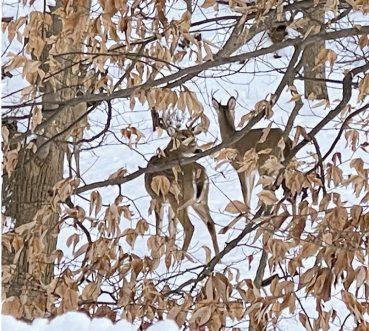
How many deer do you see? Three young bucks are camouflaged by the the beech tree which will hold onto its leaves until spring.