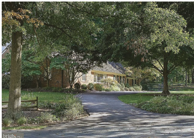
6 8710 Belmont Road — $1,805,000