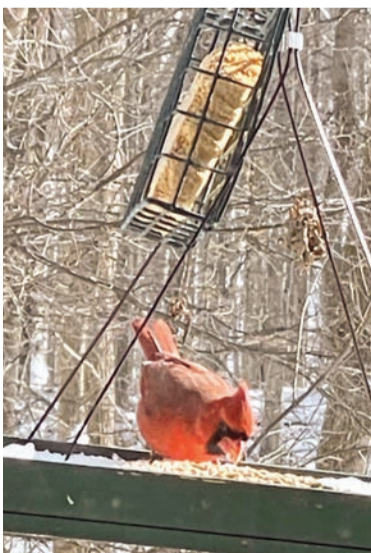
Male cardinal are a favorite in the snow.