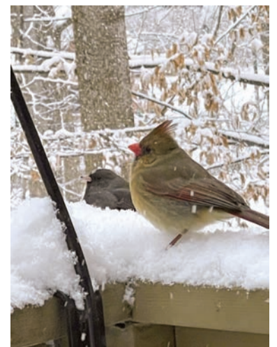
A female cardinal and a dark eyed junco wait for their turns at a feeder.