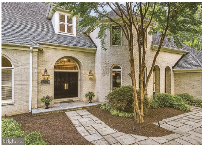
4 9906 Avenel Farm Drive — $1,850,000