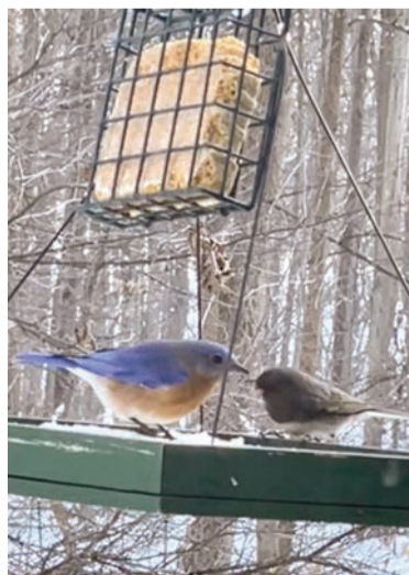
Eastern bluebird and a dark eyed junco.