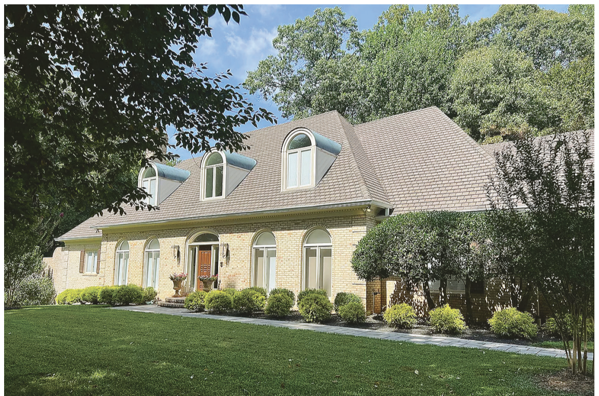
1 9464 Newbridge Drive — $2,125,000