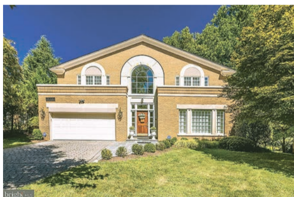
7 10001 Chartwell Manor Court — $1,700,000