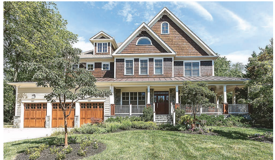
2 9215 Bells Mill Road — $2,000,000