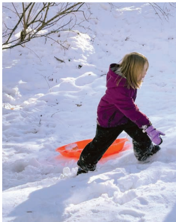
It's a rare opportunity, but what goes down must be pulled up before it can go down again.