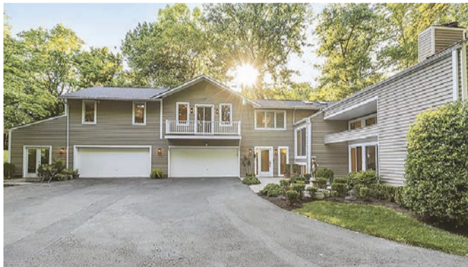
5 11201 Spur Wheel Lane — $1,810,000