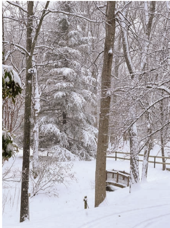
Two snow storms last week each gifted Montgomery County with about 4 inches of snow, and closed school for three days, Tuesday, Wednesday and Friday. It's been so long since there has been significant snow here that some people had started to believe it might never snow again.