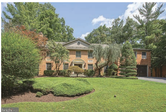
6 10109 Logan Drive — $1,675,000