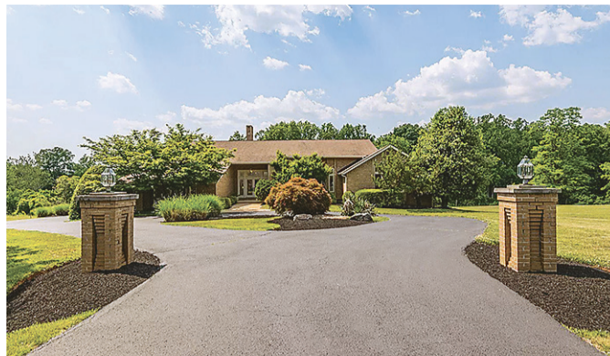
3 11013 Balantre Lane — $1,925,000