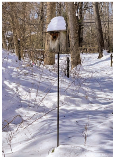
A bluebird pair will raise multiple broods in this bluebird house in the spring and summer. In winter, many bluebirds will pile into a box to keep warm.