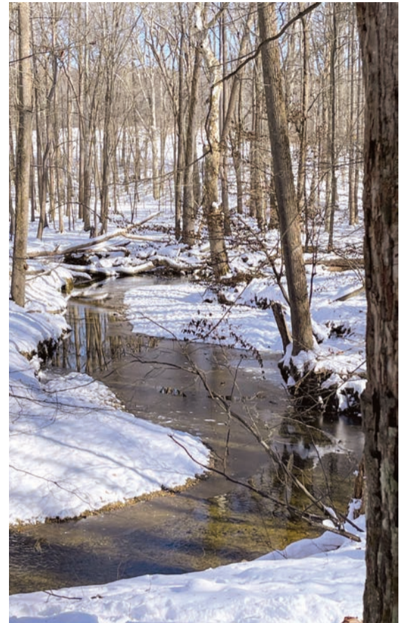
The stream meanders through the snowy woods.