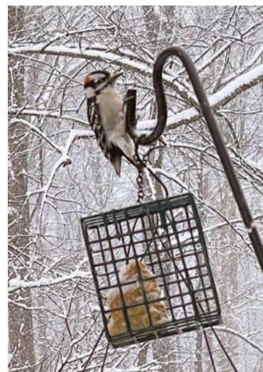
Tiny downy woodpecker at the suet.