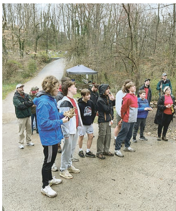
Others from Hayfield Boy Scout Troop 1519 helped out.