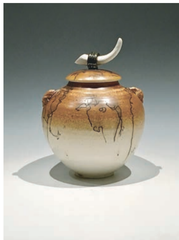
March Luck can be seen at Van Landingham Gallery at the Torpedo Factory in Alexandria during the month of March.

March Luck. At Van Landingham Gallery, Torpedo Factory Art Center, Alexandria. March Luck explores the serendipitous forces that drive artistic expression. Join us to reflect on the role of luck in shaping both art and life in the Van Landingham Gallery. The Torpedo Factory Artists' Association presents a group exhibition including