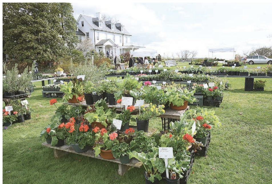
The 2024 Spring Garden Market at River Farm takes place April 12-13, 2024.

Ides of Bark Dog Festival. 1-4 p.m. At Grist Mill Park, 4710 Mt. Vernon Memorial Highway, Alexandria. The day features treats from