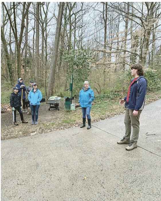
Discussing the project beforehand.