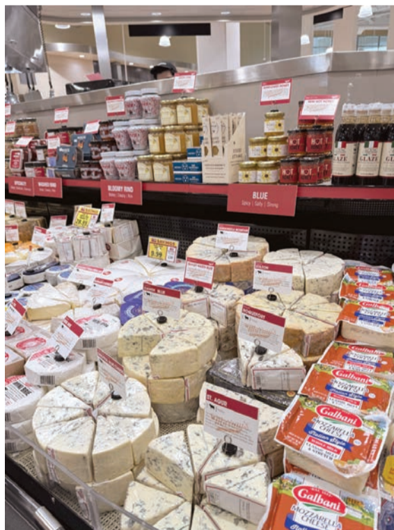
The New York-famous Murray's Cheese shop is central to the store.