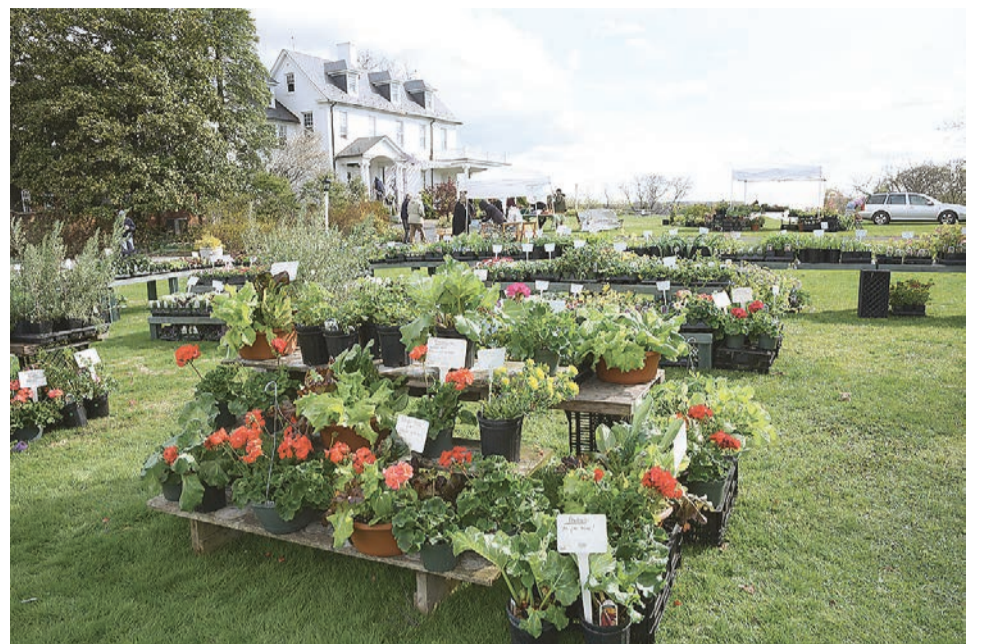
The 2024 Spring Garden Market at River Farm takes place April 12-13, 2024. https://ahsgardening.org/about-river-farm/events-programs/springgardenmarket2024/