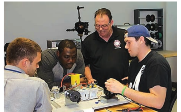
Equal Opportunity M/F