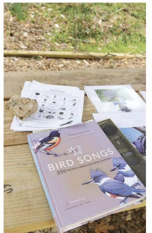
The Birdathon Bingo kid’s station at the Spring Social.