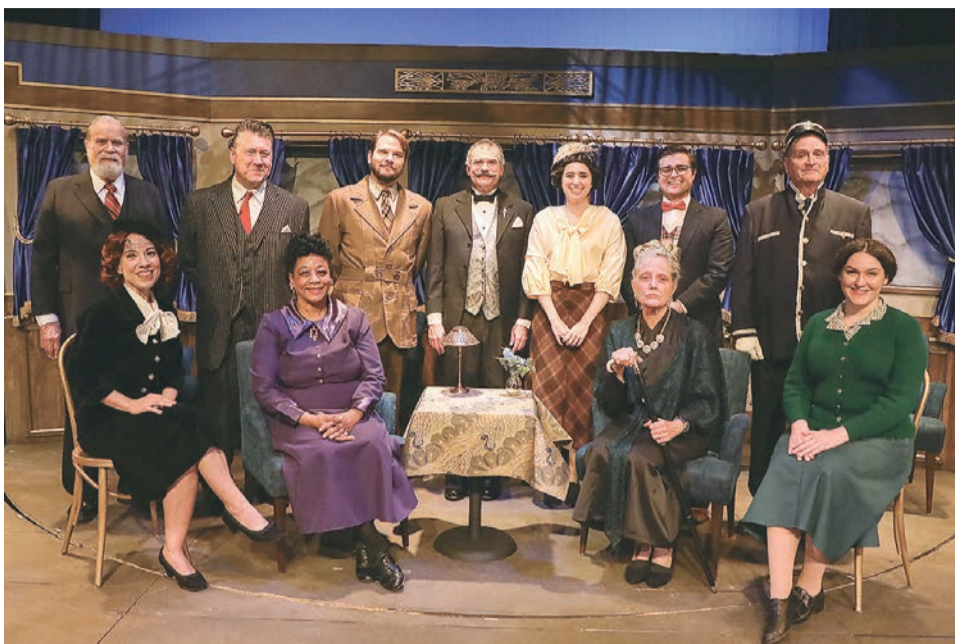
“Agatha Christie’s Murder on the Orient Express ” will be featured March 23-April 13, 2024, at the Little Theatre of Alexandria. https://thelittletheatre.com/performances/