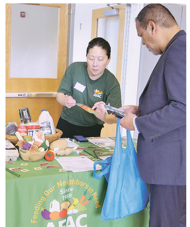
Arlington Food Assistance Center (AFAC) offers information about its supplemental grocery assistance for low-income families in Arlington.