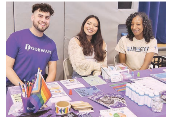
Doorways offers pathways out of homelessness, domestic violence and sexual assault leading to safe and stable lives.