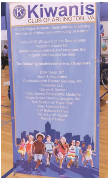
Virginia Hospital Center (VHC) and the Arlington Kiwanis Club, established in 1931, partner to sponsor the Fleet Elementary Health Fair April 20.