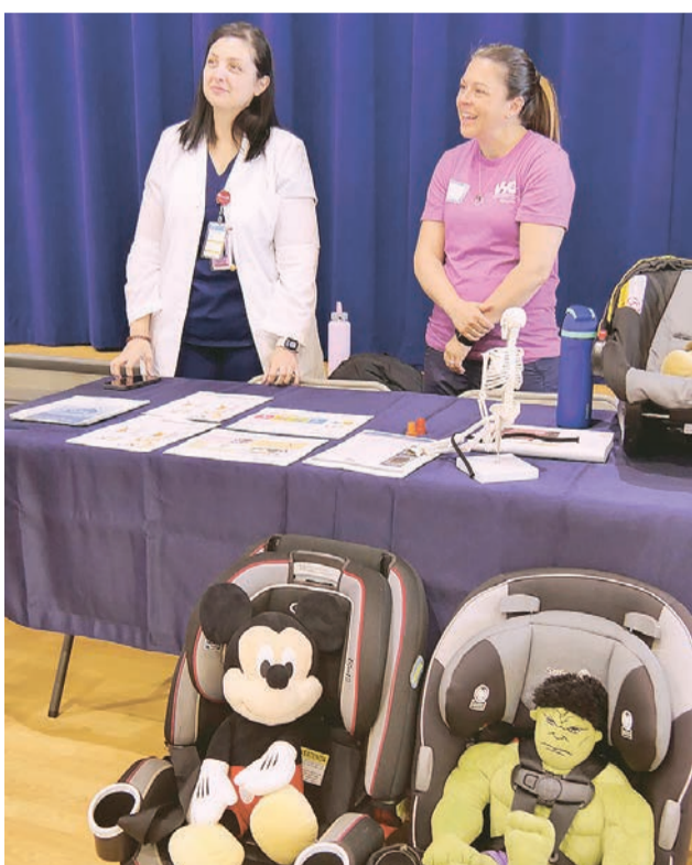
Virginia Hospital Center display demonstrates appropriate Infant and Car Seat Safety.