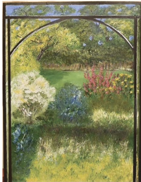
The McLean Art Society Spring Art Show and Sale will take place May 10-12, 2024 in Arlington.