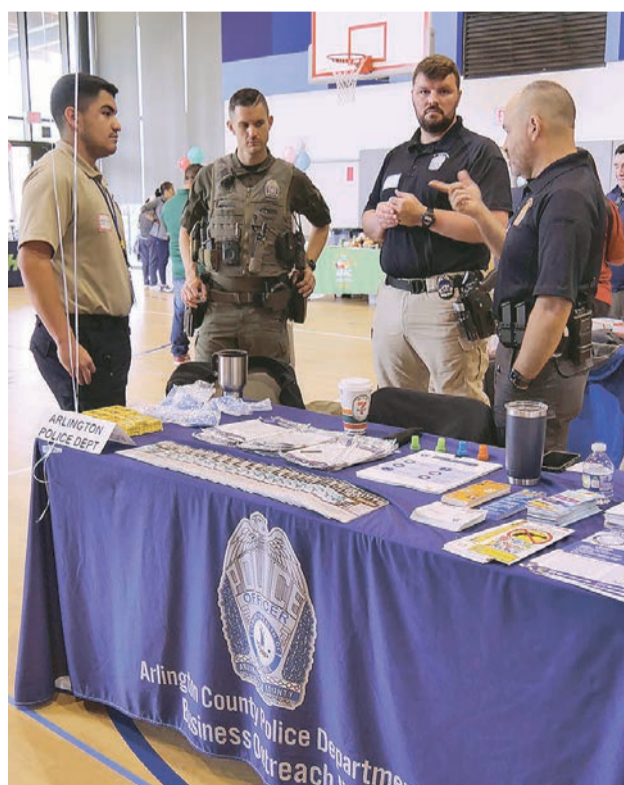
Arlington County Police Department (ACPD) Business Outreach Unit.