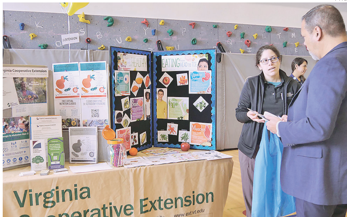
Virginia Cooperative Extension features a display on "Eating From Head to Toe."