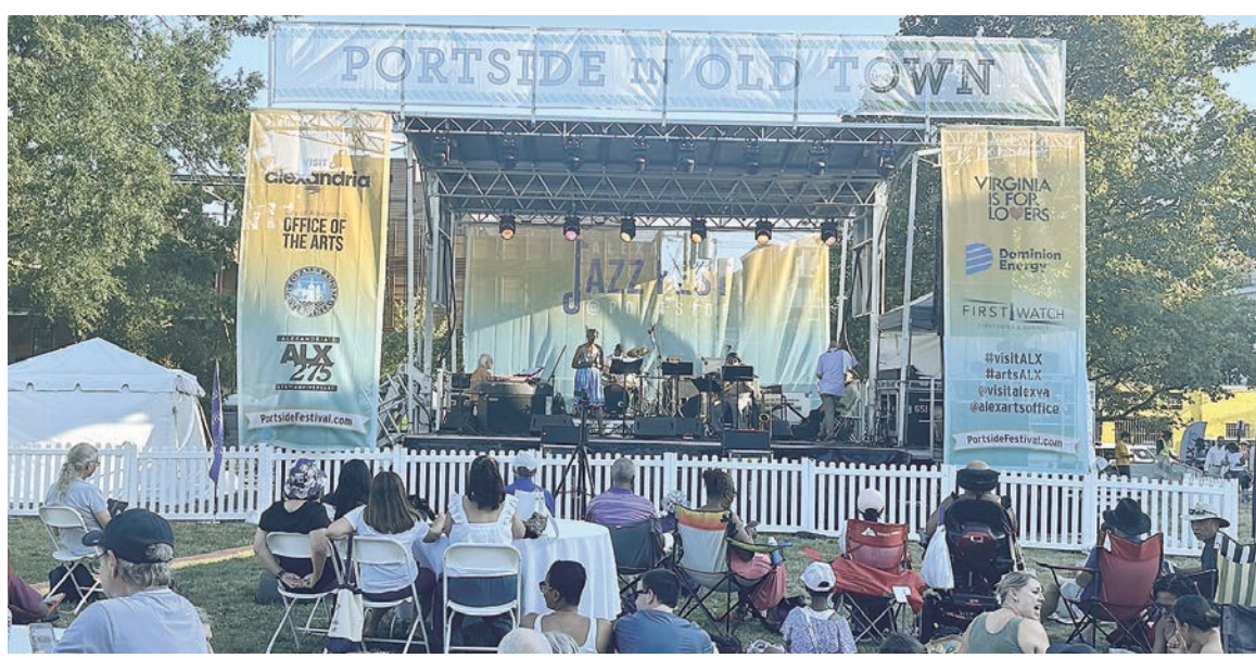
Entertainers perform as part of the Alexandria Jazz Festival June 21 at Waterfront Park. The music festival was slated to kick off the Portside in Old Town weekend celebration, which was canceled due to extreme heat.