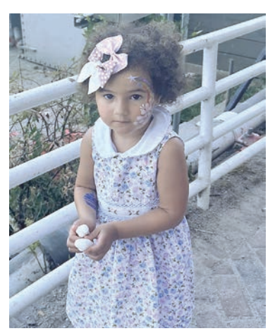
A young girl walks along the waterfront during the Alexandria Jazz Festival June 21 at Waterfront Park.