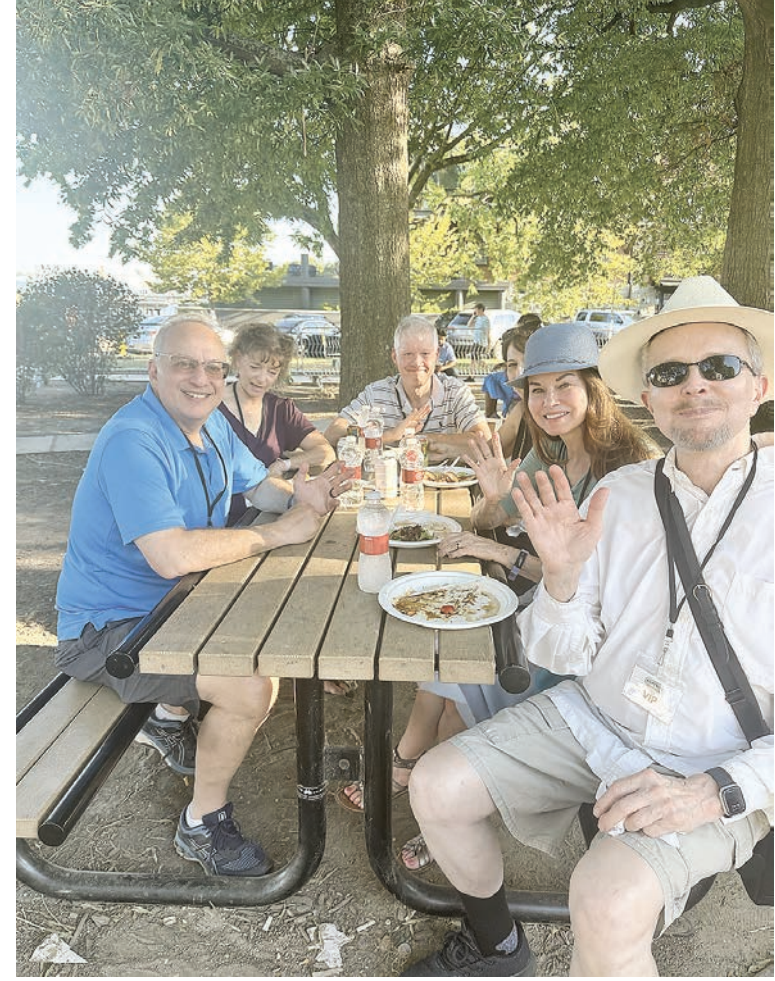
Soaring temperatures didn't hinder the fun for friends at the Alexandria Jazz Festival June 21 at Waterfront Park.

Vendors were on hand to provide refreshments while many attendees brought their own picnics to enjoy under the stars. Some were especially prepared for the extreme heat.