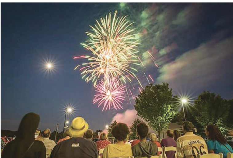
Workhouse Arts Center will have fireworks on Saturday, June 29, 2024 in Lorton.

used children's books, fiction, history, biography, home and garden, cooking, crafts, sports, religion, travel, CDs, DVDs, and more. Unless specially priced, $1 for hard backs and large paperbacks, and 25 cents for mass market paperbacks. Visit https://www.fairfaxcounty.gov/ library/branches/friends-of-sherwood-regional.