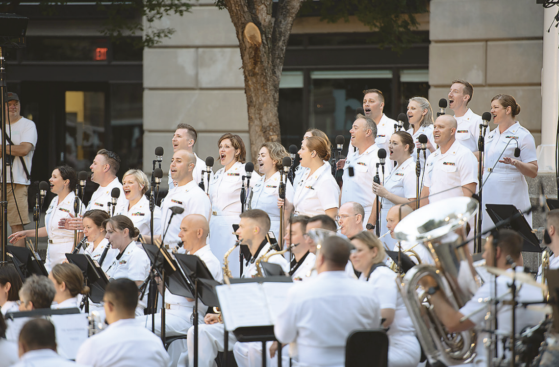
The U.S. Navy Band Sea Chanters will perform on Thursday, June 27, 2024 at the National Museum of the Marine Corps in Triangle.

Pride Night Out. 5-8 p.m. At Springfield Town Center, Grand Court area, Springfield. In support of Safe Space NOVA, an organization dedicated to providing a safe,