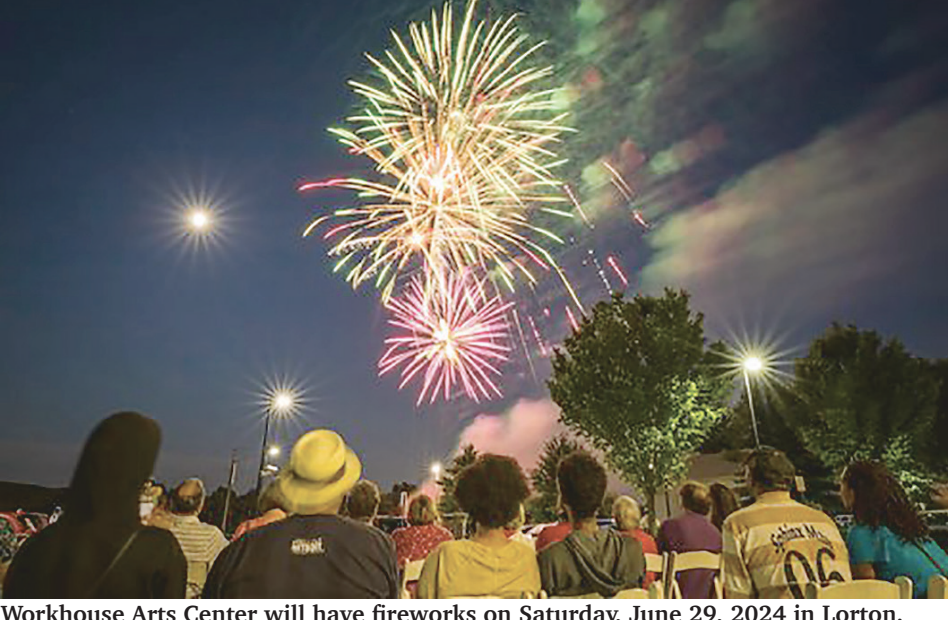
Workhouse Arts Center will have fireworks on Saturday, June 29, 2024 in Lorton.

Wakefield Through Oct. 30, 2-6 p.m. Wakefield Park, 8100 Braddock Road, Annandale