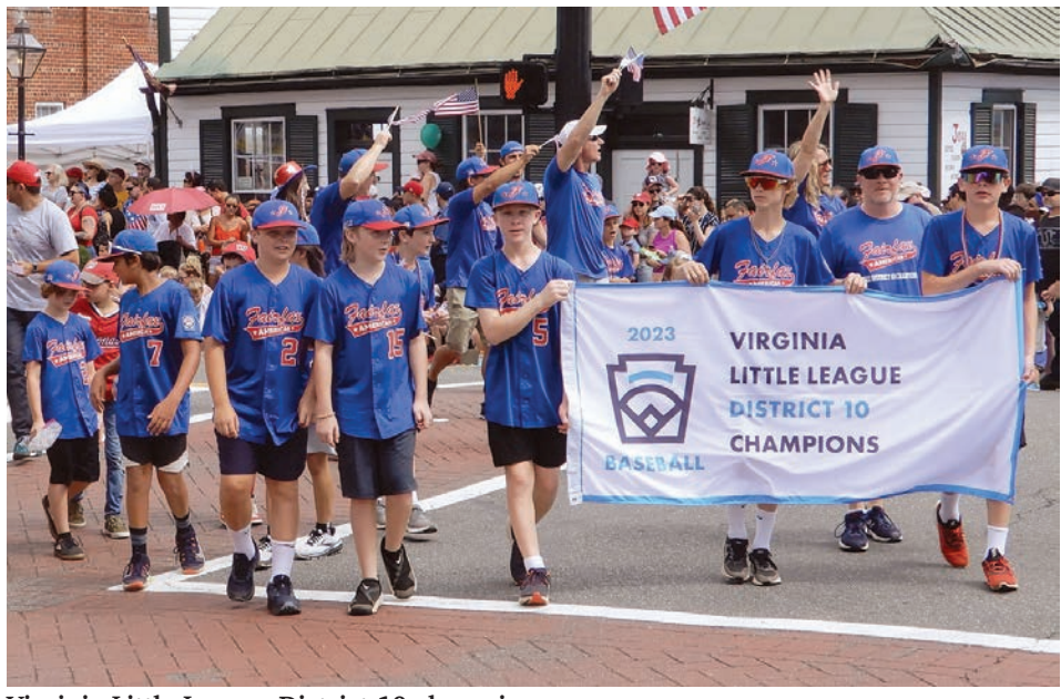
Virginia Little League District 10 champions.