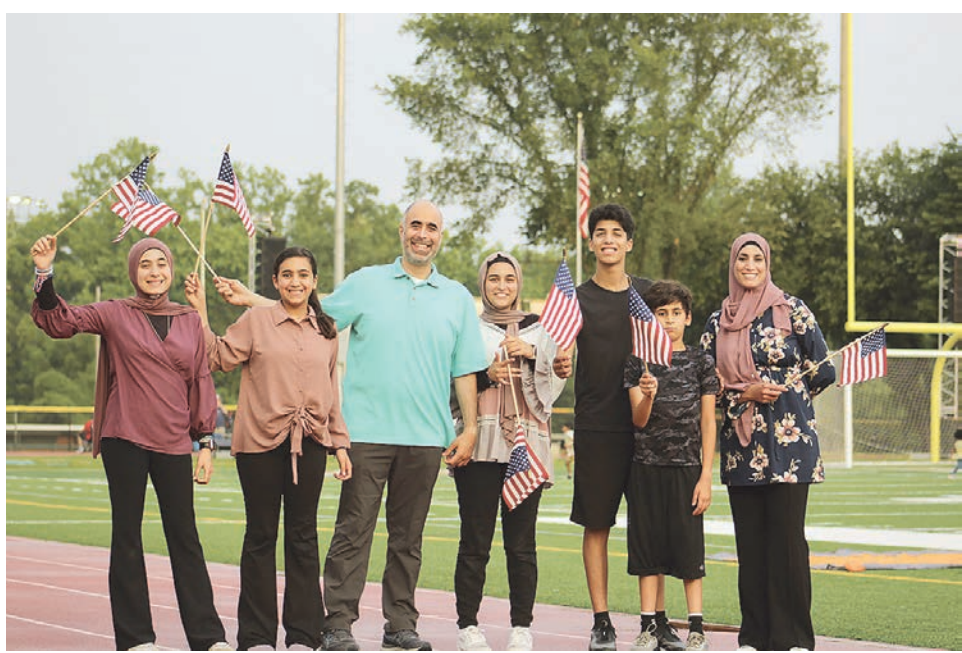
McLean's Independence Day Fireworks Celebration will take place on Saturday, June 29, 2024 at Langley High School in McLean.