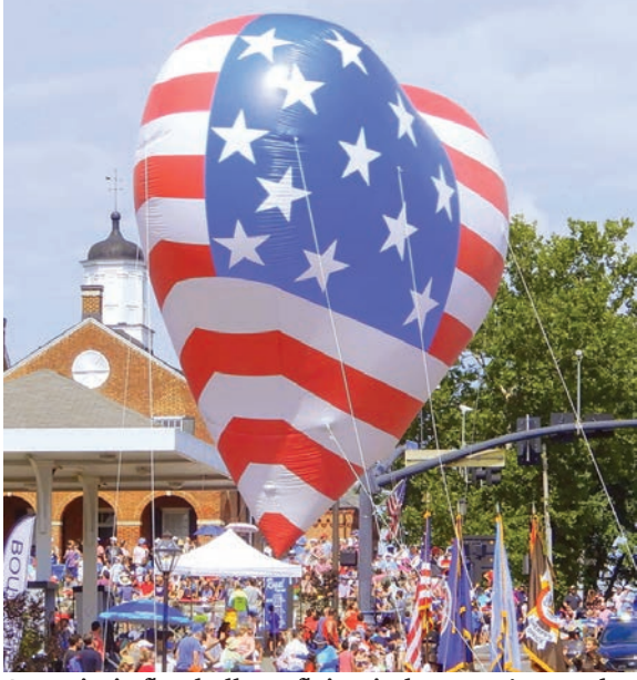
A patriotic flag balloon flying in last year's parade. Fairfax High Alumni Kazoo Band is always a hit.

The colorful, two-hour extravaganza will feature a multitude of bands, gigantic balloons, floats, superheroes, dancers, cultural performers, firefighters, police, princesses, political dignitaries, bagpipe groups, color guards, clowns and Boy, Girl and Cub Scouts. Local highlights will also include the Fairfax High and Woodson High marching bands, members of the City of Fairfax Theater Co., the Kena Shriners, Fairfax High Alumni Kazoo Band, the Fairfax Jubil-Aires, and the City of Fairfax Regional Library Precision Book Cart Drill Team.