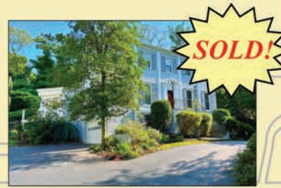
1313 Merrie Ridge Rd McLean, 22101 $1,637,500

Curious what your home is worth? Call to chat with JD and Ed today!