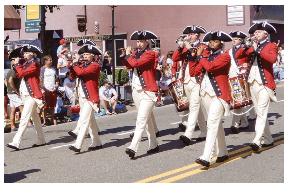
The U.S. Army Old Guard Fife & Drum Corps.