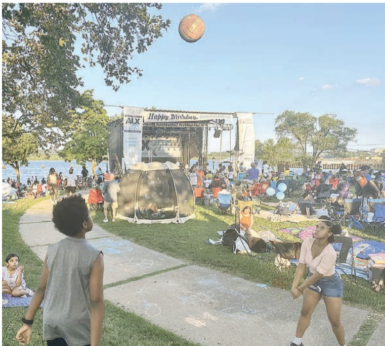
Revelers enjoy a game of volleyball July 13 at Oronoco Bay Park.