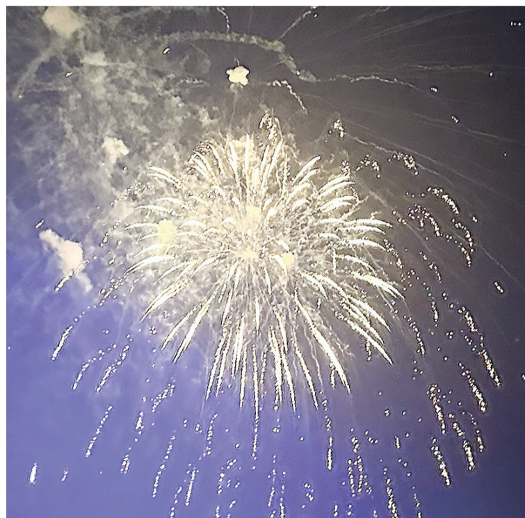
Fireworks light up the sky over the Potomac River as part of the City of Alexandria’s 275th birthday celebration July 13 at Oronoco Bay Park.