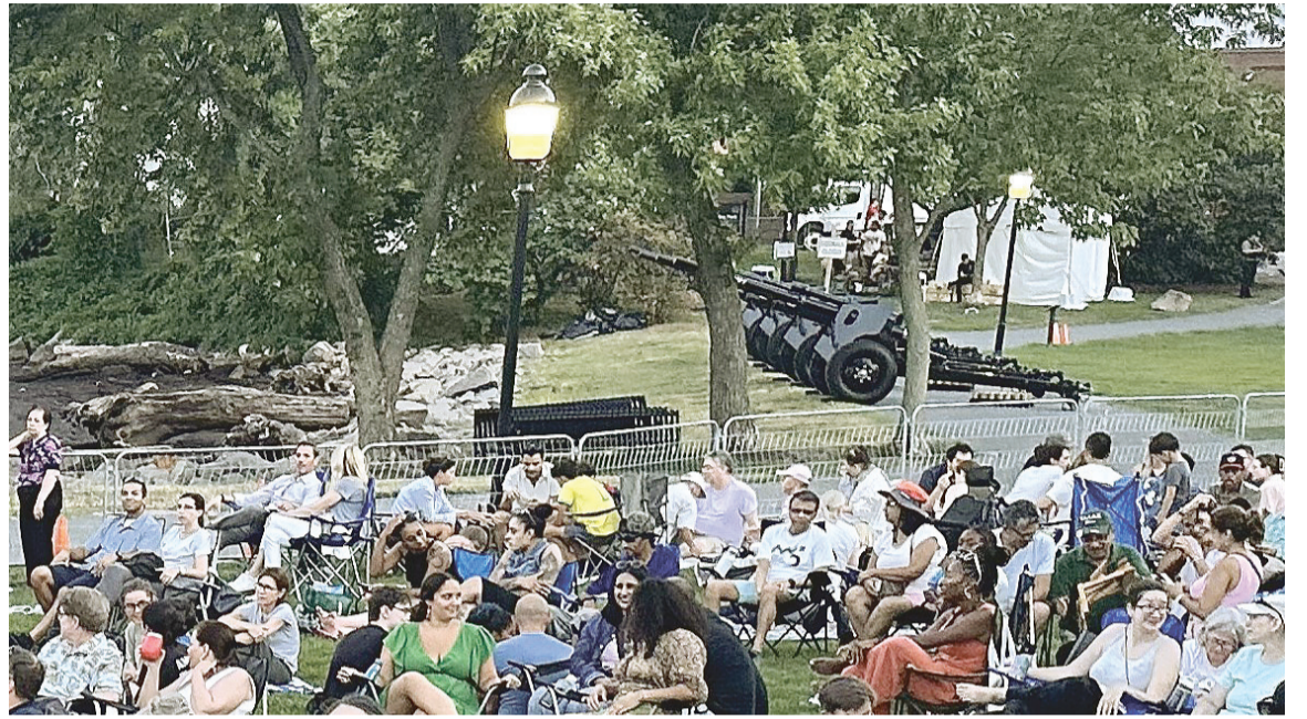
Cannons by the U.S. Army Presidential Salute Battery stand ready for the finale salute July 13 at Oronoco Bay Park.