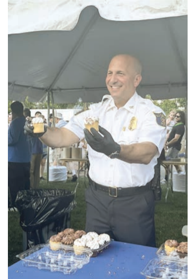
'Come and get it' from Police Chief Raul Pedroso.