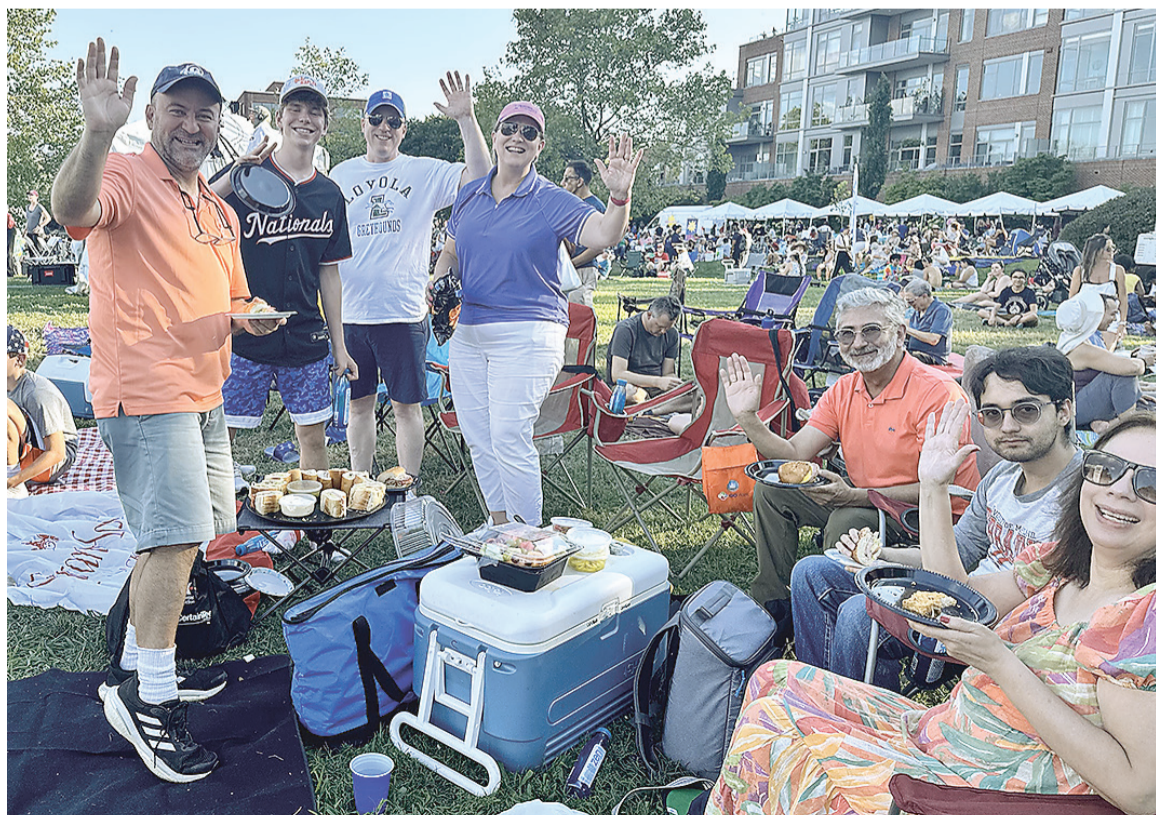
Alexandria friends and neighbors celebrate July 13 at Oronoco Bay Park.