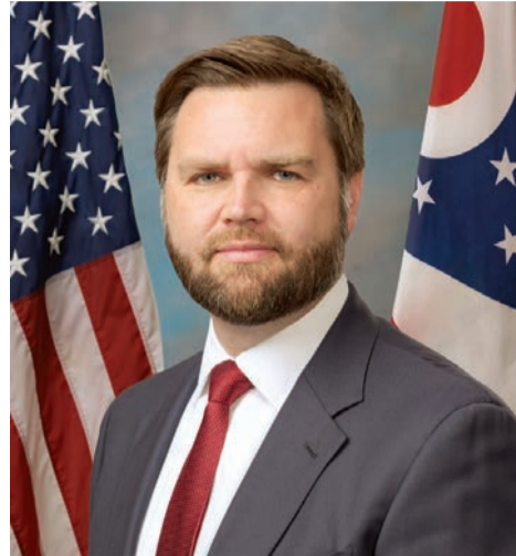
J.D. Vance, a resident of Del Ray, has been named by former President Donald Trump as the Republican nominee for vice president.

A veteran of the U.S. Marine Corps who served in the Iraq War, Vance graduated from The Ohio State University and Yale Law School. A one-time venture capitalist, he wrote the bestselling book, "Hillbilly Elegy," which was turned into a Netflix movie. Vance and his wife have been married