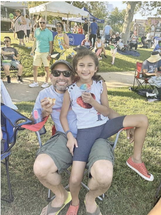
Cool treats help beat the heat at Oronoco Bay Park.