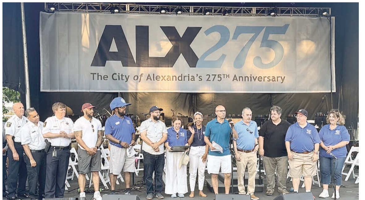
Members of City Council and local officials celebrate the 275th birthday of the City of Alexandria July 13 at Oronoco Bay Park.