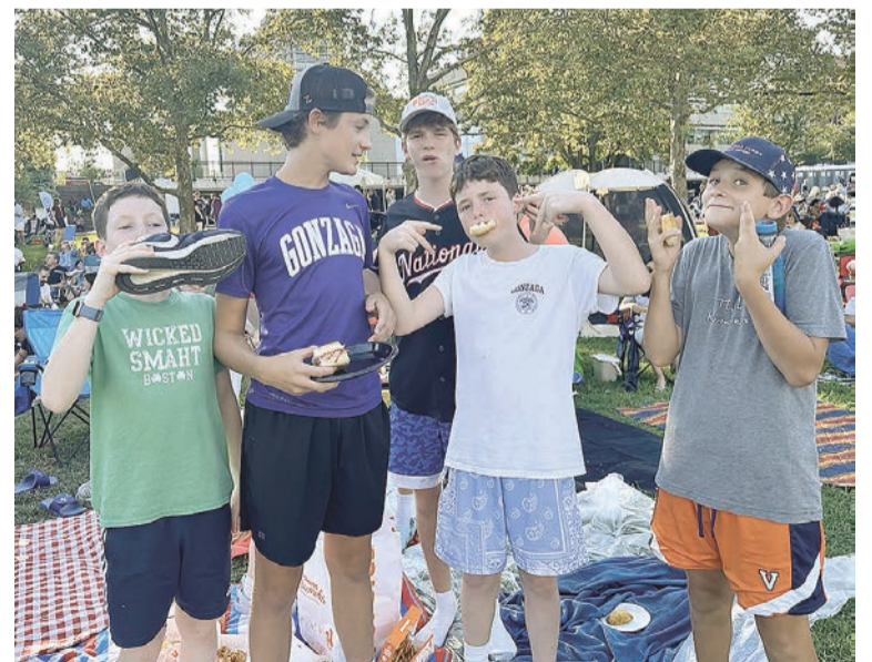
Friends enjoy the July 13 birthday celebration.