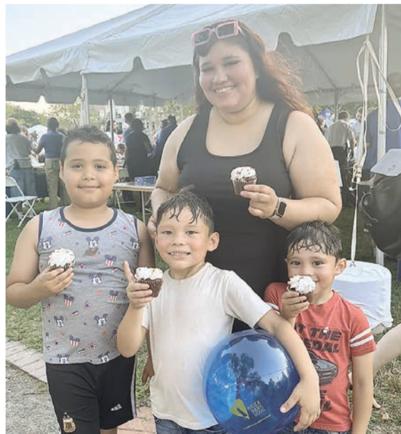
A family enjoys birthday cupcakes at Oronoco Bay Park.