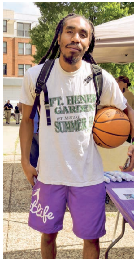
A member of the Green Valley Crew basketball team, heads for the basketball court for his 1:30 game with his ball tucked under his arm. The basketball tournament is scheduled for the entire afternoon of the event.