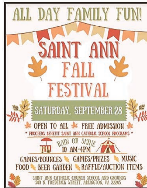
The Saint Ann Fall Festival takes place Saturday, Sept. 28, 2024 in Arlington.