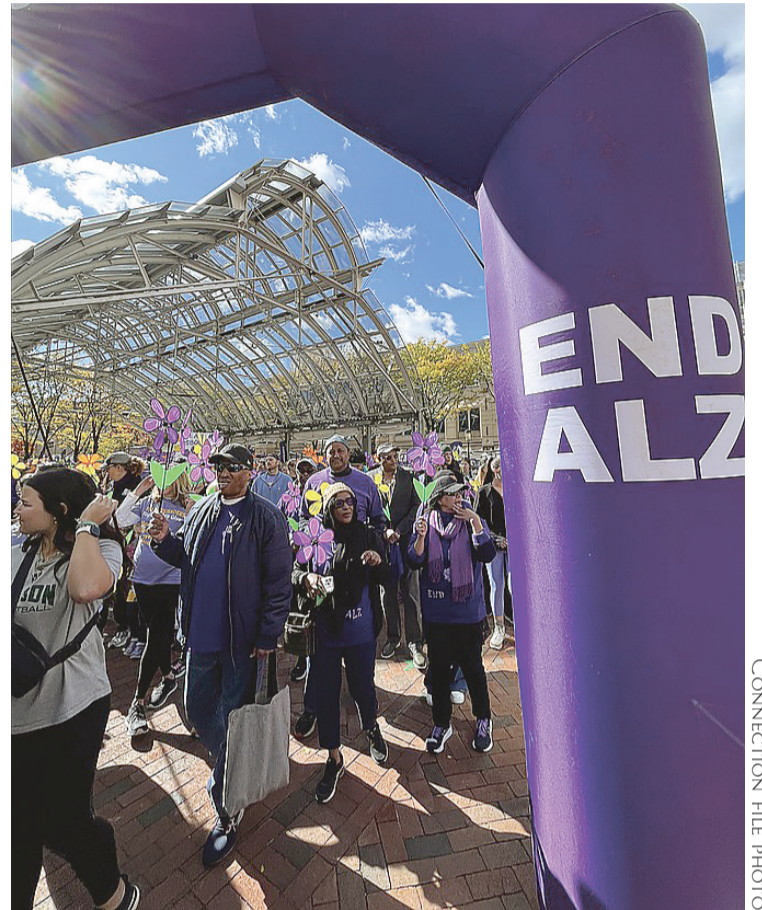
2023 Northern Virginia's Alzheimer's Association Walk to End Alzheimer's, Reston Town Center.

Participation in Walk to End Alzheimer's is free. Walkers are encouraged to raise funds. Visit alz.org/ncawalks or call 800.272.3900.