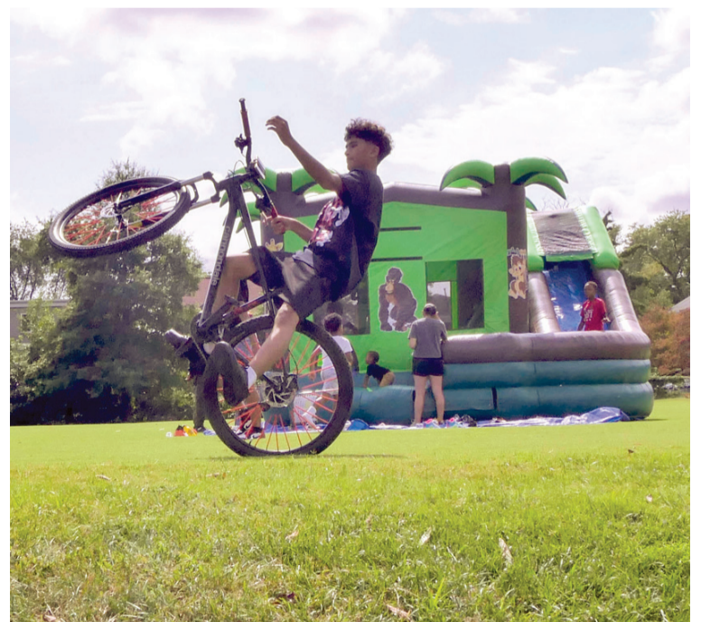
Kids show off their biking skills in the large field behind the vendor booths at Green Valley Day.