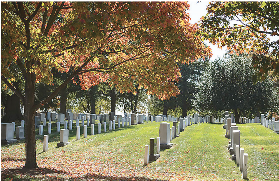
Fall Horticulture Tours take place at Arlington National Cemetery starting on Friday, Oct. 4, 2024.