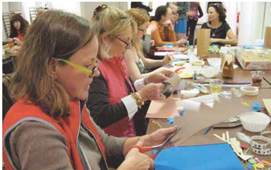
Unleash your creative side while sipping on cocktails at McLean Projects for the Arts Thursday night event, "Cocktails and Creating."

La Cage aux Folles. 8 p.m. Alden Theatre, 1234 Ingleside Ave., McLean. Book by Harvey Fierstein, music and lyrics by Jerry Herman, based on the novel by Jean Poiret. Georges, the owner of a popular drag nightclub in San