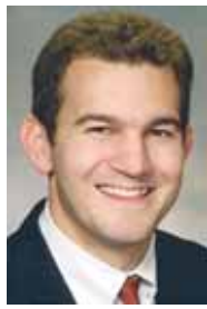
State Sen. Chap Petersen (D-34)