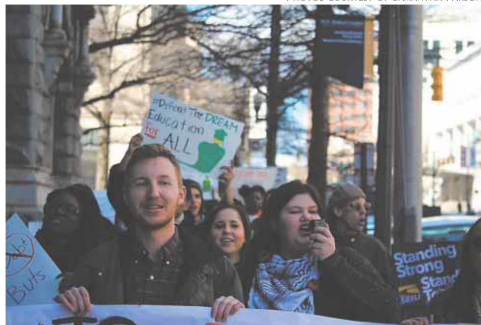
Students shared stories about debt, and what they want Virginia legislators to do about it.