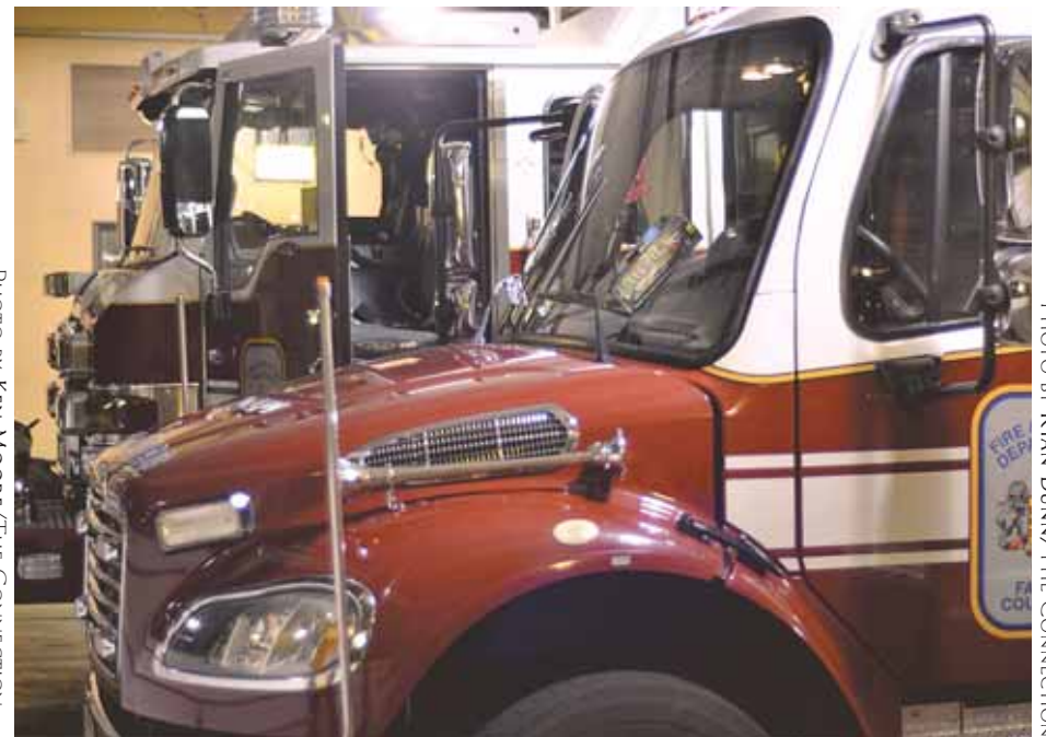
Herndon's new Fire Station is scheduled to be completed this summer.