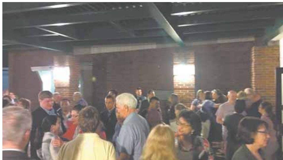
Citizens on both sides of the debate lingered outside Luther Jackson Middle School following the School Board's vote.