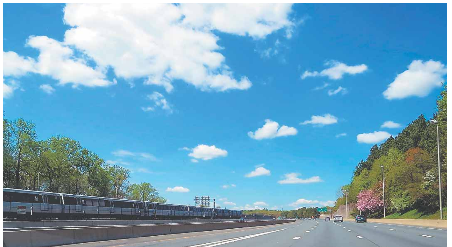
The Town continues to prepare for the coming of the Silver Line, which will help make Herndon, "A Next Generation Small Town."

programmed activities. The site also benefits by being within 1.5 miles of the future Silver Line Herndon Metro Station. The Town will have circulator bus service from the downtown to the future Metro station."