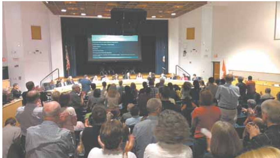
Citizens were actively engaged in the discussion leading up to the Fairfax County School Board's 10-1 vote in favor of adding "gender identity" to the district's nondiscrimination policy.

After Liberty Counsel's announcement the suit had been filed, School Board Chairman