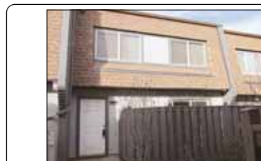
Alexandria $165,000 Beautifully Renovated This 2 BR, 1 1/2 BA, 2 Level townhouse features gourmet Kitchen with SS appliances, upgraded baths & 1st Floor hardwood. It's move-in ready!