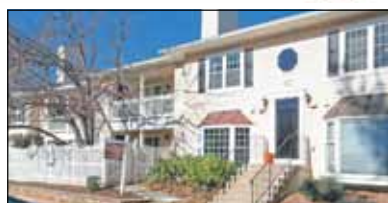
Oakton - $285,000

View more photos at www.hermendorfer.com