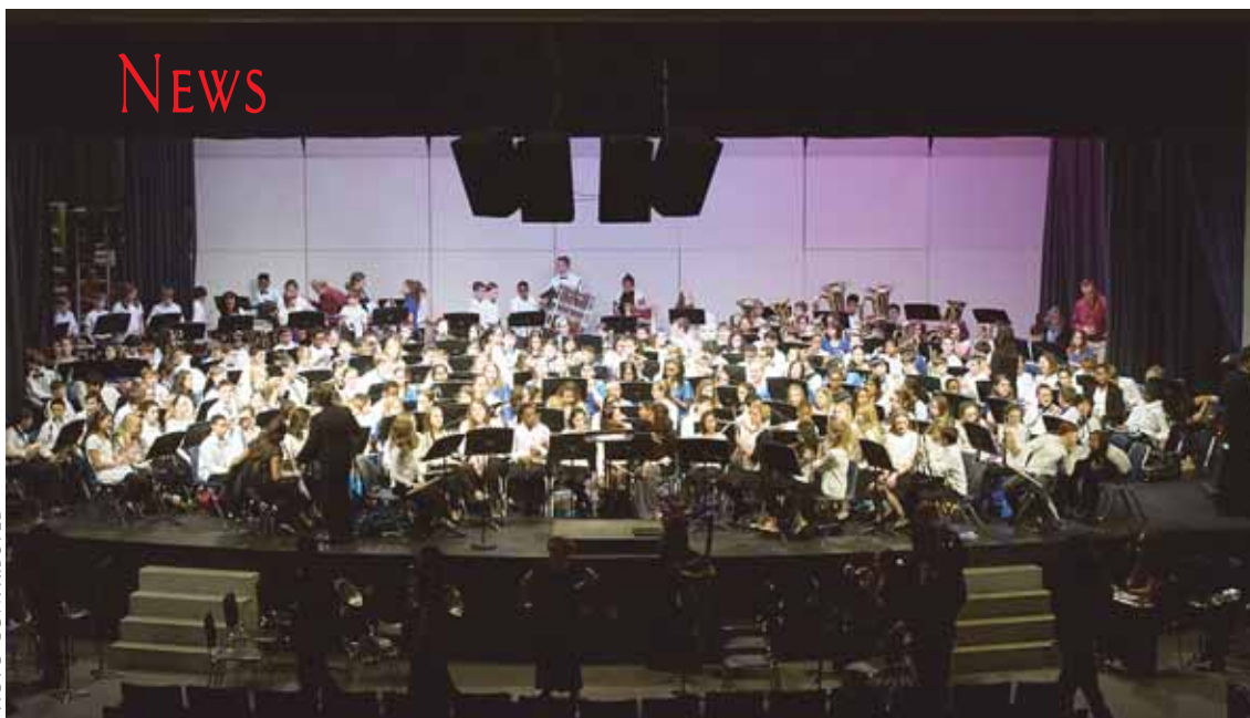
More than 300 talented band students of all ages attended pyramid concert at West Springfield High.