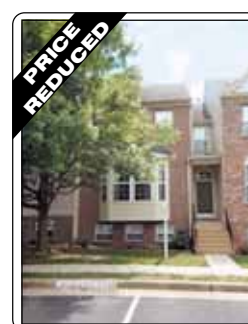
Alexandria $484,000 Must see! Almost 3,000 sq. ft. TH on three levels. Bright & sunny kitchen with hearth and gas FP, upper and lower decks, vaulted ceilings, walk-in closets, soaking tub & separate shower, large basement with ceramic tile floor. Island Creek Elementary School.

suite reno has to-die-for bath w/dual vanities, laundry area, amazing W/I shower, dual W/I closets*Dreamy KT w/SS appls, wine chiller, big eat-in area*Custom gas frpl*Gleaming hdwds*Walkout rec rm plus den/4th & full bath*Green space*Cul-de-sac