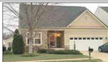
Gainesville Heritage Hunt 55+ COMING SOON UPGRADED BEAUTY! 3BR (2 main lvl), 4BA, Gourmet Kit w/granite, Brkfst, Sun Rm, HDWDS, 2 gas Fpls, LL w/Rec rm, Storage & Den, huge Trex deck, landscaped yd w/irrig syst, Stone front, Front porch, 2-Car Gar. Call for info.