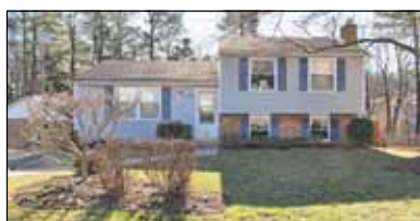
Burke - $440,000

Convenient location in Cardinal Estates community; this bright, 3 BR home features an open floor plan, updated Kit, FP, built-ins, and deck overlooking large fenced backyard!