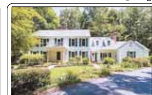
Fairfax Station $939,900

New England charm and Southern hospitality seamlessly blend in Glenver-dant. A home made for enjoying and entertaining complete with updated kitchen and spacious breakfast area nicely located by a wood burning fireplace. Roam through over 5500 square feet including a sunroom and finished basement that offers a full kitchen. The upper level has four large bedrooms and three full baths plus a family den and attic playroom. The exterior features five acres, an inground pool as well as a four stall barn for horse lovers.