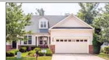
Gainesville Heritage Hunt 55+ $384,900 BEAUTIFUL 3 fin lvls - Golf Course View! 3BR, 3BA, Den/BR 4, Kit w/NEW SS Appls, HDWD, Din, Pam Rm w/Gas Fpl, main lvl MBR w/WIC, Loft, Walkout LL w/Rec Rm & BA (possible in-law suite), 2-car Gar, Deck, Patio, backs to trees!