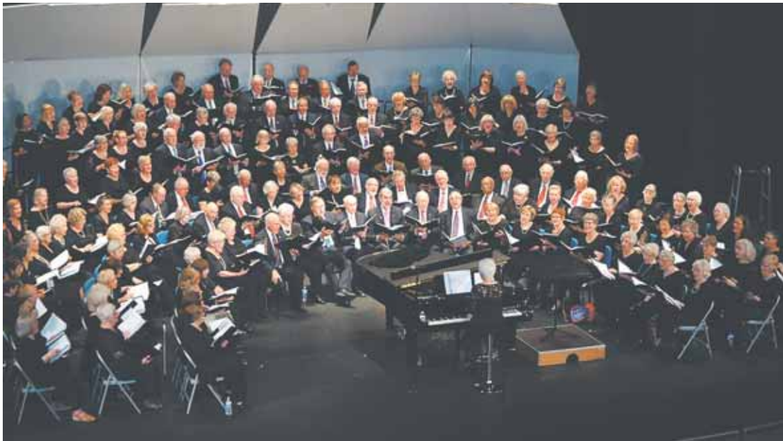
Members of the Encore Chorales receive training from professional musicians, a chance to make social connections and perform challenging choral music.