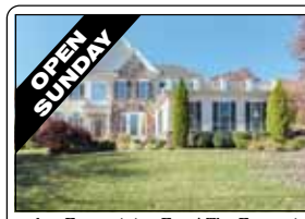
Haymarket $783,400 Gorgeous Home in the exclusive Kendrick section of Piedmont. Over 5,000sf of Finished Space & Open Floor Plan - this home

makes Entertaining Easy! The Expansive Gourmet Kitchen has Upgraded Cabinetry & Stainless Appliances. Large Master Suite has Luxury Master Bath, Sitting Area & Fireplace. 1 Acre Private Lot backs to Woods and offers a Large Sun Porch, Custom Deck & Slate Patio. Easy Access to Atlas Walkway's new entertainment complex and I-66, Routes 15 & 29.