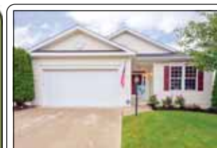
Four Seasons $427,500

Main level living for the active adult (55+) featuring main level master suite, open concept kitchen & family room, sunroom, screened porch and more! You'll love the finished walk out lower level for guests, a total of 3200+ sq ft on 2 levels, 3 bedrooms, 3 baths! Great community with indoor & outdoor pools, clubhouse, and more! Easy access to I95 and shopping. Come live the good life at Four Seasons!