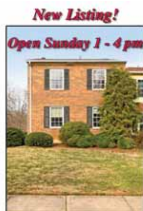
Springfield • $409,000 • Shannon Station