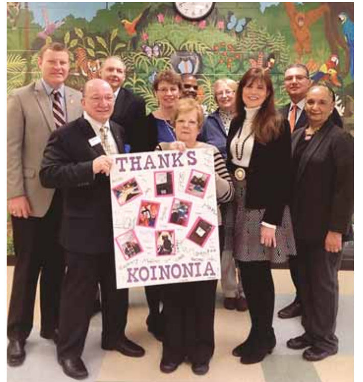
The Koinonia Foundation donated 18 Apple iPads to the Key Center School in Springfield on Feb. 16.

In some classrooms, they can be linked to the teacher's computer to make the lesson more accessible and easy to follow for the student.