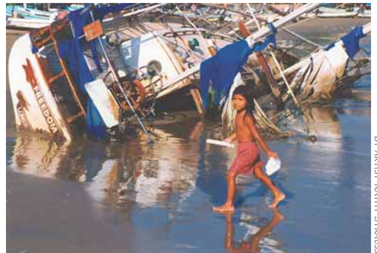
BY ARTIST KATHY STRAUSS

Through Feb. 28 Fairfax Public Access (FPA), will premiere a special series of new movies and documentaries throughout February, in recognition of Black History Month. The specials will run at various times on Verizon FiOS TV and Cox Communications in Fairfax County, and by Comcast in Reston. The specials will air on FPA CHANNEL 10, FPA INTERNATIONAL CABLE 30, and FPA SPIRITUAL TV 36.