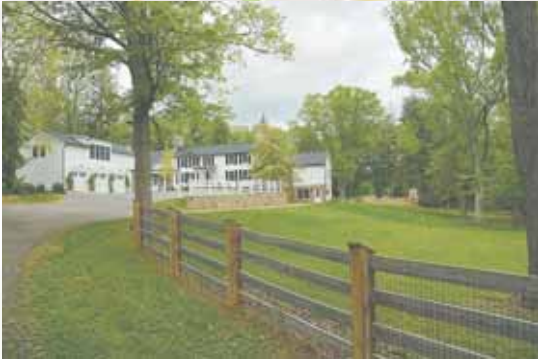
4 700 River Bend Road, Great Falls — $2,570,000