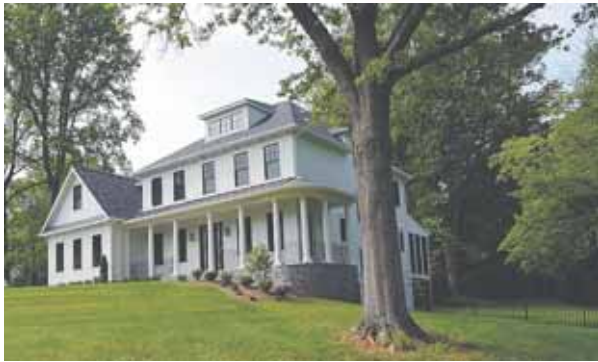
7 1100 Delf Drive, McLean — $1,875,000