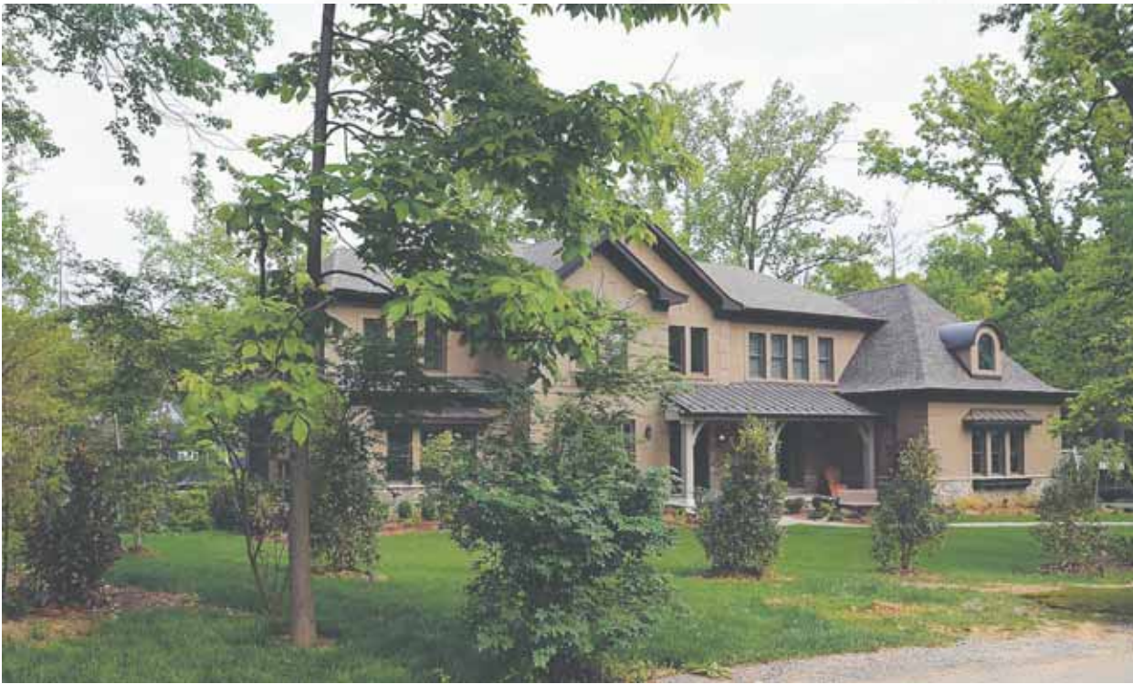
1 1886 Massachusetts Avenue, McLean — $3,395,000