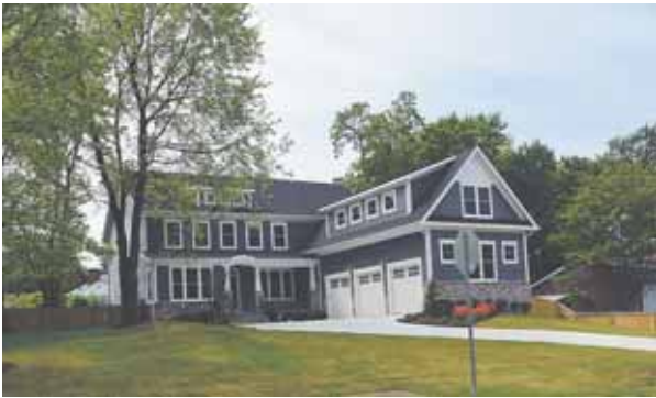
9 7209 Davis Court, McLean — $1,720,000