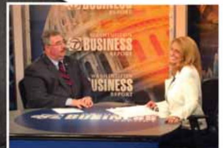
On the set of ABC News Channel 7