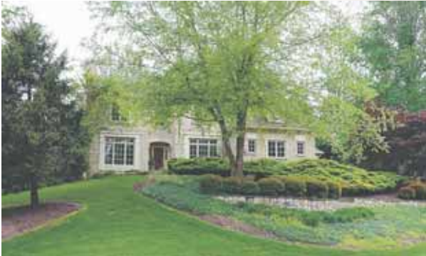
10 10917 Shallow Creek Drive, Great Falls — $1,610,000

IN MARCH 2017, 28 GREAT FALLS HOMES SOLD BETWEEN $2,800,000-$665,800. 89 HOMES SOLD BETWEEN $3,395,000-$170,000 IN THE MCLEAN AND FALLS CHURCH AREA.