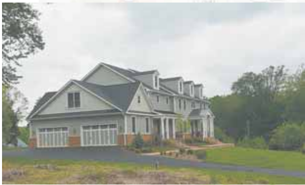
5 10477 Springvale Meadow Lane, Great Falls — $2,500,000