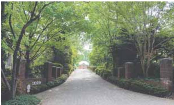
6 1029 Savile Lane, McLean — $2,395,000