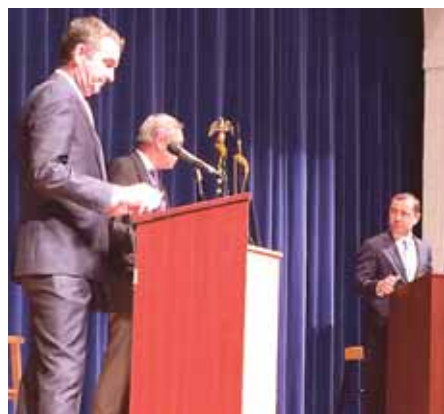
Lieutenant Governor Ralph Northam and former U.S. Rep. Tom Perriello (D-5) debate in Fairfax County.