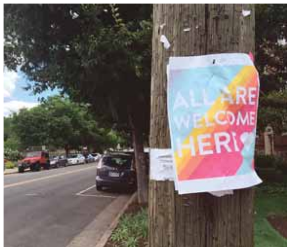
Messages of support shared in Del Ray in reaction to racist flyers posted.