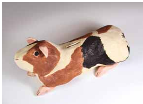
Piggy Bank by Tracie Griffith