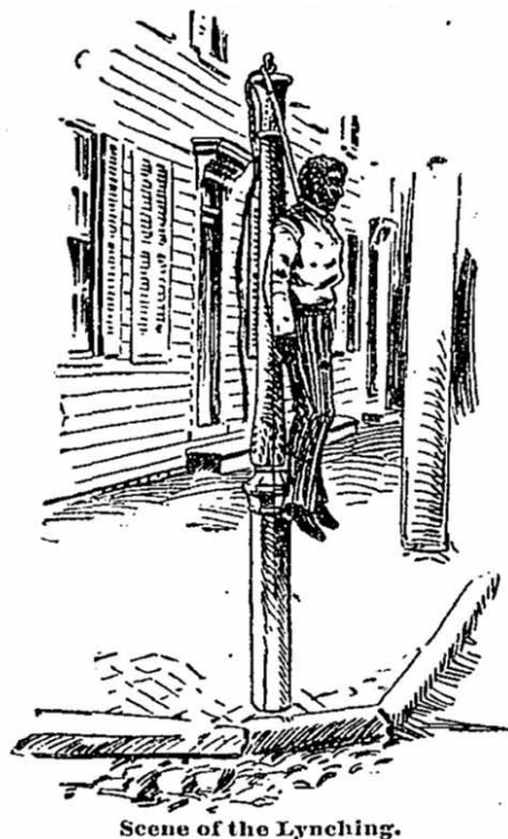
Scene of the Lynching.

The crowd spread to other nearby stores, where more rocks were thrown through windows and a fire was ignited. As the night