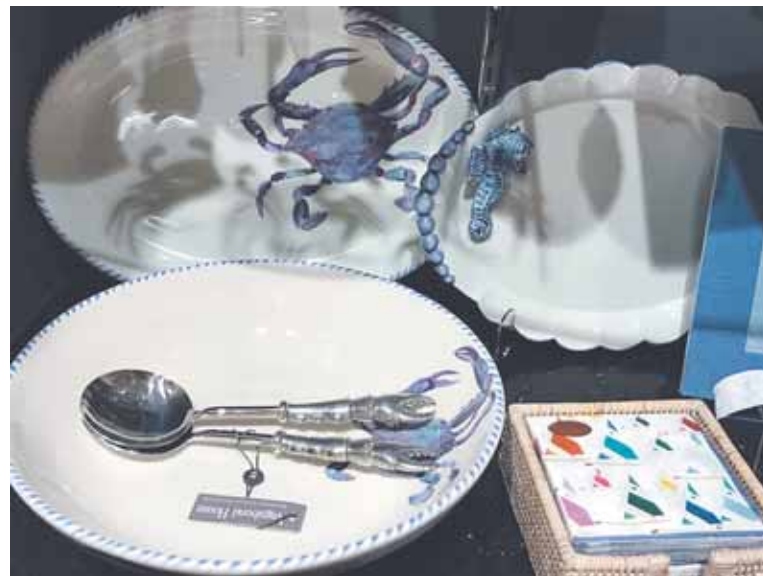
Sea-themed serveware in blue help create an elegant tone for summer entertaining.

"Keep it casual by presenting family-style dishes down the center of the table," added