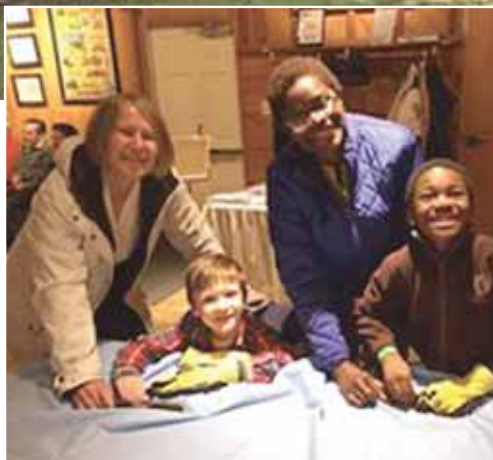
Holiday Craft Day promises fun for all ages.