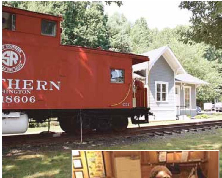
Fairfax Station Railroad Museum

❖ The Fairfax Station Railroad Museum will host a Victorian Tea on Sunday, Dec. 17, 2017 from 1-4 p.m. Enjoy the exhibits and artifacts while sampling different teas and small sweets with family and friends. No reservations necessary and the tea is included with admission. Museum members and under 4, free; ages 5-15, $2; 16 and older, $4. The Museum is located at 11200 Fairfax Station Road in Fairfax Station. Visit www.fairfax-station.org or www.facebook.com/FFXSRR . Call 703-425-9225.