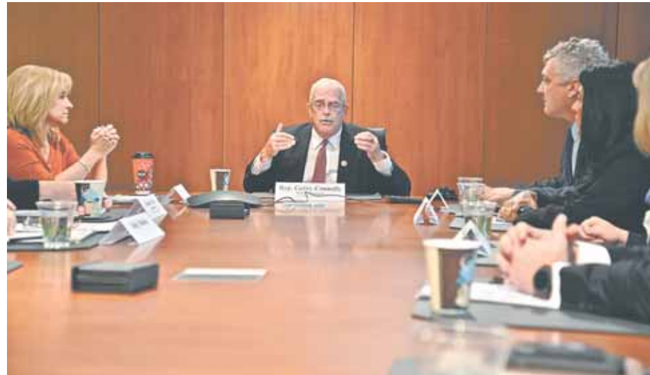
U.S. Rep. Gerry Connolly (D-11) meets with local leaders to discuss the consequences of the proposed Senate and House GOP Tax Reform Bills. Connolly admitted from the start that he wasn’t there to “sing their praises.”

“1981, 2001, 2003. The Reagan and Bush tax cuts. So disastrous that they had to enact tax increases in 1982, 1983, 1984, 1987 and 1990” to raise the needed funds. “Then in the early 2000s, President George W.