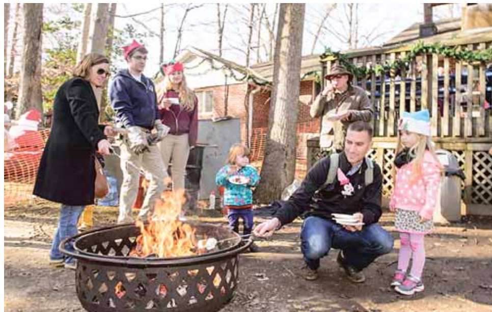
Winter Wonderland at Burke Lake Park features Holiday Express Train Rides, Caroler's Carousel, Gingerbread Man's golf, and visits with Santa.