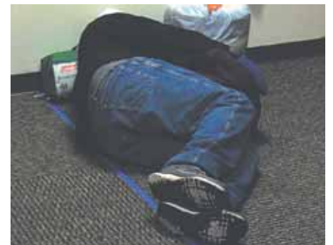
One of 50 homeless people who spent the night at Annandale United Methodist Church.