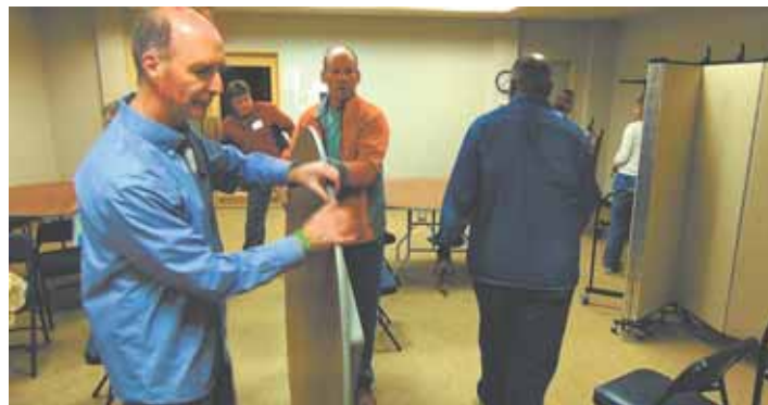
Volunteers take down the tables used for dinner for the homeless.