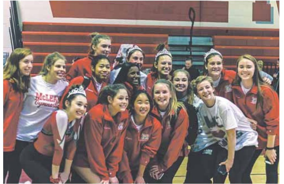
The McLean Highlands Gymnastics team celebrating after winning the six-team meet Thursday night.