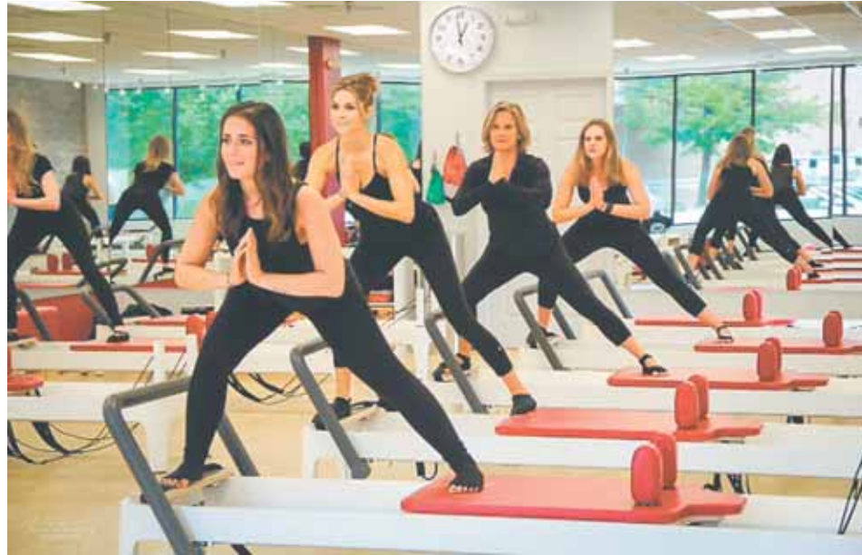
RTR Pilates recently opened in Great Falls Center.