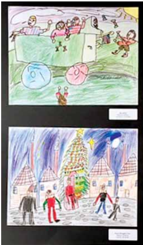
The Great Falls Elementary Art exhibit may be found in the meeting room of Starbucks in the Great Falls Village Center.