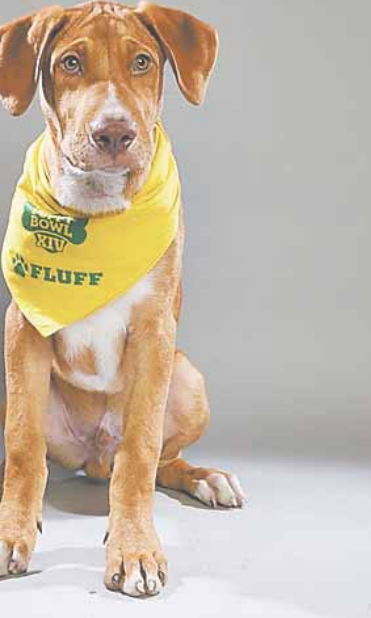
Alvin, a member of the Puppy Bowl’s Team Fluff

This initial mission turned into a rescue of far more than three dogs. That day, the OPH duo ended up rescuing 26 dogs. They had to think and act quickly, using social media to identify volunteers and foster pet parents.