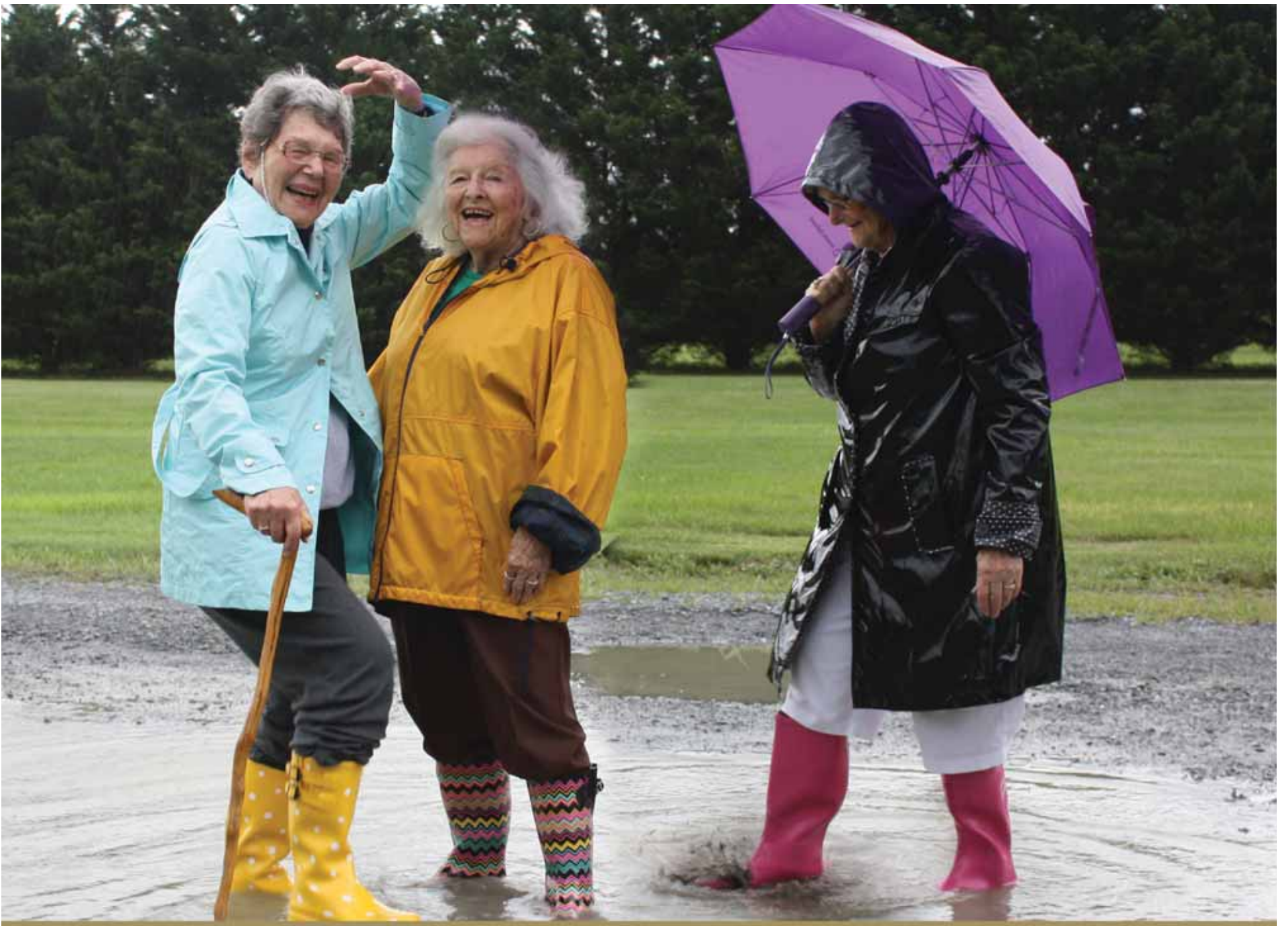
Brandywine residents since 2014