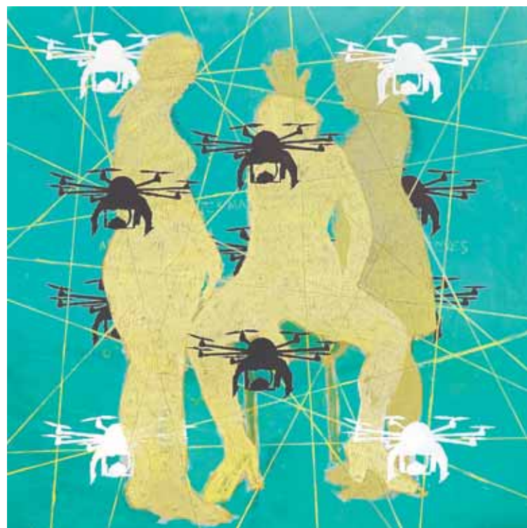
"Line of Sight," Oil and Graphite by Beverly Ryan.