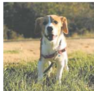
A rehabilitated Bastian went on to be adopted in January after the Alexandria community donated funds for multiple surgeries and follow-up treatments for him.

If you would like to help the Animal Welfare League of Alexandria be prepared for medical emergencies like Bastian's in the future, or to help them address animals in their care now who have chronic medical conditions, please consider making a donation to Sarah's Fund at AlexandriaAnimals.org/donate .