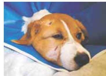
A beagle-mix puppy called Bastian arrived at the AWLA with a severely broken jaw.

Bastian's first surgery was scheduled only days later, and while he waited for his adult teeth to grow in so the second surgery could take place, he enjoyed all the love and mushy food he could get in the home of an amazing foster caregiver. In December, the dentist extracted several of his adult teeth and declared Bastian's jaw healed, and he was ready to find his home. He would always have some special medical needs because of his early trauma, so the AWLA developed a special application for potential adopters to make sure they were prepared to handle the appointments and expenses associated with his care. From a pool of many amazing candidates, the perfect adopter was found in early January. After his long journey, where he found so many friends and supporters, Bastian was finally home.