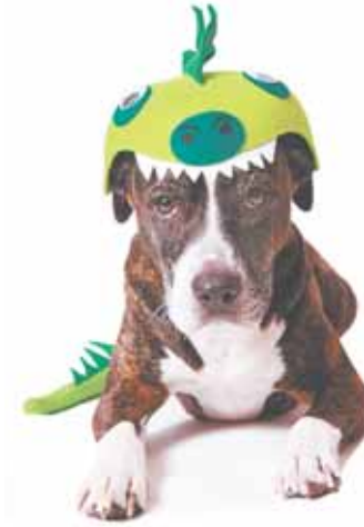
Zoey, Alexandria's 2018 Animal of the Year, looked fetching as an Irish green dragon.

In late September, a beagle-mix puppy was brought to VCA Alexandria Animal Hospital, one of the