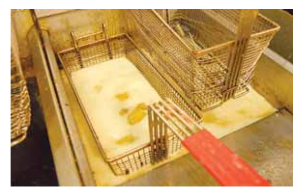
Chef Nabin Paudel lowers calamari into hot fat to get crispy