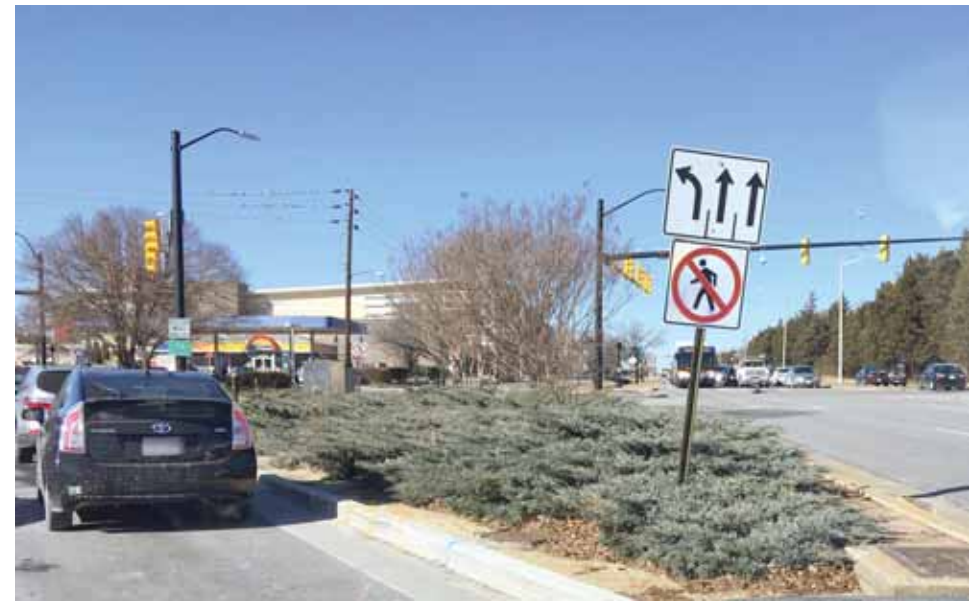
Braddock Median: Before beautification