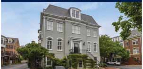
Old Town | $1,699,999

Potomac River views from all 4 levels in this meticulously maintained residence in Ford's Landing. This home has been renovated, updated, & boasts 3 bedrooms, 2.55 baths, & hardwood floors. 2-car garage. Walkable lifestyle & sunrises over the water included! 2 Franklin St. Kristen Jones 703.851.2556 www.AlexandriaByKJ.com