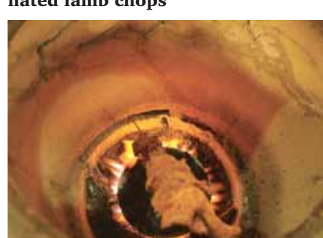
Roasts lamb chops in Tandoori oven