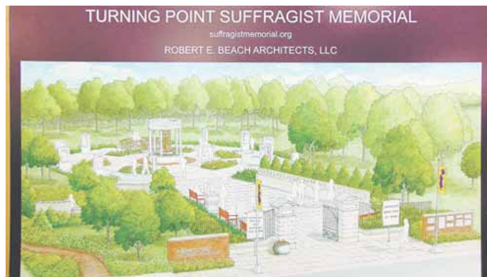
An artist's rendering of the Turning Point Suffragist Memorial.

votes all of her time to building the memorial, gave a presentation of the movers and shakers in the Women's Suffrage Movement, starting with an audio of the Declaration of Sentiments — the document that changed course of women's lives in Seneca Falls, N.Y., in 1848. It was signed by 68 women and 32 men at the convention.