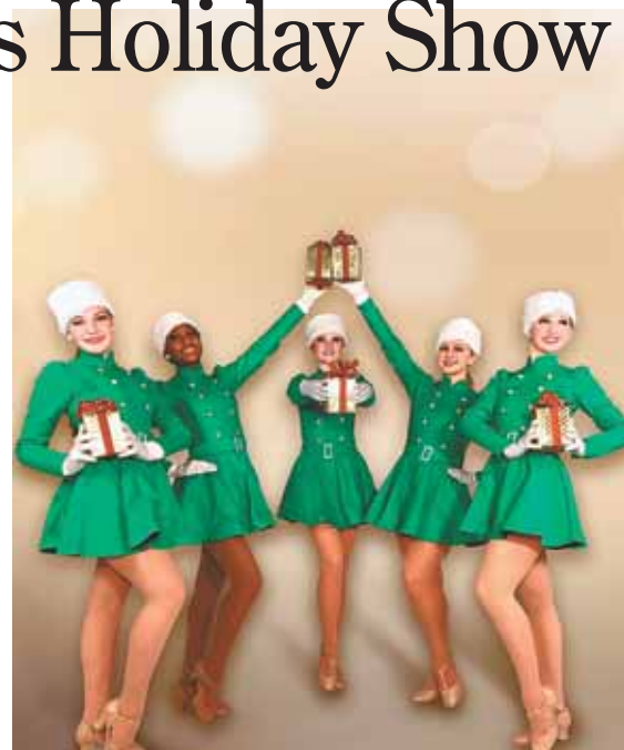
Dancers rehearse a number from Encore's new show, “An Invitation to Christmas.”

“As a group, we put so much passion and love into our shows,” she continued. “So when we see a big