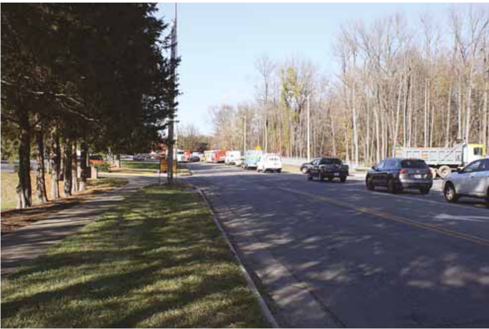
This traffic jam leads up to the one-lane underpass.