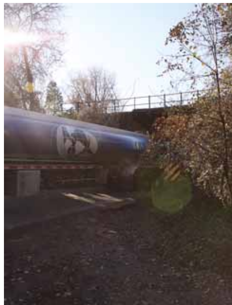
Trucks are a big part of the traffic in this industrial area.

Jack Moriarty is a bartender at Fair Winds, a local brewery right next to the bridge. He's seen all the traffic backing up and pe-