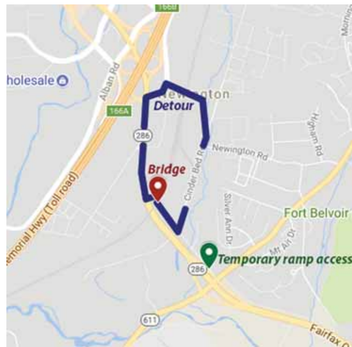
This detour map on the bridge webpage routes traffic right down Cinder Bed Road to the underpass.

MAP BY THE VIRGINIA DEPARTMENT OF TRANSPORTATION