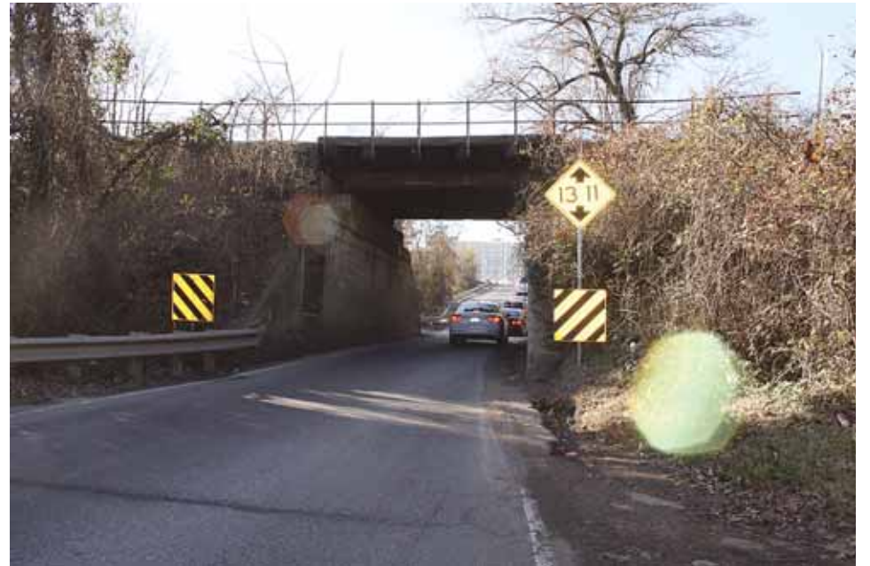
The concrete is crumbling in places at the Cinder Bed Road underpass: Changes to the outdated underpass are being studied.