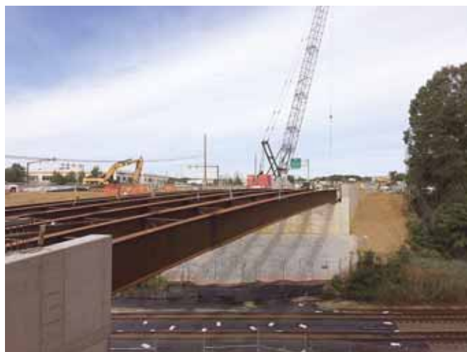
When completed, this new VDOT bridge should provide some relief to the Cinder Bed traffic jam.