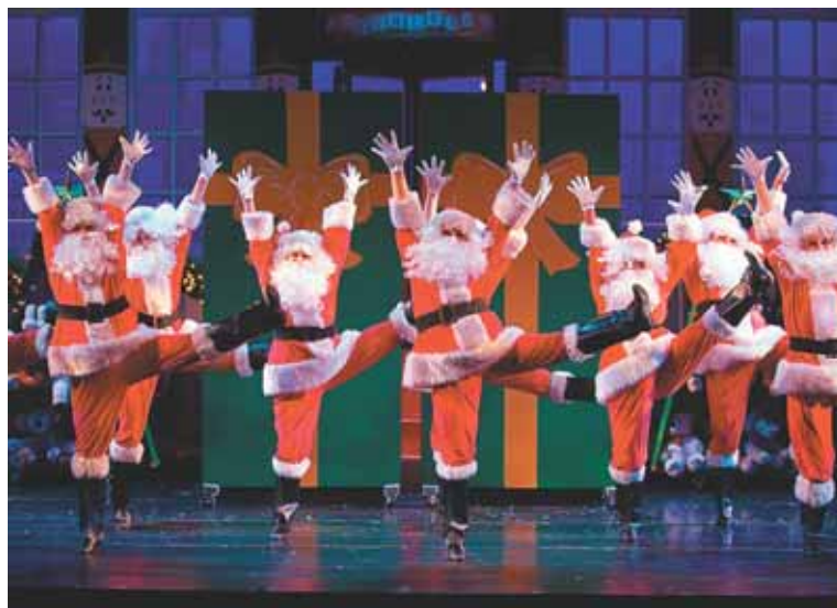
Multiple Santa Clauses will entertain during Encore's upcoming Christmas show.

Tickets range from $19-$26 via www.encore-tap.org or 703-222-5511. Location: Richard Ernst Theater, NOVA campus, 8333 Little River Turnpike in Annandale.