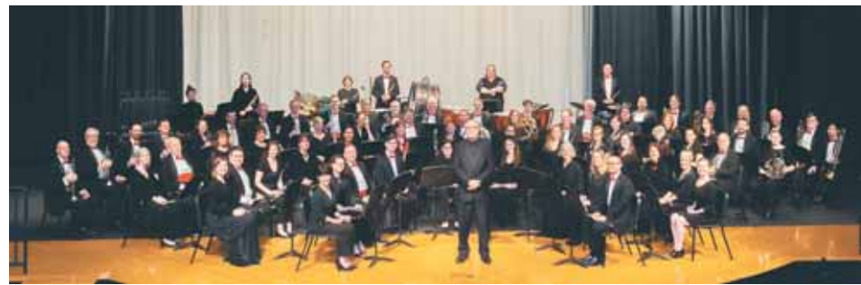
The Main Street Band on stage at its 10th Anniversary Celebration in 2019, is a vibrant young band that includes talented amateur musicians from Northern Virginia.

Lysistrata. 8 p.m. at deLaski Performing Arts Building, A105, TheaterSpace, on GMU's Fairfax Campus. Lysistrata persuades the women of