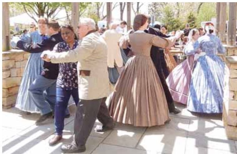
Arlington House Victorian Dance Society members dance with residents during last year's Fairfax History Day.