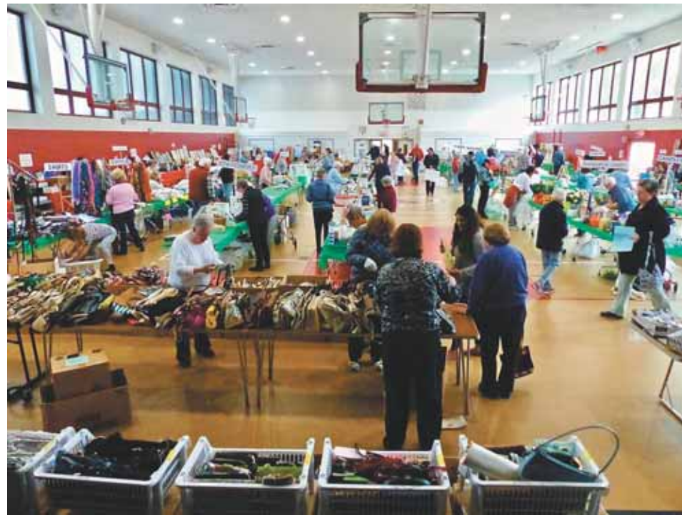
Long lines of tables with merchandise sorted by type fill St. Bernadette's gym for the indoor "yard sale" to benefit one of Springfield's oldest charitable organizations, ECHO.

As part of the Spotlight on the Arts Concert Series, the Main Street Community Band celebrates the arrival of spring with tunes from Doctor Who, Frank Sinatra, Gustav Holst, Stephen Sondheim. During this annual tradition, the band members bring in sweet treats for the audience to celebrate the end of the regular concert season. Come celebrate and mingle with the band after the concert. Sunday, April 28, 4 p.m. at Stacy C. Sherwood Community Center, 3740 Old Lee Highway, Fairfax. Free. Visit fairfaxband.org for more.