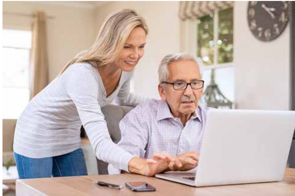
Connecting with your adult children just before and during retirement can help with the adjustment, suggest several experts.